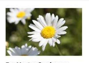
For Master Gardeners