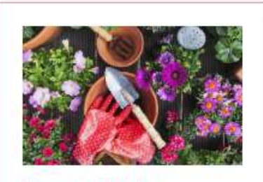
Become a Master Gardener

Direct Contact Demographic Data Worksheet