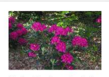
Master Gardener Projects