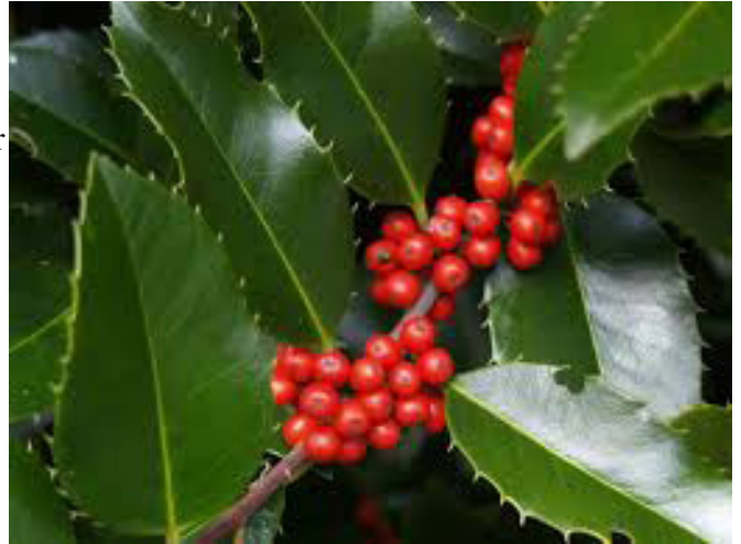
This Ilex x koehneana 'Wirt Winn' is a specimen tree growing in Sue's nursery. The only male pollinator for this holly is 'Ajax'.

One holly is Ilex x koehneana 'Wirt Winn'. New growth has burgundy/purple coloring. This holly is a versatile evergreen shrub with a naturally pyramidal form. It has dense, glossy, bright green foliage on mature foliage. It is a heavy producer of large, red berries. It apparently takes well to shearing, making it an excellent topiary specimen or formal accent to entryways or gardens. Also, it could be great for hedges or screens. The only male pollinator for this holly is 'Ajax'.