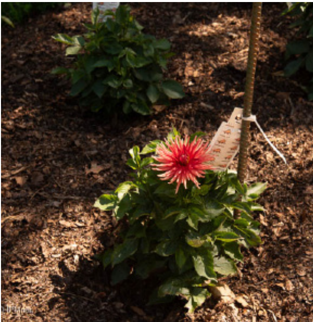
Amblyseius cucumeris sachets set out by the dahlia plants.

When the dahlias came into bloom we released the predator, minute pirate bugs, Orius insidiosus . This predator feeds on nymphs and adult stages of thrips. The females will lay eggs into the 'Purple Flash' banker plants. The nymphs feed on the pepper pollen then when they reach adult stages migrate up to the dahlia flowers to feed on adult thrips. We did this field trial for two years and it worked beautifully both years. If you would like a PDF copy of this project send us an email.