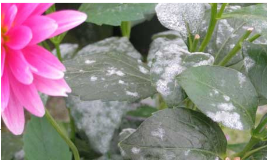
White growth of powdery mildew on dahlia leaves

wet leaves may actually inhibit disease development. The disease is most prevalent in spring and fall, but can develop any time conditions are favorable. Powdery mildew spreads through airborne spores and outbreaks can occur quickly if early infections on lower leaves go unnoticed. Cultural practices that help reduce powdery mildew include increasing plant spacing to help encourage air flow around the leaves and reduce humidity, and removing infected plant parts as soon as you see them (place infected leaves in a bag immediately after cutting to contain the spores). Some biological control products, such as those containing Bacillus or Streptomyces , may help protect leaves from powdery mildew when applied repeatedly according to label instructions before infection occurs. Fungicides containing myclobutanil, propiconazole, potassium bicarbonate, or azoxystrobin are some of the products labeled for powdery mildew control, and rotating between products with different modes of actions (FRAC codes) is important to minimize resistance development. Always read and follow all label instructions when applying fungicides -some products may damage flowers.