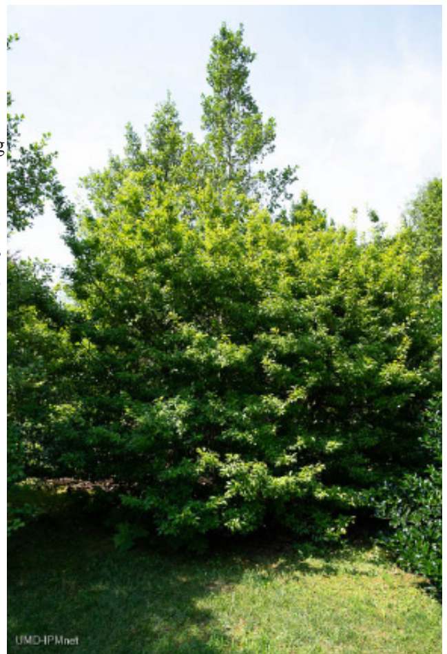
Ilex pedunculosa is considered deer resistant.