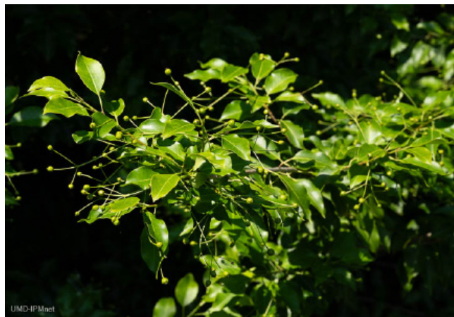
A close-up of early Ilex pedunculosa berries.

Another holly that Sue Hunter showed us is Ilex pedunculosa . This holly is commonly called longstalk holly. Its native range is Japan, China, Taiwan. We had ever seen such an unusual holly. The flower is on a long stalk and individual berries form on these stalks. The foliage is not spiny and it looks like this holly would be deciduous, dropping foliage in winter. Sue tells us it retains its foliage in fall, but it turns a maroon red color. The berries that are on the stalks turn bright red. She says they cut branches for use in holiday decorations, and it holds up for several months. Sue did sell us several, along with a male pollinator. For females to bear fruit,