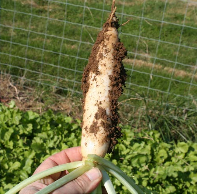
Top and bottom photos: Master Gardeners are trying forage radish as a fall cover crop. The large roots help to aerate tight, clayey soils. The tops of the plants are winter-killed in most of Maryland and decompose in place.