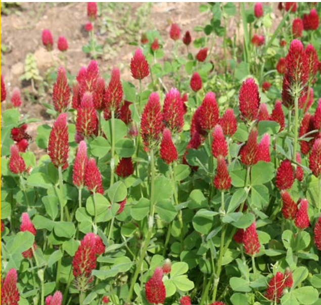
Crimson clover in bloom ready to be tilled under in a backyard vegetable garden.