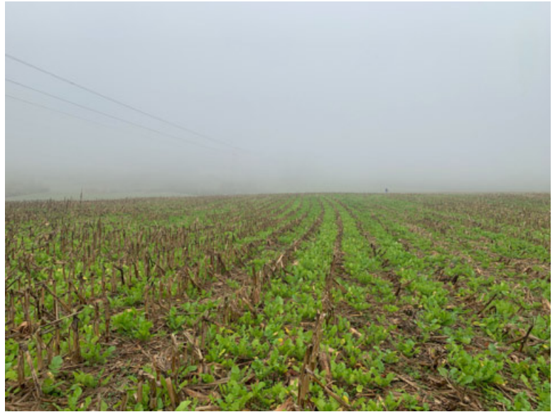
This field of Daikon radish was sown via a drone