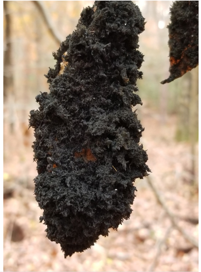
This sooty mold fungus, Scorias spongiosa , grows only on the honeydew produced by beech blight aphids