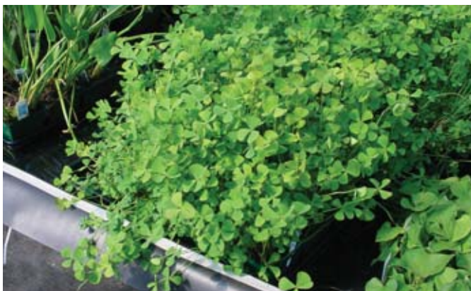
Figure 13. Ornamental aquatic plants are fairly easy to grow since most of them are actually weeds.

Aquaponics is the culturing of terrestrial plants or aquatic autotrophs in conjunction with raising aquatic ani-