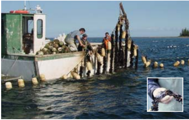
Figure 10. Mussels are grown in fabric socks suspended from long-lines in cold coastal waters (inset shows mussel seed to be placed in sock).

Water column culture is common in the northern states, but ice damage and vessel traffic can present problems, as can the potential controversies between shoreline residents and commercial shellfish operations. A boat larger than the normal shellfishing skiff is necessary for access and harvesting, and a good anchoring system is essential.