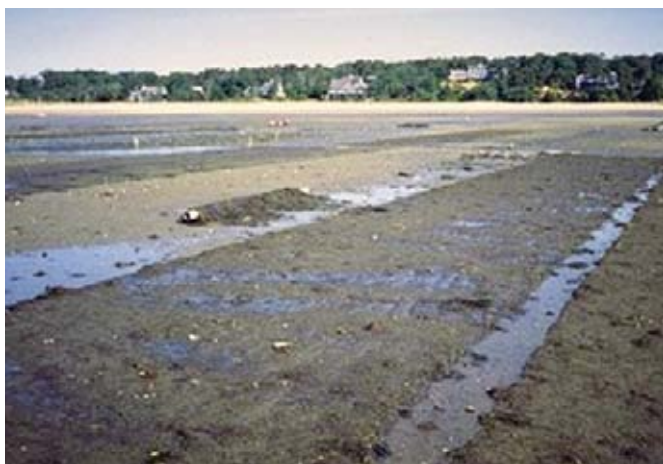
Figure 7. Hard clams or Northern Quahogs are planted as seed in the bottom and covered with predator netting to help improve survival. (Photograph by Gef Flimlin)

Frequent maintenance is essential for commercial success of bottom shellfish culture. While predator controls are not used in mussel culture and rarely with oysters, culturists commonly protect seed clams by covering them with a light polyethylene plastic or nylon netting to control predation by crabs, drills, or rays. Nets used to control predators must be monitored and cleaned regularly to eliminate entrapped predators, repair holes, and remove fouling organisms that can inhibit water flow and prevent phytoplankton from reaching the growing seed.