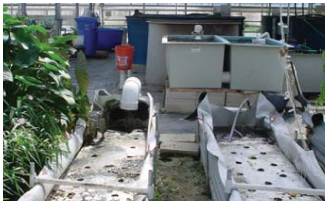
Figure 14. Aquaponics links fish culture with plant culture.

mals, typically fish (Figure 14). Fish provide most of the nutrients that plants require, while plants remove nitrates and improve water quality. Various vegetables and herbs, such as lettuce, tomatoes, peppers, eggplant, and basil are commonly linked to fish production systems, and do quite well getting nutrients from the fish wastewater. Solid waste from closed systems that are usually linked to the hydroponic plant production can be applied as a fertilizer for vegetable or flower gardens.