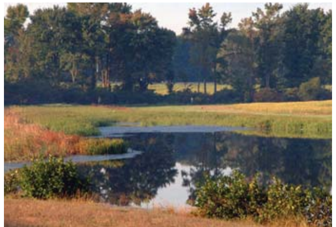
Figure 1. Aquaculture ponds can be of varying sizes.

Traditionally, aquaculture has been practiced in open, semi-closed, and closed systems. Open system aquaculture involves production at densities not greatly exceeding those found in nature. Generally, such systems receive little maintenance: bottom shellfish grounds are not managed, while farms ponds, which vary in size, are not fertilized or aerated, nor are fish given prepared feeds (Figure 1). At the start of the culture cycle, fingerlings or shellfish seed are stocked; at the end of the growing period, the fish or shellfish are harvested and sold.