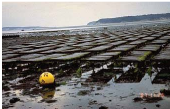
Figure 8. Oysters can be grown in polyethylene plastic bags on racks in shallow water.

ing bags directly on the bottom since sedimentation in the bags can reduce growth and potentially suffocate the growing oysters.