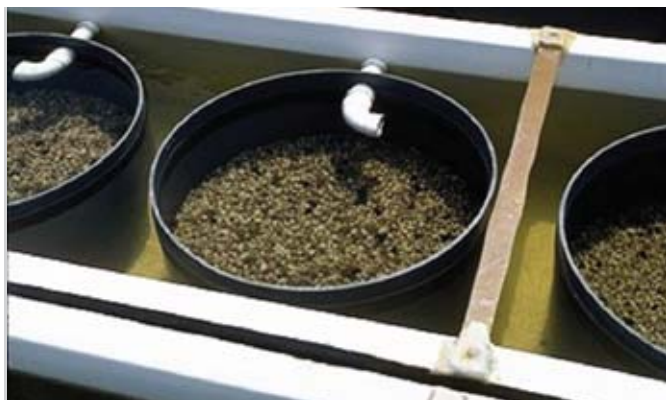
Figure 12. Bivalves are grown in land-based systems such as upwellers that pump water to feed juvenile shellfish.

shedding units are only used for holding blue crabs until they molt and thus become soft shell crabs. Shedding takes only a few days and does not require feeding — the systems can be closed or flow through.