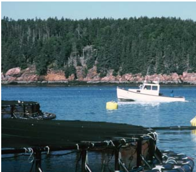
Figure 5. Net pen culture of Atlantic salmon is an important industry in Maine.

Net pen culture commonly involves considerable investment of capital and other resources. It is commonly practiced in public waters, so regulatory concerns and interaction with other user groups are important considerations. Since net pens are designed to maintain fish at high densities, waste management, prevention of escapees, and transfers of disease and parasites are critical concerns. Net pen culture is well suited for rearing salmon in protected coastal waters and is an industry standard in Maine (Figure 5).