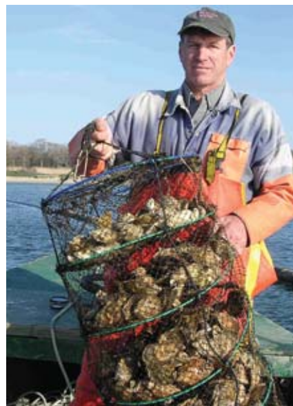
Figure 9. Lantern nets are used to culture shellfish in the water column.

3. Water Column Culture. Lantern nets, cylindrical containers made of nylon netting divided into sections and hung from floats, can be used to culture scallops and oysters (Figure 9). Mussels are cultured in long, plastic mesh sleeves that are hung from longlines, usually in the ocean (Figure 10). This system requires onboard filling equipment to stuff the mussels into the “stockings or socks.” Weight is a consideration here: mussels can become so heavy that they could potentially fall through the socks onto the bottom. This type of rope culture, with mussels hanging down into the water column, is usually done in deep coastal waters.