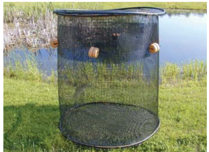
Figure 4. Fish cages can be used in small irregularly shaped ponds that would be hard to harvest otherwise.

3. Cage and Net Pen Culture. Many natural bodies of freshwater can be unsuitable for aquaculture: they may be too deep, too large, or have irregular bottoms or obstructions. Many can be used, however, to culture fish confined in cages (Figure 4) or net pens. Cages are relatively small, rigid structures usually between one and approximately 20 cubic yards. Net pens in saltwater are usually large mesh enclosures up to several hundred cubic yards. Both cages and net pens must be anchored securely in an area where water flow and depth are sufficient to provide aeration and removal of wastes.