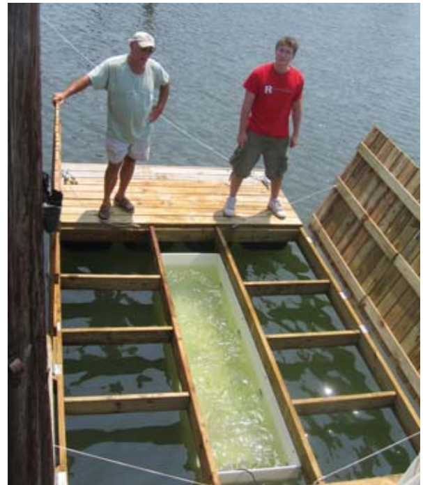
Figure 11. Floating Upweller Systems are becoming more common because of the large amounts of water that can be moved economically.

seed to plantable size for the field, are becoming more popular since they can either be set up as a large floating box or concealed in a floating dock. Both configurations are designed to move a lot of water thus increasing growth rates because of intense feeding regimes. FLUPSYs are used as part of the nursery phase, from 2 to 10-15 mm SL for clams and even larger for oysters. These seed can then be moved into bottom culture for clams, while oysters can be placed in plastic mesh bags for further growout.