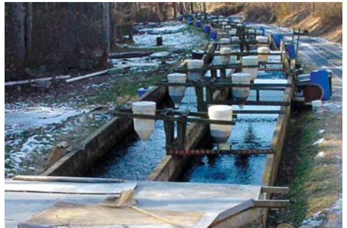
Figure 3. Raceways and tanks utilize a continuous inflow of high quality water to culture fish at high densities.

Annual yields can range from 10 to over 100 pounds per gallon per minute of waterflow to the raceway. High yields require large volumes of high quality water, stable cold temperatures, supplemental aeration and/or oxygenation, high quality feeds, and good management.