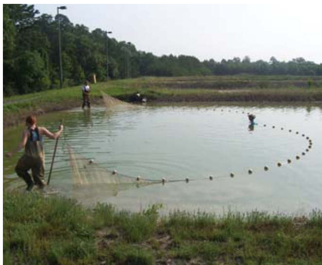
Figure 2. Aquaculture ponds should be fillable, drainable, harvestable, and accessible as needed.

1. Pond Culture. Today, most commercial fish and crawfish production in the United States is in ponds (Figure 2). While a few culturists utilize open-system technology, most provide some form of management and supplemental energy input. In some areas, coastal or ocean water may be used, but regulations and water quality must be considered. Most aquaculture ponds are less than 20 acres in size and have a maximum depth of 6 to 8 feet; they are not usually larger than 5 acres with smaller ponds more the norm. Ponds north of the mid-Atlantic region require water depths 6 to 8 feet or more so fish can safely overwinter. It is advisable to incorporate electrical access to each pond for aeration, pumping, etc. In wintertime, aeration and/or water pumping can reduce or eliminate ice formation, which will help prevent oxygen depletion and winter-kill.