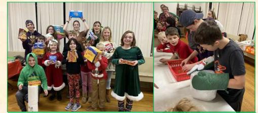
Left: Food collected for the Rescue Mission Right: Playing a game at the Christmas party