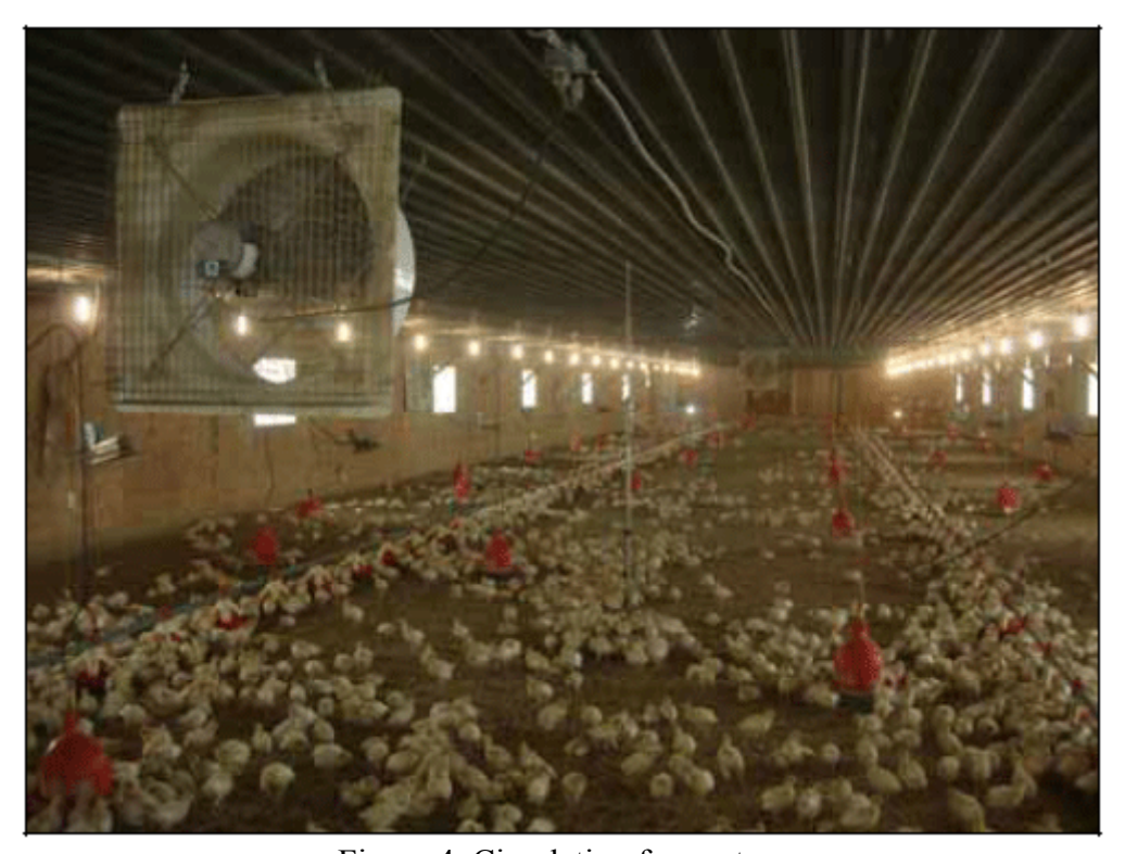
Figure 4. Circulation fan system

It is important to realise that though a properly set inlet system will create some amount of air movement over the litter, it is typically not enough by itself to ensure maximum litter moisture removal. The problem in part is that though it is true that the inlets when properly set do produce some level of air movement over the litter, in most situations, especially with younger birds, they only do so when the exhaust fans are operating, which is often less than 50 per cent of the time. When the exhaust fans are not operating, the air tends to become still, which is not conducive to removing moisture from the litter.