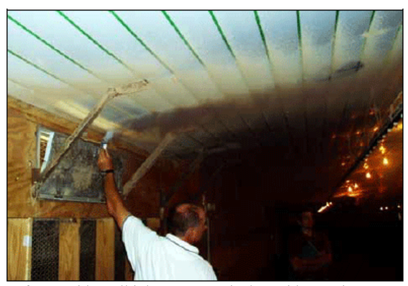
Figure 3. Air flow from a side wall inlet open two inches with a static pressure of 0.10 inches

One of the best ways to visualize the air flow pattern from your inlets is to hang small pieces of old VCR or surveyors tape from the ceiling, every five feet or so from the side wall to the ceiling peak. What you are looking for is the first few tapes to be moving fairly violently with the last ones near the peak of the ceiling barely moving.