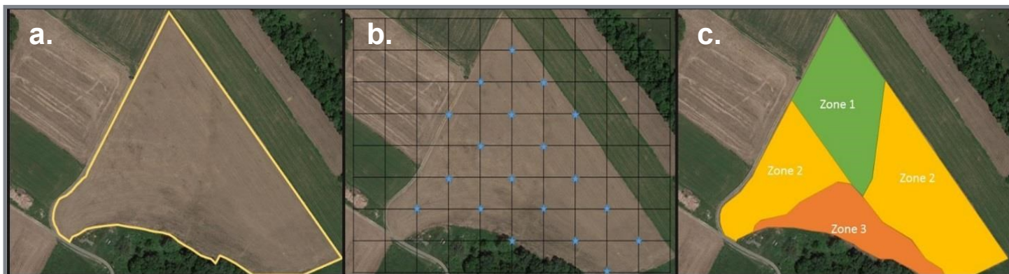
Figure 1. Soil samples may be collected for the (a) whole field, (b) on a consistently spaced grid or (c) by management zones.

Other costs of grid sampling include the software to create the grids and GPS equipment to find each sample location. To be of value, grid maps should result in lower