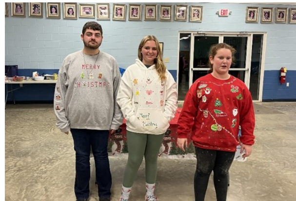
Holiday Shirt Contest participants