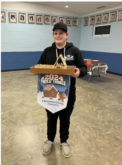
Champion Graham Cracker House