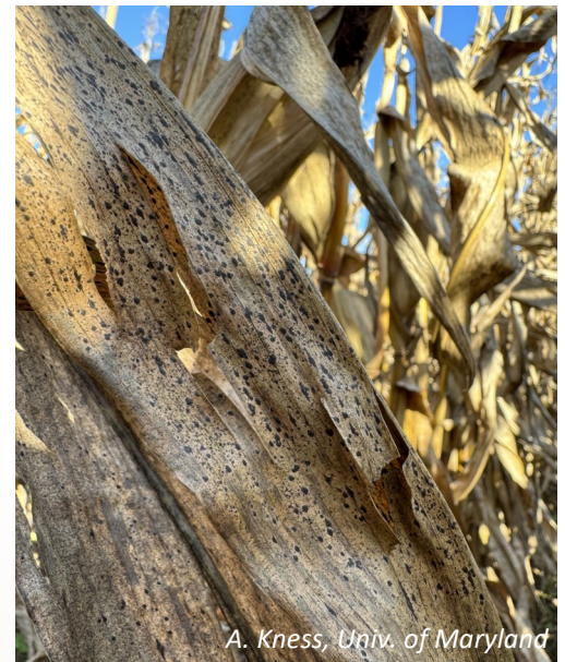
A. Kness, Univ. of Maryland Figure 1. Tar spot symptoms on a senesced corn leaf.

As you are scouting your corn fields, be on the lookout for tar spot. With funding from the Maryland Grain Producers Utilization Board, we are conducting a survey of tar spot's distribution in Maryland. If you have tar spot, or think you might, please report it to corn.ipmpipe.org or reach out to me at akness@umd.edu or (410) 638-3255. Reports are kept anonymous and individuals and/or farms are not identified in any public reports or publications.