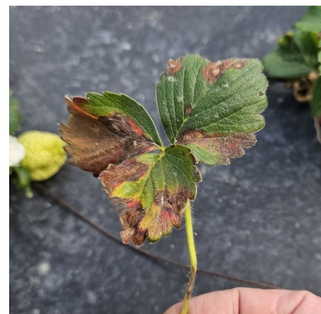
Figure 1. Symptoms of Neo-P on strawberry.

It is not advisable to plant plug plants or bare-roots that show disease symptoms. Here are steps that you can take before and after planting: