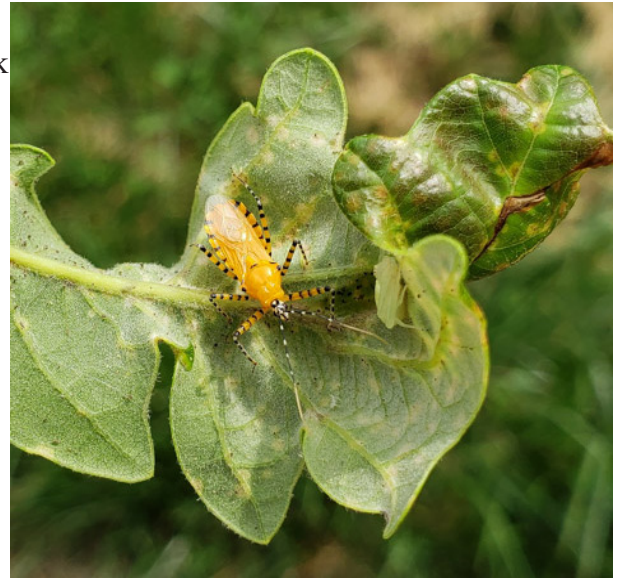
Orange assassin bugs are predaceous as nymphs and adults