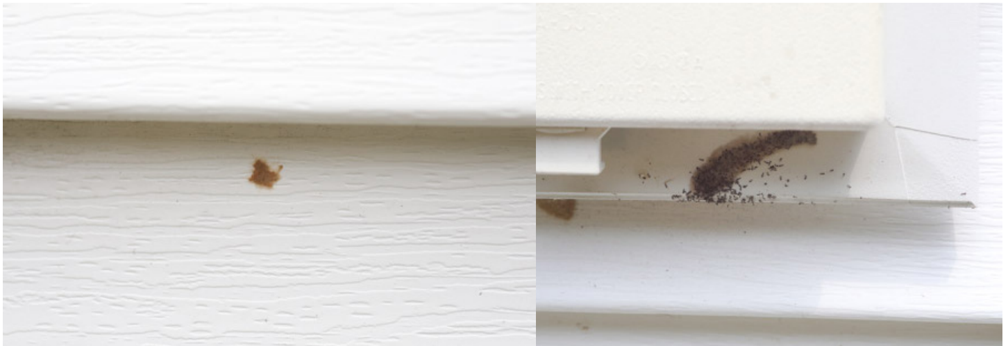
Fall armyworm egg mass (left) and just hatched caterpillars (right) on siding of a house