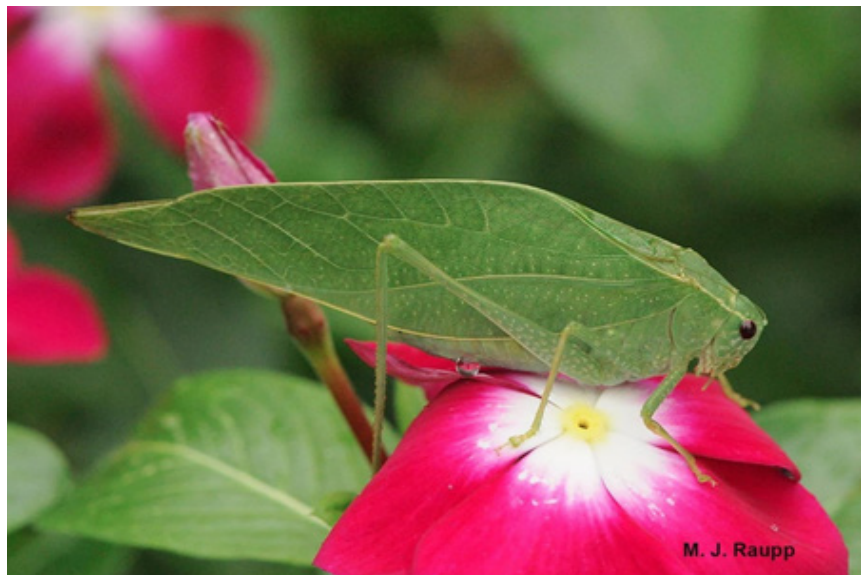
The wings of this male curve-tailed bush katydid, Skudderia curvicauda , have veins like a leaf.

Katydids are in the order Orthoptera and therefore are related to grasshoppers and crickets. Insects in this order have saltatorial legs which are long and thin for jumping. Within the Orthoptera, katydids which are sometimes called bush crickets, are in the family Tettigoniidae. There are about 6,000 species of katydids and they occur throughout the world, except Antarctica. In North America, there are around 255 species. Species range in size from 0.5” to over 5”. Katydids can most easily be distinguished from grasshoppers by their antennae. Although both have what are referred to as filamentous (straight) antennae, katydid antennae are thin and longer than their body length, whereas grasshopper antennae are thicker and usually much shorter (not longer than their body). Adult female katydids have distinctive, upwardly curving ovipositors for egg laying . Many species are bright green in color, but not all. Wing length of adults differ between species, some have very short wings where others have wings the length of the body (see image). Overall, most species are poor flyers and they usually flutter their wings when leaping from one location to another. Katydids are active from summer into the fall. There is usually one generation per year and they overwinter as eggs (see image).