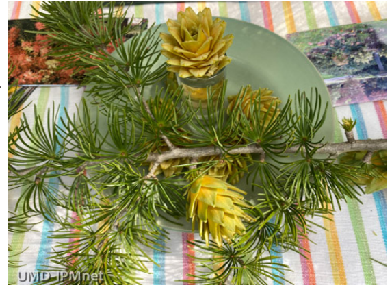
Cones of golden larch as part of a table display

Pseudolarix amabilis or golden larch is a deciduous conifer that can grow 30-60 feet tall and 20-40 feet wide. The foliage is soft blue green on the top of the needles and light green on the underside of the needles, and turns a golden yellow with the cold temperatures of late autumn. The gracefully arching needles are grouped in whorled clusters. Golden larch has both long and short shoots with needles spaced widely on the long shoots and in dense whorls on the short shoots. The blue green cones resemble small globe artichokes and sit on top of the branches. In the autumn, they turn light gold and open to release their ripened winged seeds, then quickly disintegrate and fall to the ground. The plants prefer full sun and moist but well drained soils and are tolerant of air pollution. These slow growing trees are cold hardy in USDA zones 4-7, and are tolerant of the heat and humidity that is normal during Maryland summers. This beautiful tree was a part of the tour at Fieldstone Nursery sponsored by MNLGA's Field Day. There is a cultivar, 'Annesleyana', which is a dwarf bushy plant with short horizontal and downward arching branches. There are no serious pests listed.