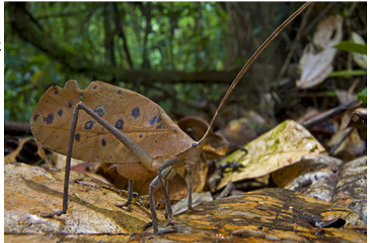
The peacock katydid, Pterochroza ocellata , mimics a dead leaf, leaf spots and all, protecting it from predators.

Katydids major form of defense is their remarkable use of mimicry. They have cryptic coloration and shapes that blend them into their environment making it difficult for predators to see them (see images). Amazingly, many katydids have evolved to look like leaves, and leaves of different color (ex. green or brown). Some even have spots or marks on them that give them the look of a diseased or ratty looking leaf. The peacock katydid, Pterochroza ocellata , for example, mimics the discoloration of a dead leaf (see image). In addition to mimicry, this katydid uses “startling” behavior to ward off predators.