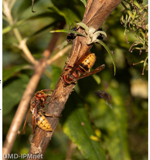
European hornets scraping off the bark of a buddleia stem

This year is turning out to be a big year for “insect outbreaks”. We continue to get an unusual number of reports of European hornets attacking customers' fruit, especially apples, pears, and figs this week. People are reporting that when they are harvesting, they are being stung and are obviously not happy about the situation. Many reports of run-ins with these large European hornets is resulting in painful stings. The interesting thing is several people reported European hornets flying about at night. If you turn on a light, they show up rapidly and migrate toward the light source. I went outside to cut some Limelight hydrangeas in the dark using a flashlight. Within 30 seconds, I had European hornets buzzing about. The reports are correct – they do fly at night, which is rather unusual for many Hymenoptera species.