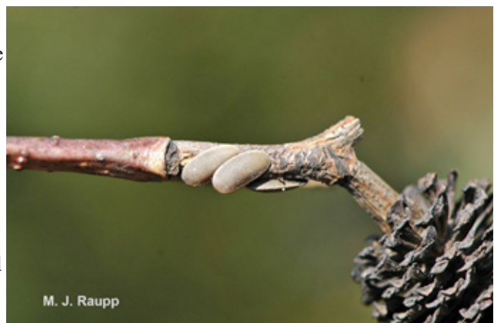
Katydids often deposit several eggs in rows on small branches of trees and shrubs.

In a study by Morrison et al. (2016) they examined which predators were eating, and who ate the most, eggs of brown marmorated stink bugs (BMSB) in apple, peach, and vegetable crops. It is well known that ground beetles (carabids) are common predators in many systems and they did find that they were significant predators of BMSB egg masses. Of particular interest, they found that katydids readily consumed BMSB egg masses and lots of them. In their study they found both the straight-lance meadow katydid, Concocephalus