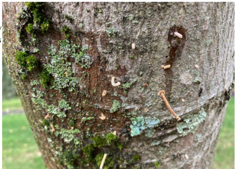
Frass tubes on this red maple trunk are a sign of ambrosia beetle activity

Elaine Menegon, Good's Tree and Lawn Care, found active ambrosia beetles on a red maple on September 22 in Hershey, PA. It's likely that activity is finished in Maryland, but if you do see frass tubes in Maryland, let Stanton know at sgill@umd.edu .