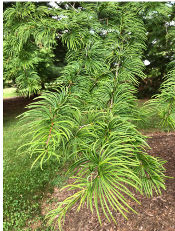
The foliage of Pseudolarix amabilis or golden larch turns light gold in autumn