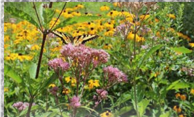
Bottom photo: Native plants at the Calvert County Master Gardener Demonstration Garden.