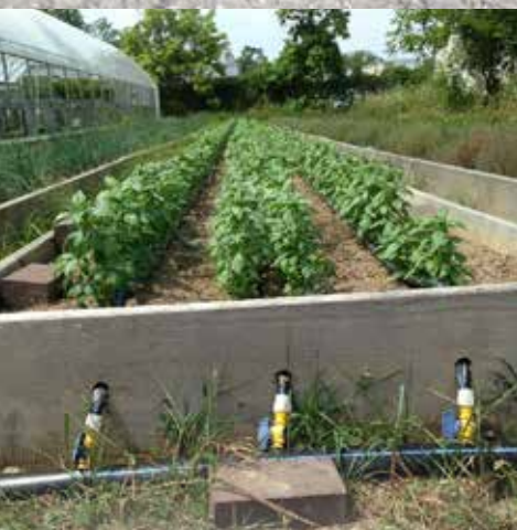
Middle photo: A Baltimore urban farm was created on a vacant lot.