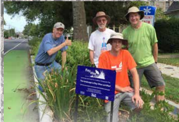
Middle photo: Cambridge Main Street's "Green Team" proudly display the new stormwater management installation.