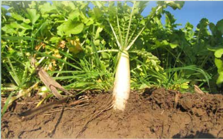
Photo: Farmers and scientists are showing increasing interest in mixing multiple species of plants into cover crops instead of using a single species. Mixed species cover crops may be more effective at capturing nutrients and making them available to cash crops. Research suggests that diverse cover crops (legumes, brassicas, grasses, and others), may be more effective at supporting diverse below-ground biology and improving overall soil quality.

Researchers in the University of Maryland's Department of Environmental Science and Technology and Plant Science and Landscape Architecture have on-going projects designed to improve the understanding and management of nutrients in crop production.