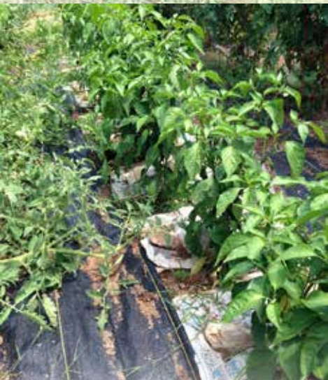
Top photo: A newspaper and weed barrier is used to control weeds and protect the soil in the Field of Greens Community Garden in Riverdale, MD.