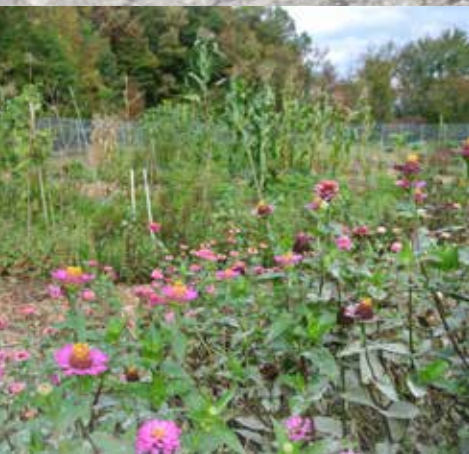
Bottom photo: A Riverdale, MD community garden.