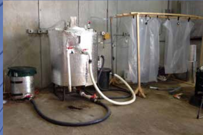
Top photo: Anaerobic digester