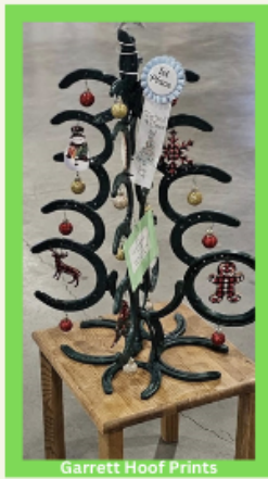
Garrett Hoof Prints