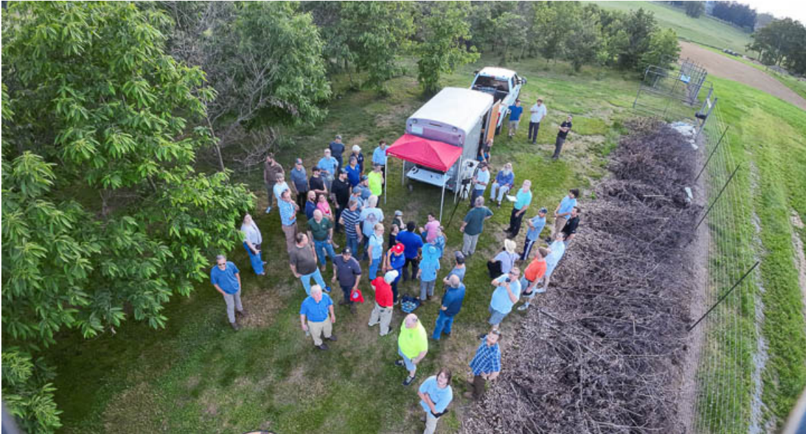
'Drone's eye view' of the tour group during the IPM program.

There were about 60 people who attended the Maryland Arborists' Association (MAA) and UME Diagnostic session on May 22 here at the Central Maryland Research and Education Center in Ellicott City. There were powerpoints and a drone demo during the program. MAA and UME will a follow-up session on June 27 from 5 p.m. to dark at Carroll Community College in Westminster.