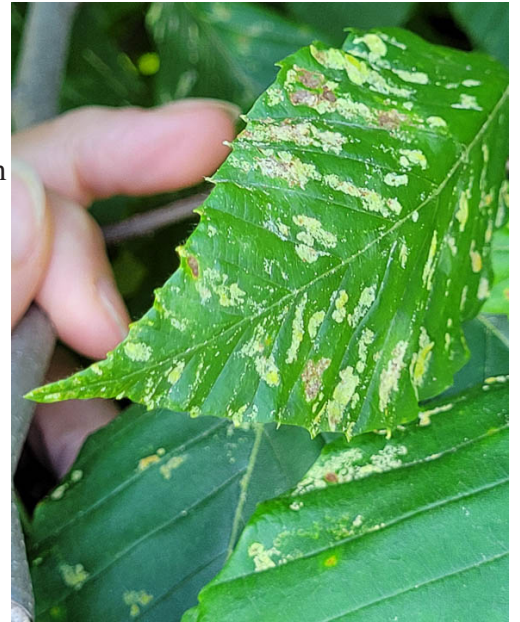
Eriophyid mites cause erineum patch on beech.