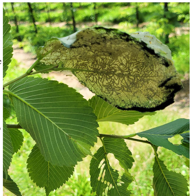
Fall webworms are hatching late in May.

Control: If possible, prune out webbed terminals. Bt, horticultural oil, or insecticidal soap can be used for early instars. There are many predators and parasites that help keep this native pest at manageable levels.