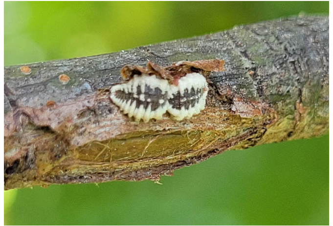
European elm scale has an extended crawler period during the summer.

Control: Look for beneficial insects which can do a good job controlling this scale. If an insecticide application is necessary, treat with a soil drench of dinotefuran (Safari, Transtect) or make foliar applications of Distance or Talus.