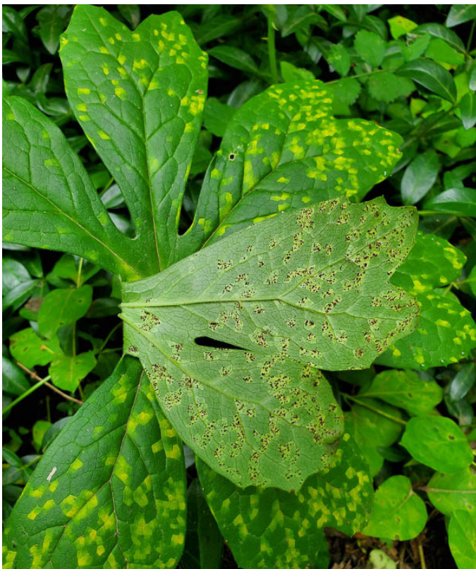
Rust infection on mayapple.