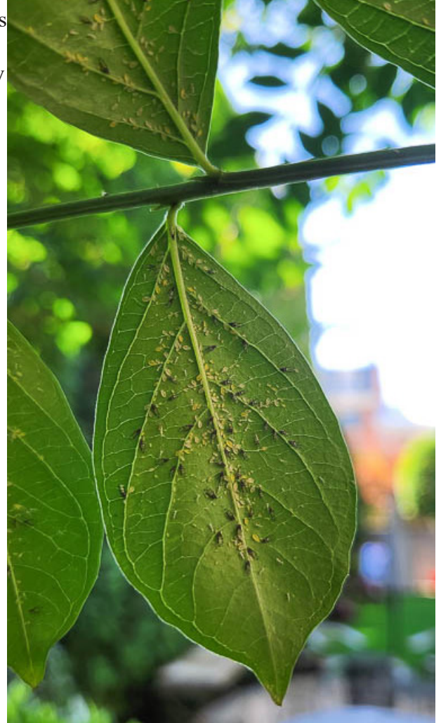
A high population of crapemyrtle aphids in D.C. this week.

If you see similar damage showing up on heavily pruned crape myrtles, please send some pictures. I suspect that the heavy pruning and flushing of new growth is highly attractive to crapemyrtle aphids. We would love to hear your observations at Sgill@umd.edu .