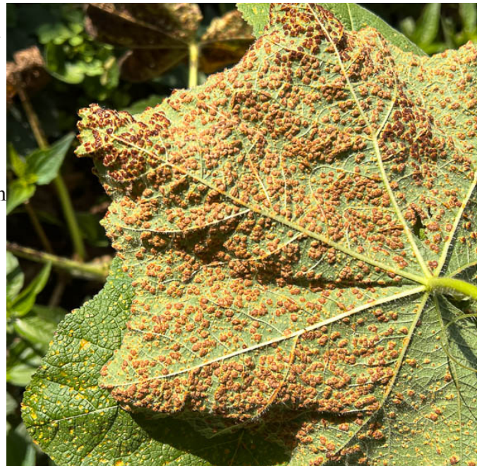
This photo shows a rust infection on the upper and lower leaves of hollyhock.