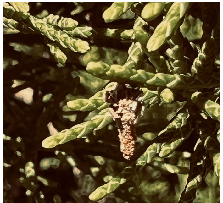
Check trees for bagworm egg hatch. It is most effective to treat larvae when small.