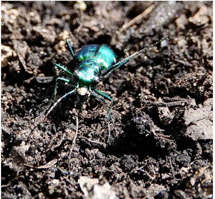
Six-spotted green tiger beetle adults are very fast fliers.

Nancy Woods found a female six-spotted green tiger beetle, Cicindela sexgutatta , that was laying eggs. The tiger beetle is a predator as a larva and an adult. It is a very fast flier as it goes after prey. The larva hangs out in a burrow and then reaches out and grabs prey as it goes by. These beetles are often found along open, wooded pathways.