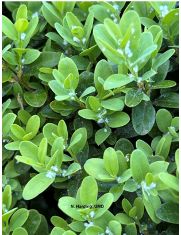
Wax from psyllids on boxwood. Predatory syrphid larvae were found in the new growth where psyllids were feeding.