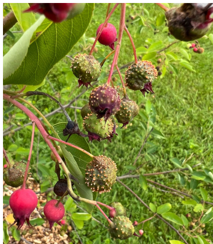
Gymnosporangium rust infections are still active.