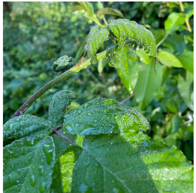
Psyllid damage on thornless blackberry.

We are getting in pictures of curled, distorted tip growth on thornless blackberries. The wet weather for the last 4 weeks has helped this insect flourish. There is a up-tick in reports of this damage showing up in the last week. The psyllids feed on the tip growth of the blackberry primocanes (new 1-year old canes) and cause the growth to curl and twist. It looks a lot like a herbicide injury. If you uncurl the foliage you will find the nymphs of the psyllids. Prune this tip growth off and get it out of the area. The thornless blackberry is a vigorous plant and will produce side shoots. When the rain period lets up a little, then the predators generally bring this psyllid population under control.