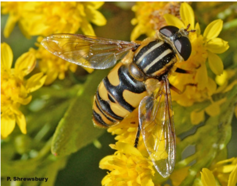
Syrphid flies feed on nectar and pollen when they are adults. Note the diagnostic one pair of wings, large eyes, and short antennae on this true fly that mimics bees.

that help to suppress many small soft-bodied insects such as psyllids, aphids, spider mites, thrips, small caterpillars and other prey. If you have plants infested with aphids, within a short time period you will have syrphid fly larvae snacking on the aphids . A single syrphid larva can consume about 400 aphids in its lifetime. Since adults feed on nectar and pollen be sure to provide flowering plants to attract and support syrphids and other omnivorous natural enemies.