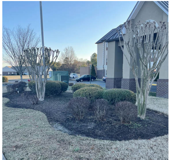
"Florida-style" pruning of crape myrtles