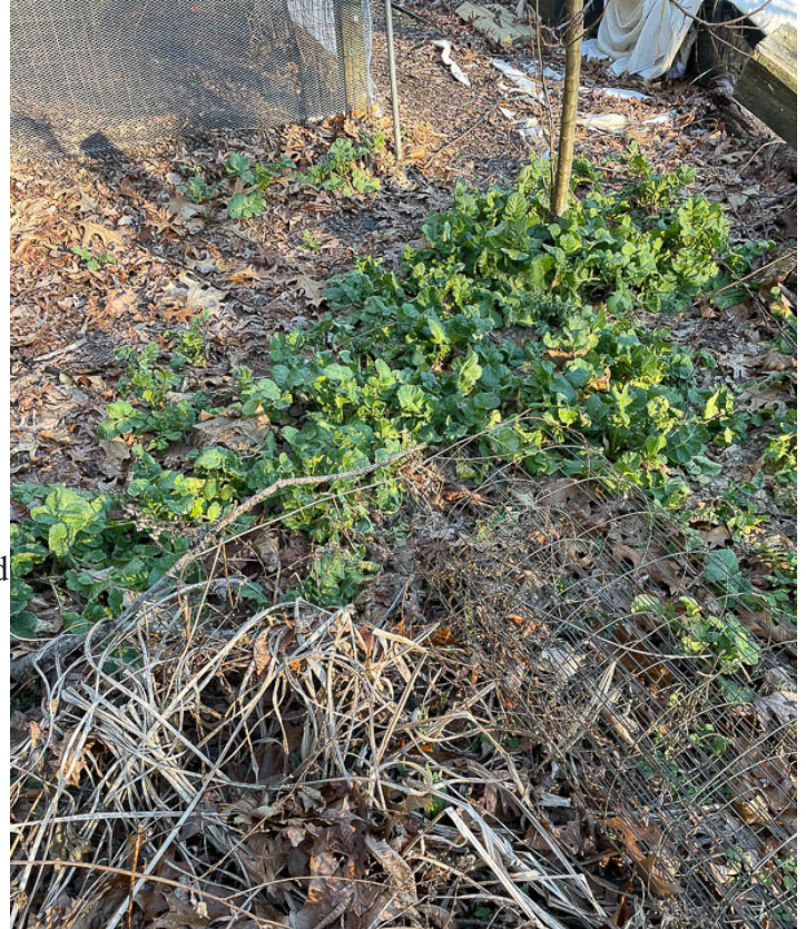
Tops of daikon radish are still green in Westminster in late February.

"I should add that a couple of years ago on the southern E Shore the radishes survived the winter in an organic field experiment to be planted to corn. We "planted green" right through the big roots and got a good corn stand. We then roller-crimped that cover crop which also included rye and clover. We had weed problems later, but not from the cover crop."