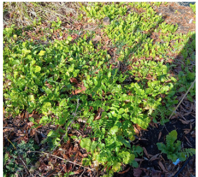
Tops of daikon radish are still green in Greenbelt.