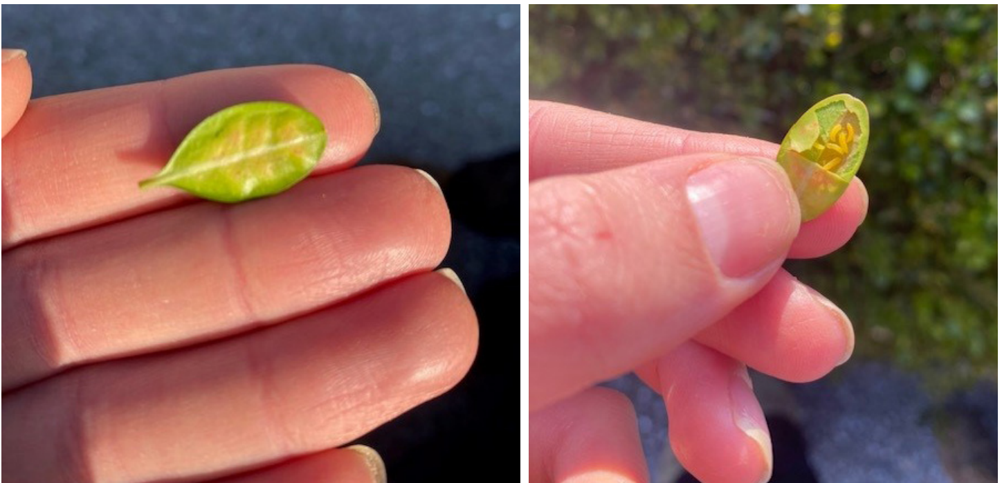
Puffy, discolored areas on the undersides of boxwood leaves are a good indication of boxwood leafminer. Cut into the leaves to look for the larvae at this time of year.