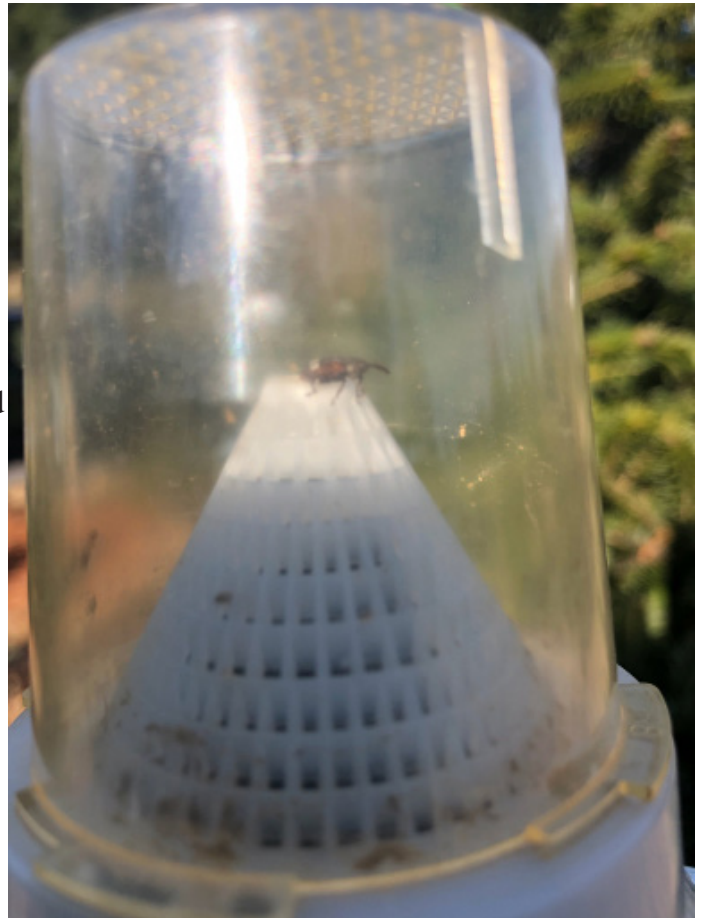
White pine weevils are being caught in Tedder traps in Upperco this week.

White pine weevils overwinter as adults. To prevent damage, treat terminal growth when the adult activity is noted on conifers or in traps. Avaunt insecticide is labelled for weevil control in nurseries.