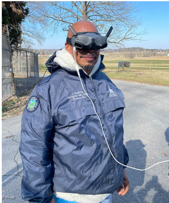
Participants and Instructors at the February 20 and 21, 2024 Drone Training Program at the Central Maryland Research and Education Center.