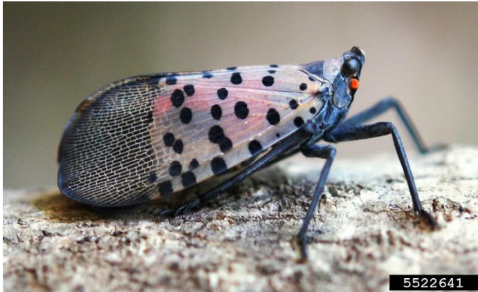
Figure 1. Spotted lanternfly adult.

Maryland Department of Agriculture press release