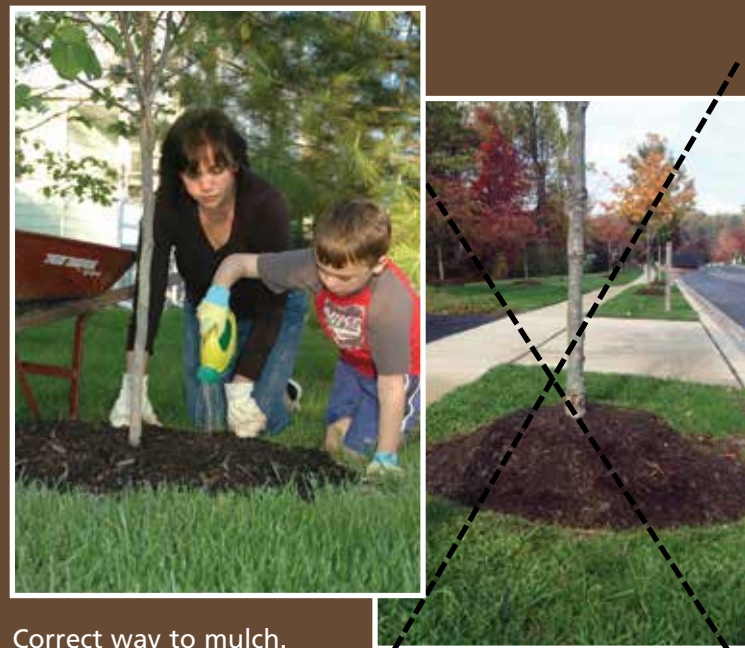
Correct way to mulch.