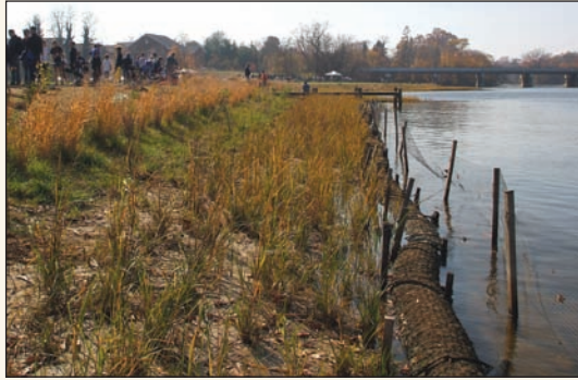
Fencing shown on the right keeps ducks and geese from browsing and pulling out recently planted marsh grass plugs (next to the biologist) and warm-season grasses (on the slope.) After the first full growing season, fences can usually be removed.

Waterfowl, such as ducks and geese, love to feed on newly-planted vegetation. To keep them out of the area for the first full growing season, a three-to-four foot tall mesh enclosure—tied onto wooden stakes—should be erected. Large debris, such as logs, algae mats, and trash, should be periodically cleared from the site to protect wetland plants from smothering. For beach and water access, keep a narrow path to the water unplanted to avoid trampling vegetation. Control non-native invasive plants, such as English ivy and multi-flora rose, and replace them with native wetland plants and shrubs.