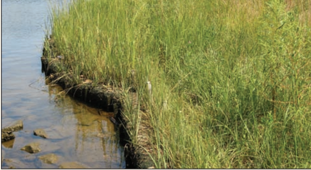
NONSTRUCTURAL: Biologs and vegetation