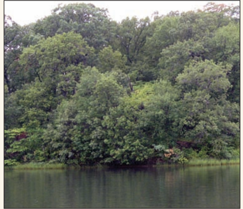
On College Creek, Annapolis, a natural shoreline showcases an extensive buffer of trees and wetland grasses. Ideal shoreline projects replicate these conditions.