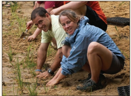
Volunteers plant hundreds of marsh grass plugs ( Spartina alterniflora ) at the Back Creek Nature Park waterfront.