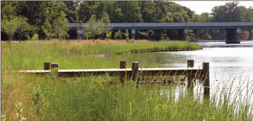
Living shorelines provide a natural setting for both humans and wildlife. They play an important role in restoring water quality in our rivers and streams, and ensure a future for fishing, crabbing, and boating on the Bay.

Go to cbf.org/livingshorelines for more information.