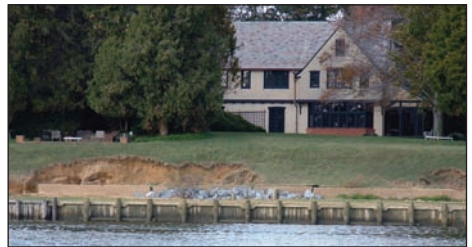
Substantial erosion is occurring behind a failing wooden bulkhead, and traditional turfgrass lawns do little to hold soil in place.

Think about a living shoreline before you replace these structures with similar ones.