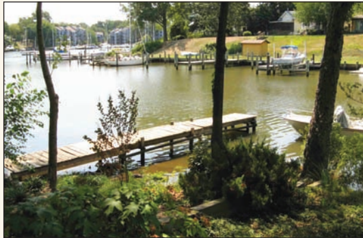
Well-established shoreline buffers include mature native trees and shrubs to help frame the view. Extensive buffers anchor the soil, provide wildlife habitat, and make the shoreline more aesthetically pleasing.

If your property is experiencing erosion, it is important to understand where it is coming from; not all erosion is due to waves, wind, and tides. On properties with steep slopes leading to the water, a major source of severe erosion can be runoff from rooftops, downspouts, and paved driveways unless adequate tree and shrub buffers are planted closer to the house.