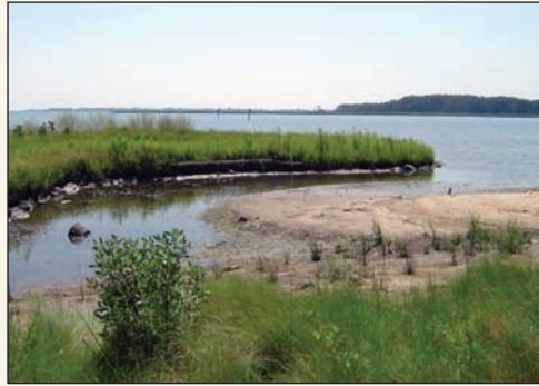
A newly created marsh island protects the sandy shoreline from waves and wind while allowing for the natural movement of sand and water.

In some instances, such as on steep slopes, regrading of the shoreline’s bank may be necessary to provide a stable slope and allow newly-planted vegetation to become established. Fill material can also be extended out from the existing shoreline and then planted with appropriate vegetation to create a tidal wetland marsh. In mid-to-high wave energy areas, an offshore breakwater may be installed to diminish wave energy.