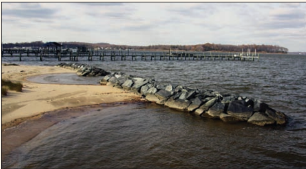
STRUCTURAL: Offshore breakwater (openings provide wildlife access)