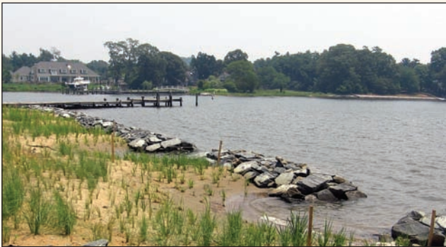
HYBRID: Segmented sills, jetties, or groins with natural beach shoreline and/or marsh plantings