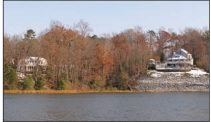
A contrast in shorelines: The living shoreline on the left provides many water quality and wildlife benefits while blending in with the natural environment. The shoreline on the right is completely covered in stone and has no vegetation behind it to prevent erosion.

Many waterfront property owners who live on protected creeks and rivers see their neighbors’ wooden bulkheads and rock walls and think that they are the only solution to erosion concerns. However, where there is low-to-moderate wave energy and minimal erosion, it is usually not necessary to install these hard structures. Not only are they more costly, but they can destroy shallow water habitats when wave energy is reflected back.