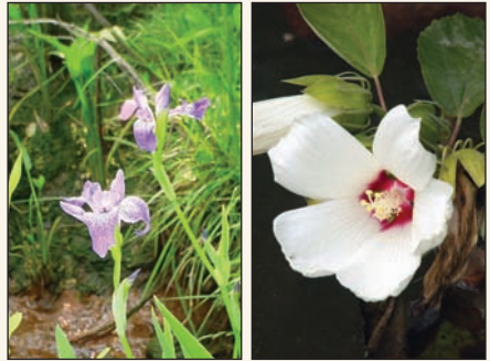
Showy native wetland plants, like Blue Flag iris (left) and Marsh Hibiscus (right), attract pollinators, provide seasonal color, and have extensive root systems to hold shorelines in place.

Perennials and grasses should be planted during peak growing season (in mid-to-late summer) to allow enough time for their root systems to become established before they go dormant in the late fall. Trees and shrubs should be planted in spring and fall when there is adequate rainfall to help them develop strong roots and leafy growth.