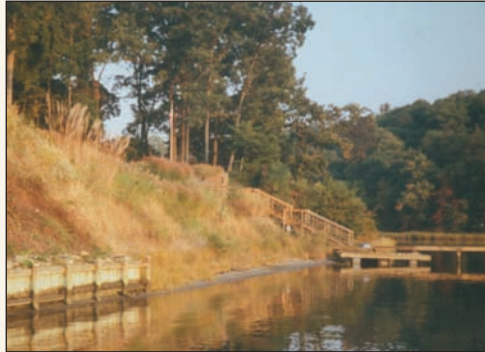
On the right side of the photo is a living shoreline, on the left a bulkheaded shoreline. The steep slopes of the living shoreline were stabilized by planting warm-season grasses, including switchgrass and little bluestem, and native shrubs.