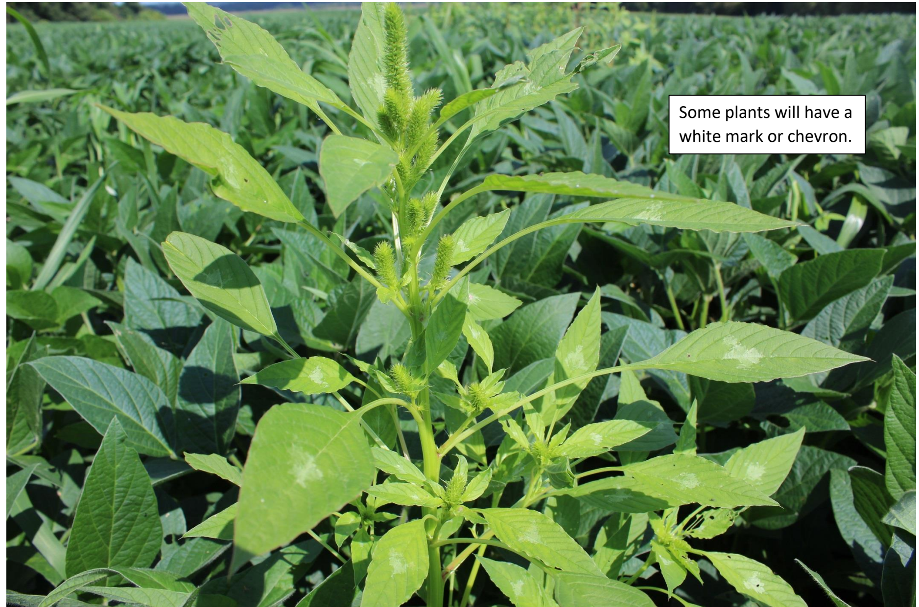
Some plants will have a white mark or chevron.