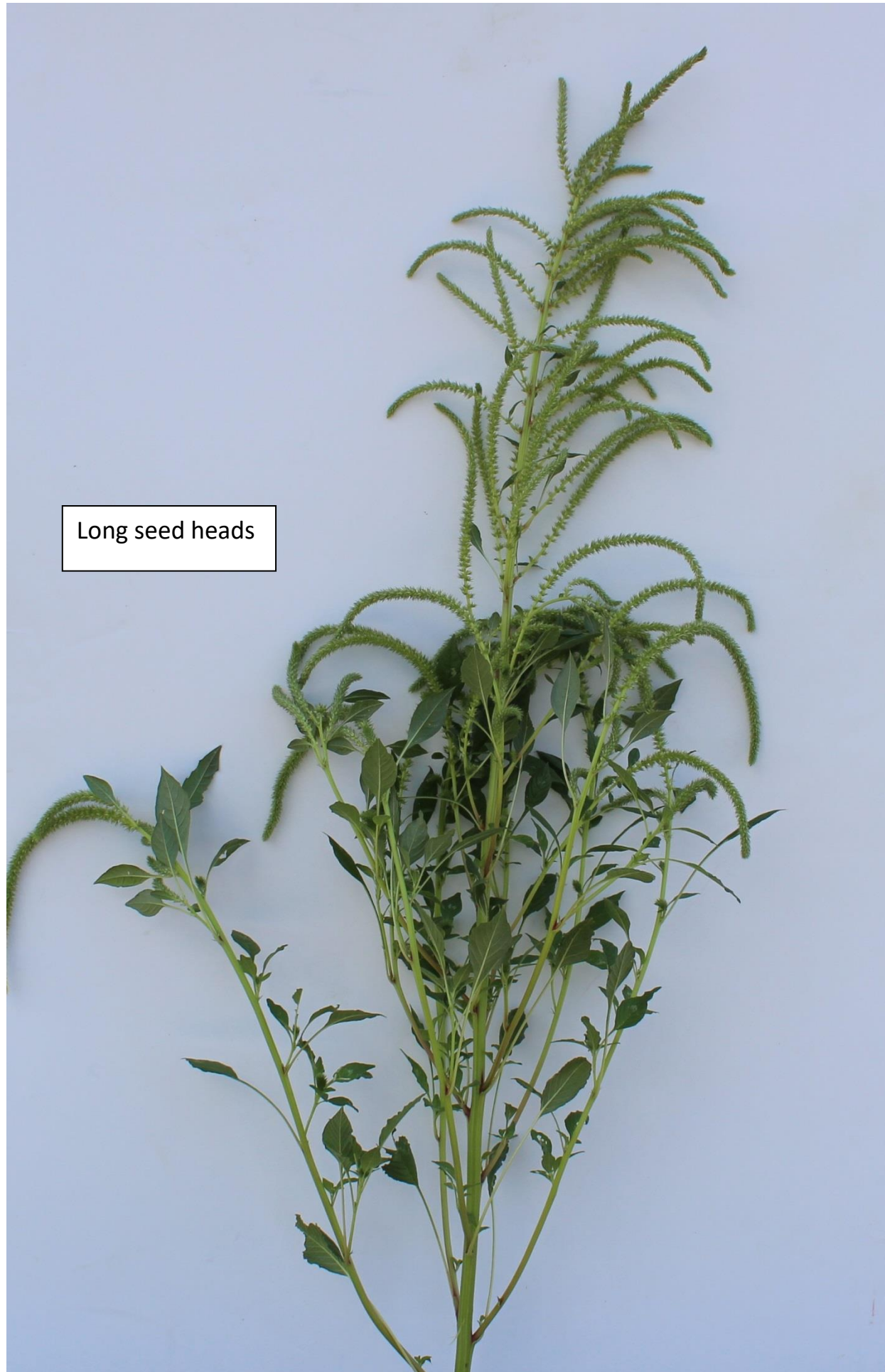
Long seed heads