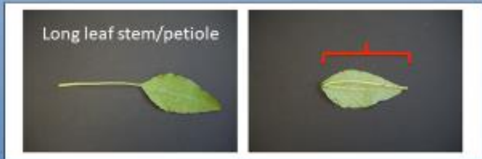
Long leaf stem/petiole