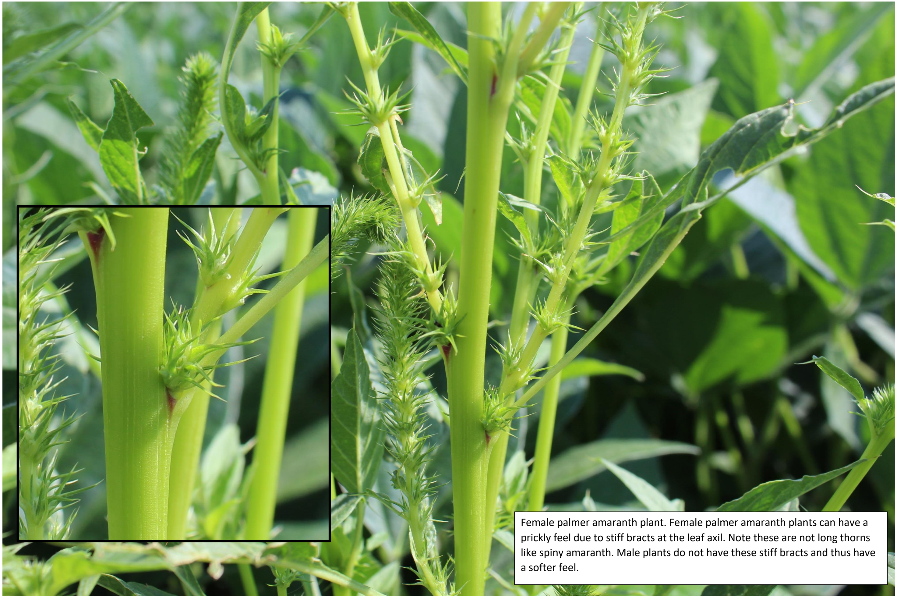
Female palmer amaranth plant. Female palmer amaranth plants can have a prickly feel due to stiff bracts at the leaf axil. Note these are not long thorns like spiny amaranth. Male plants do not have these stiff bracts and thus have a softer feel.