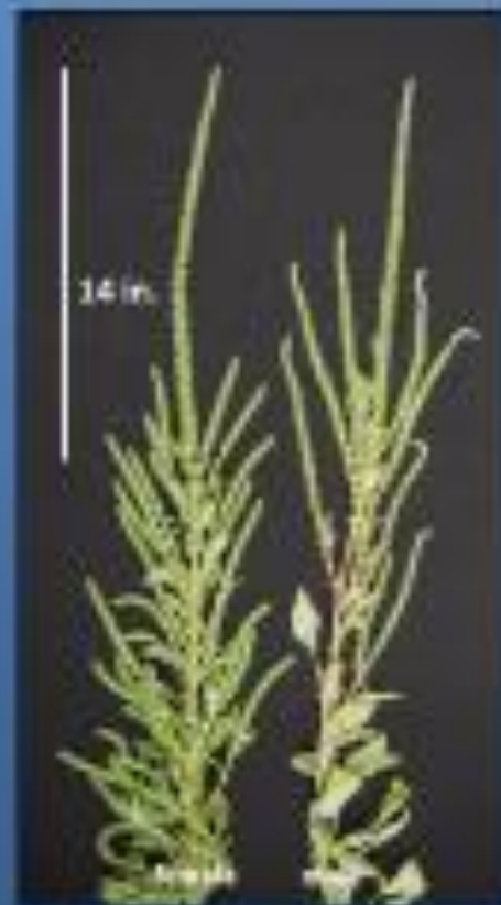
Long seed heads