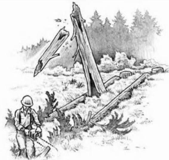
Bucking near a snag