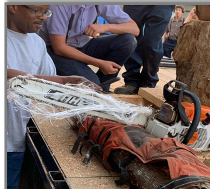
Demonstrating why chaps are important.