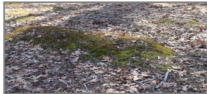
In this photo, the moss covered mound is actually a burial vault. There was another vault beside the one pictured that was more exposed and there were no markers for either of them. This photo was taken in Hurley's Neck below Vienna in Dorchester County on former Chesapeake Corporation property.

Discovering a burial site on a property can be exciting, haunting and require some follow-up. Do your due diligence to maximize harvest to ensure the minimum of disturbance to respect the dead.