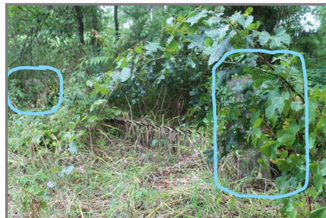
This photo was again taken at Ferry Farm Estates in the Neck District of Dorchester County and again you really have to look to see the headstones and the wrought iron fence delineating the burial area.