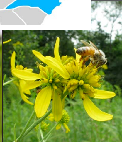
New England aster, smooth penstemon, and wingstem.

The Mid-Atlantic Region encompasses North Carolina, Virginia, West Virginia, Maryland, Delaware, New Jersey, Pennsylvania, and Washington, D.C. High regional variation in topography, soils, and climate has resulted in tremendous ecological diversity, ranging from the salt marshes and wetlands of the eastern Coastal Plain, to the spectacularly species-rich deciduous forests and riparian communities of the Piedmont foothills and Appalachian Mountains.