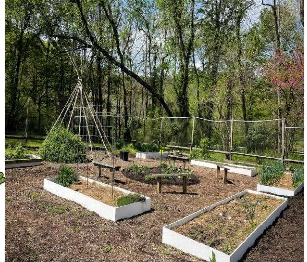
Eden Mill Gardens