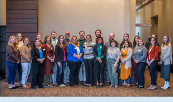
LEAD Maryland Class XIII LEAD Maryland Foundation is dedicated to identifying and developing leadership to serve agriculture, natural resources, and rural communities.