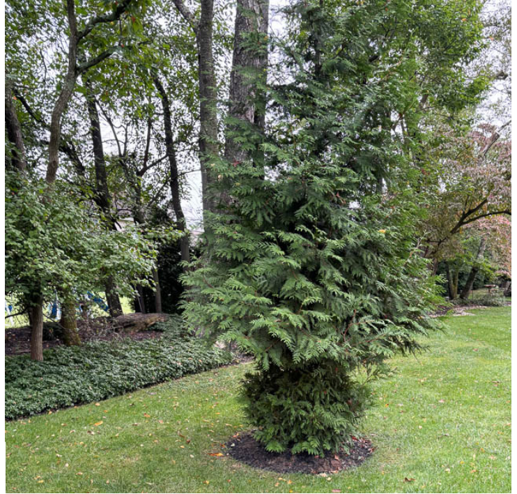
Deer damage on arborvitae.

Mark Schlossberg, ProLawn Plus, Inc. found deer damage on 'Green Giant' arborvitae this week in Owings Mills.