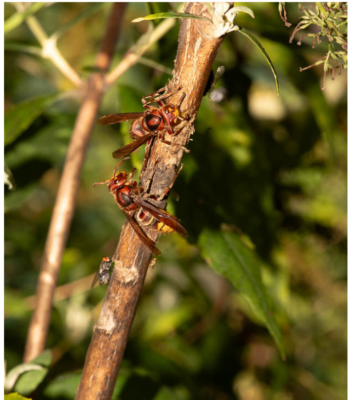
European hornets damage plant stems when feeding on sap and stripping bark for nest material.

We are getting in emails reporting European hornets are stripping bark on birches and lilacs to use in their nest building. It is rather entertaining to watch these large hornets carrying long strings of bark. The stripping of the bark off the birch do not seem to do much damage to the tree. Nursery managers have reported that lilac branches are completely girdled with this bark removal resulting in dieback of branches. Fortunately, the damage is tolerable in most cases. If your workers are working among these plants the wasps are working on, then it might be worth applying a wasp spray to help keep them from being stung.