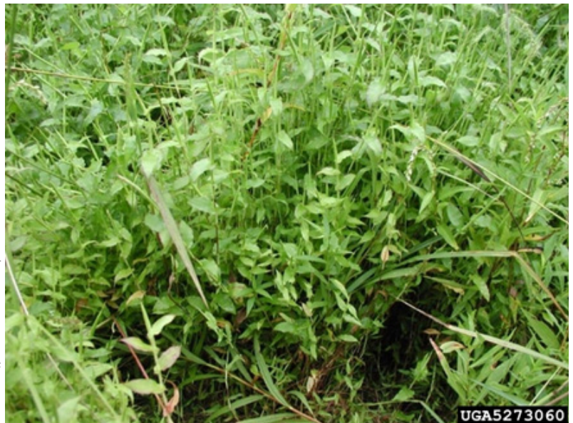
Carpetgrass is often found in wet areas.