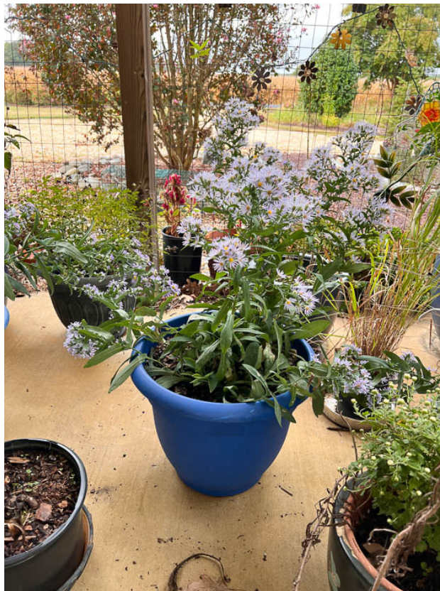
Smooth asters make a lovely display in a container on a patio.