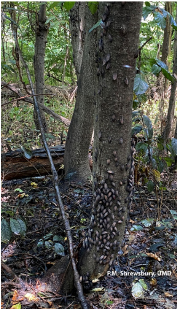
Spotted lanternflies often reach huge densities and rob vital nutrients from tree-of-heaven.

With young TOH under siege from ailanthus webworm and established TOH assaulted by sap-sucking SLF, there might be hope that these two herbivores may kill some or many TOH and help prevent ecological impacts of TOH in our natural and managed ecosystems.