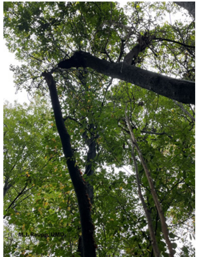
After years of infestation by masses of spotted lanternflies, tree-of-heaven like these two may succumb to their ancient nemesis from Asia.