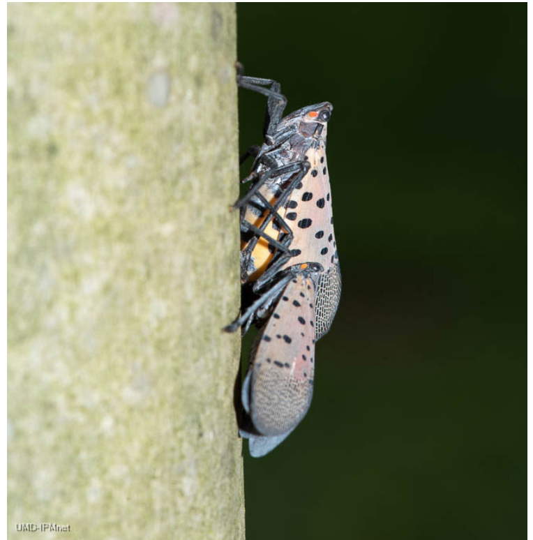
A large gravid (carrying eggs) female and another adult spotted lanternfly eggs on a maple here at the research center in Ellicott City.