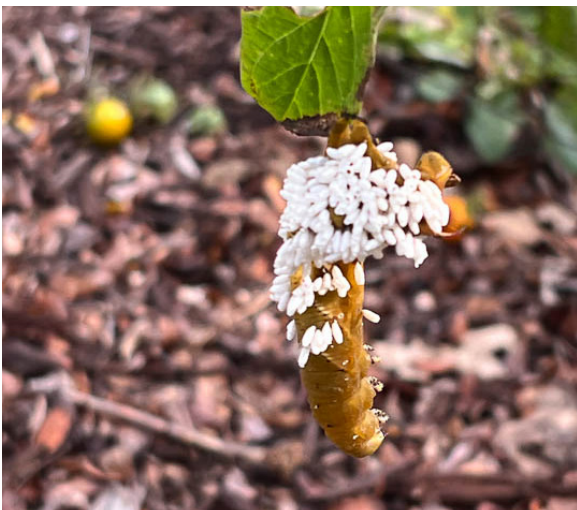
Ginny found these parasitic wasp pupae on a hornworm on a tomato plant.