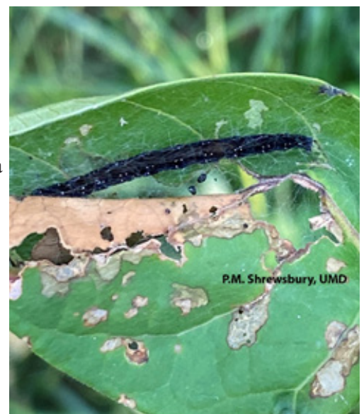
Close up of a late instar ailanthus webworm caterpillar and damage to tree-of-heaven foliage.