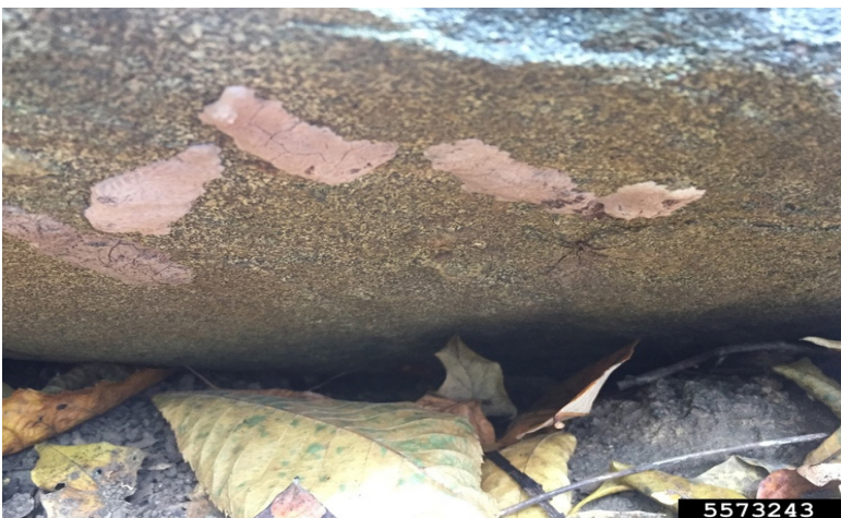
Spotted lanternfly egg clusters.