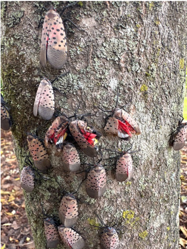
Spotted lanternfly adults clustered on a tree trunk.

If you are shipping out plant material to non-quarantine areas, make sure your employees recognize the egg masses. They should scrape them off of plant material with a knife and drop them in a bucket of soapy water. This is time consuming, but is a necessary step in trying to slow down this pest from spreading to new areas.