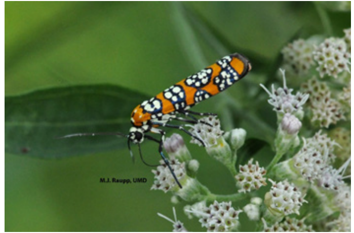
Many moths are nighttime feeders, but beautiful ermine moths, the adult stage of ailanthus webworms, feed during the day.

In addition to ailanthus webworm, TOH is assaulted by its historical acquaintance from Asia, the spotted lanternfly. Back in China, spotted lanternflies spent millions of years “learning” how to cope with TOH’s defenses and exploit nutritious phloem sap as a source of food. In late summer and autumn in the US, hundreds, maybe even thousands of spotted lanternfly adults can be found consuming nutrients from the branches and trunks of TOH. With persistent infestations over multiple years and vast numbers, lanternflies can be lethal to invasive TOH according to scientists at Penn State.