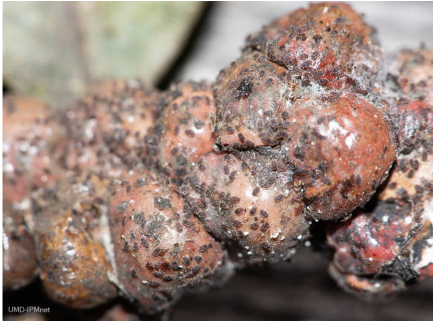
Look for crawlers of tuliptree scale.

The scale overwinters as second instar nymphs, so in early November if temperatures hover above 50 °F during the daytime, you can apply 2-3% horticultural oil to kill the overwintering stages.