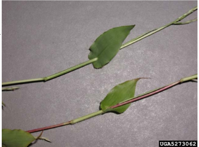
Leaves of small carpetgrass wrapping around thin red stems.

Where chemical control options are possible, products containing DCPA, dichlobenil, dithiopyr, flumioxazin, and oxyfluorfen offer relatively effective pre-emergent options. Post-emergent products containing glyphosate