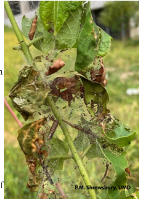
Ailanthus webworm web foliage of young tree-of-heaven together and often feed in groups. If you look closely, you will see multiple caterpillars and a few pupae in the webbing.