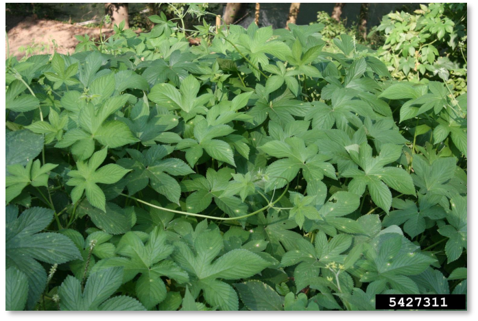
Japanese hop plants (above) and foliage (below).