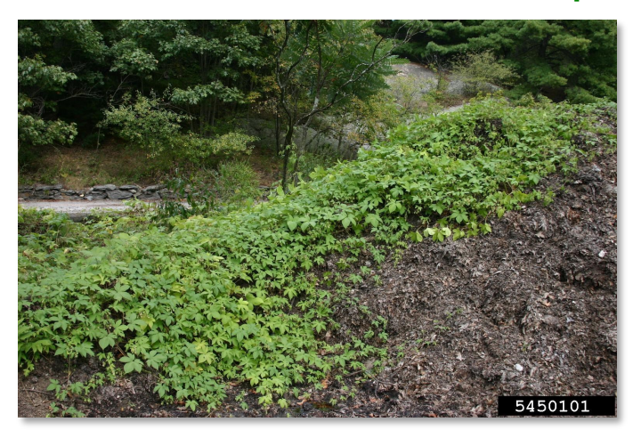
Japanese hop plants.