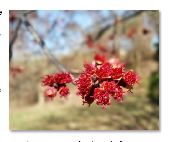
Early emergence of red maple flowers in spring.

having both male and female flowers. The tree is one of the first to bloom and seed in the spring. Small winged samaras, typically red, are dispersed in spring. The tree is good for providing food and habitat for wildlife.