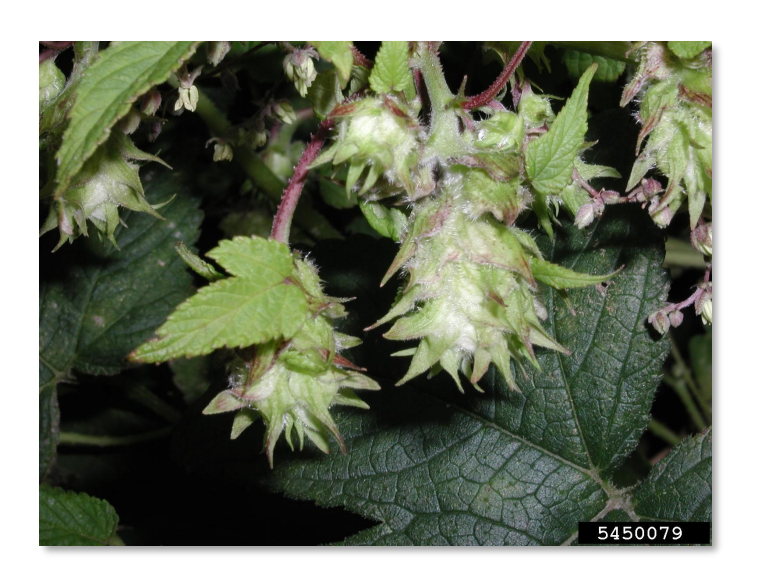
Japanese hop fruit.