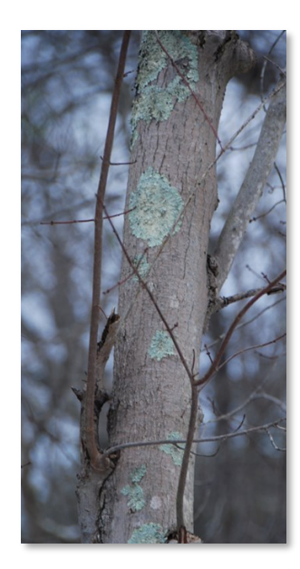
Bark of a younger red maple transitioning from its smooth characteristic to platy/scaly. Splotches are lichens living on the bark.

Red Maple, Acer rubrum, is one of the most commonly occurring trees in eastern North America. The tree is well adapted to many different site conditions, from lowlands to uplands, and shady to sunny. The tree also thrives on a variety of different soil types with various pH levels. The species has a wide geographic range, from Florida and the mid-west all the way up across southern Canada. The prolific red maple also ranges from sea level to elevations as high as 3,000'. Therefore, its suitable habitat can be found across the entirety of Maryland.