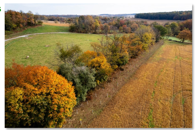
Young planted trees stand next to mature trees between pastures and fields on a farm near Leibs Creek in Stewartstown, PA.

$2 million to implement a comprehensive riparian forest buffer program.