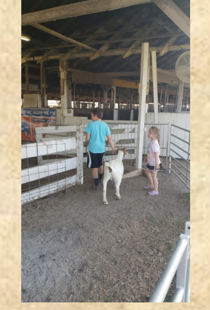
Sheep and goat weigh in June 3rd at The Great Frederick Fair!