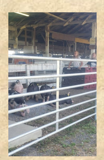
Swine weigh-in June 1st at The Great Frederick Fair !