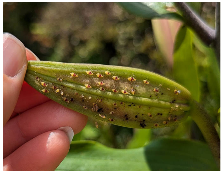
Note the distinct purple spot on these lily aphids.

Miri Talabac, UME-HGIC, found aphids on hybrid lilies this week in Laurel. This is the purplespotted lily aphid, Macrosiphum lilii. It is a relatively large, pale yellowish to yellowish-orange aphid with long, black antennae (except the bases); long, black cornicles (structures that resemble dual exhaust pipes on a hotrod); and black "knees" and "feet". The cauda ("tail") is the same pale color of the abdomen. A conspicuous, purple spot occurs on the top of the abdomen. On some specimens, the spot forms a triangle with an apex toward the head. This is one of the "coolest" aphids you will see. Unfortunately, it does damage hybrid lilies and should be controlled if populations build up. Endeavor insecticide is a good material that is an insect stylet blocker, which jams up the feeding of the aphid, which then dies of starvation.