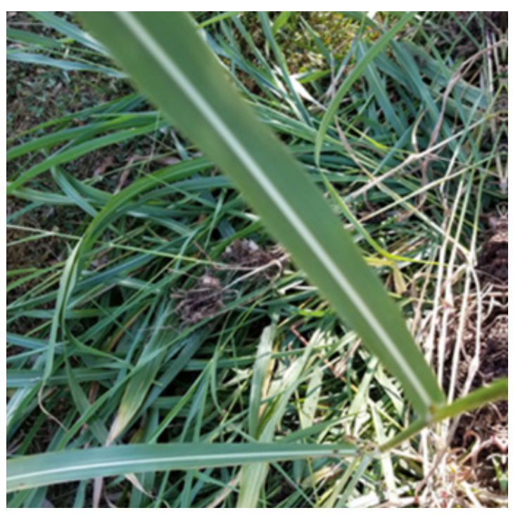
Johnsongrass has a prominent, white mid-vein