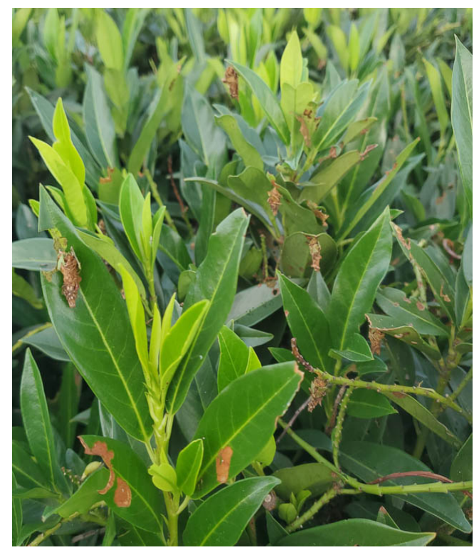
This group of skip laurel has a heavy infestation of bagworms.