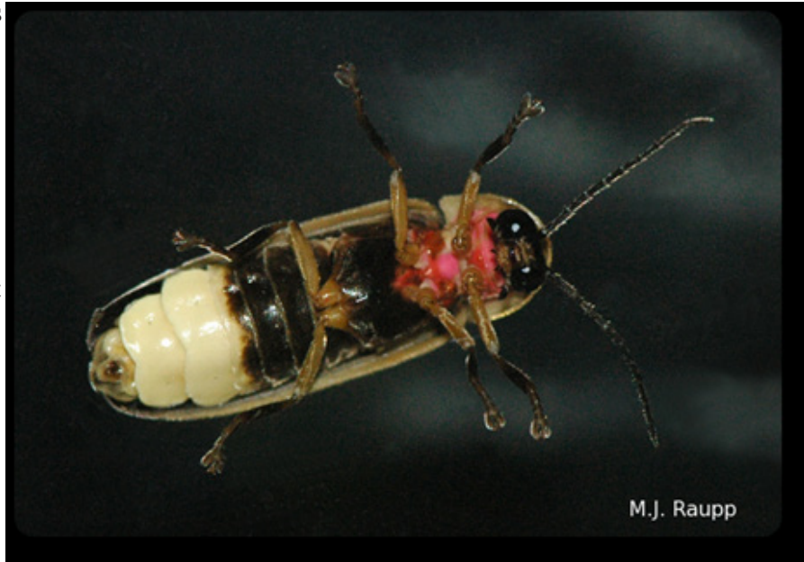
Underside view of an adult firefly showing the abdomen where the light organ is located (white segments).

of firefly and vary by sex within a species. The flashes that we see are from the males that are attempting to attract a mate. For example, males of the common eastern firefly (Photinus pyralis) flash every six seconds. Females watch the light "show" and if a display from a specific male is particularly attractive, she will flash a response but only if it is from the male of the same species. The male descends to that location to mate with her. In addition to transferring sperm to the female during