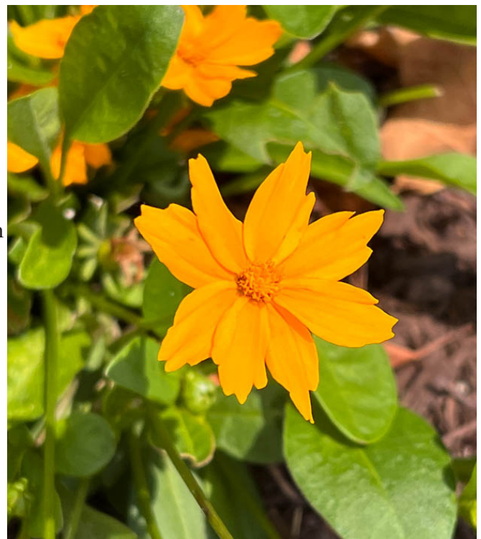
Coreopsis auriculata 'Nana'

Coreopsis auriculata 'Nana' is a wonderful but short-lived native evergreen perennial lasting about 3 years. It has 2 creative names, tickseed because the seed looks like a tick and mouse ear because the leaves look like they could belong to a mouse. These beautiful plants thrive in full sun and moist but well drained soils. They spread slowly by stolons, growing in a dense clump 6-9 inches tall and wide. Plants are cold tolerant in USDA zones 4-9, and are also tolerant of both heat and humidity. The leaves are dark green 1-2 inch long, growing in a dense clump with spoon shaped basal leaves that have a smooth margin. The golden yellow star shaped flowers grow 1-3 inches across with 7-20 ray petals that are notched with 3 lobes at the end, and surround a bright yellow center disk. Flowers can bloom from April to Jun on thin sturdy flower stalks that can grow up to 18 inches. If flowers are deadheaded, a second set of flowers can bloom in the summer into autumn. 'Nana' is the prefect size to plant in front of taller perennials in a mass or as a border. They can also be planted as an edger along walks or paths, or in a pollinator, butterfly, or cottage garden as they attract butterflies and other pollinators. There are no serious insect or disease problems, although 'Nana' is not as drought tolerant as other Coreopsis but does have resistance