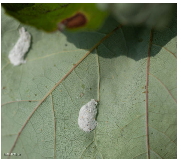
Cottony maple leaf scale is finishing up its crawler period as we move into July.

Control: Natural enemies usually keep this soft scale in check providing biological control. However, if honeydew/sooty mold is abundant, control measures may be warranted. For best control, target the crawler stage (recently hatched eggs) of the scale. Talus or Distance can be used.