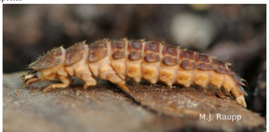
Glow-worms, larvae of fireflies, are predators that live in the soil and search for prey.

copulation, the male offers a nuptial gift of rich protein, which the female uses to provision the eggs that will soon start to develop in her ovaries. Click here to see a video of fireflies flashing and mating – watching insect behavior is really interesting. Interestingly, in one species of firefly, Photuris pensylvanica , the female mimics the flash pattern of another species, Photinis pyralis , to attract the male of the other species to her. When the male of the other species arrives thinking, he has found his mate - she eats it to obtain defensive compounds used to protect her eggs. A bad surprise for that male.