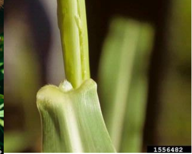
The fuzzy collar of johnsongrass.