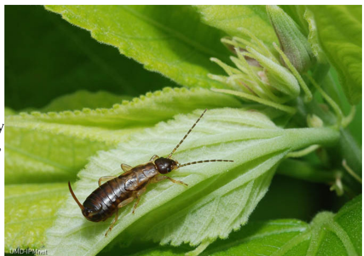
More reports than usual are coming into the UME-HGIC Ask Extension website this year. The photo is an earwig nymph.

Response from Stanton: Earwigs are omnivorous scavengers that eat decaying plant material, pollen, and other insects, including small pests like aphids. This said, earwigs can chew irregular holes in the leaves, buds, flowers, and fruits of many plants, including vegetables, fruits, and tender young plants.