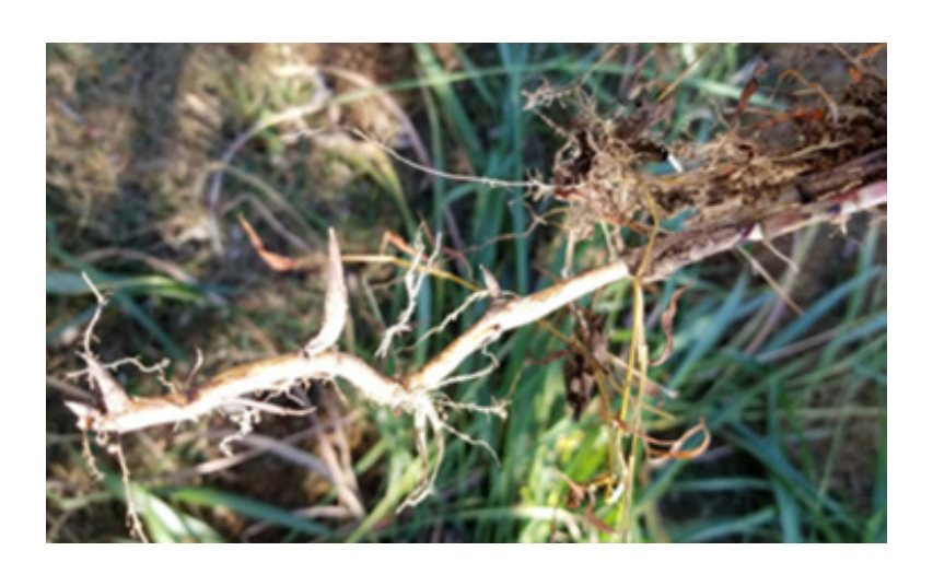
Johnsongrass has a dense rhizome