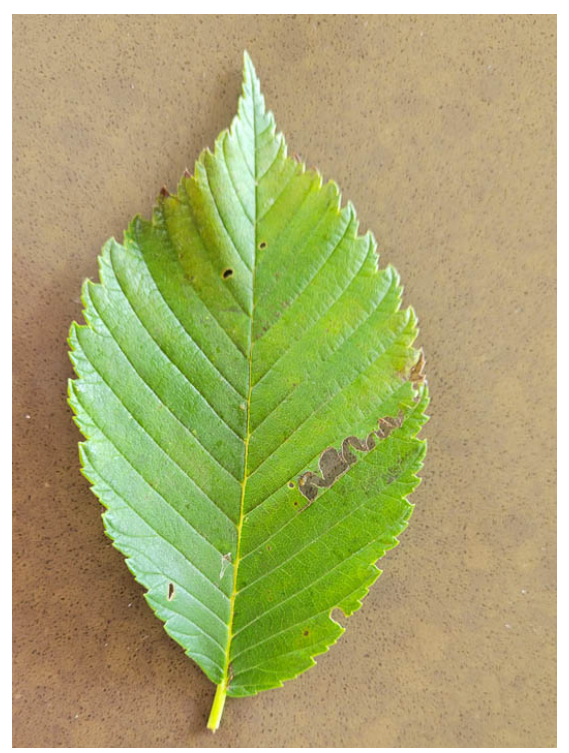
Views of elm zigzag sawfly damge on leaves.

Elm zigzag sawfly was first reported in North America in July of 2020 in Sainte-Martine Quebec, the pathway of introduction to North America as well as the amount of time it has been present is currently unknown. It was identified by citizen scientists on the application iNaturalist, and later confirmed by the Canadian Food Inspection Agency (CFIA). The EZS was first discovered in the US in 2021. It has since been spotted in five Eastern states, including North Carolina, Vermont, and Massachusetts.