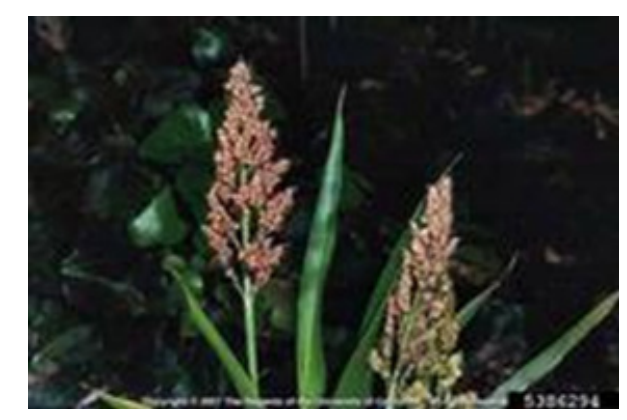
Photo 4: Shattercane Photo: Joseph M. DiTomaso, University of California - Davis, Bugwood.org <a href="https://www.weedimages.org/browse/detail.cfm?imgnum=5386294#">https://www.weedimages.org/browse/detail.cfm?imgnum=5386294#</a>