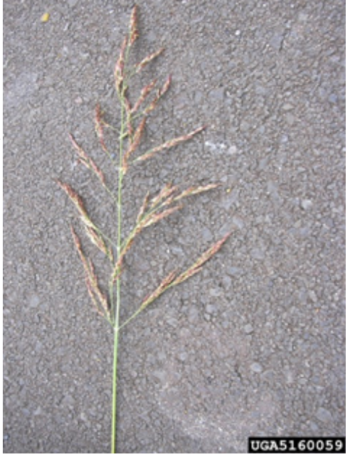
Johnsongrass seed head. Photo: Forest and Kim Starr, Starr Environmental, Bugwood.org <a href="https://www.weedimages.org/browse/detail.cfm?imgnum=5160059">https://www.weedimages.org/browse/detail.cfm?imgnum=5160059</a>

Shattercane can be easily confused with Johnsongrass. Both plant's seeds are similar in shape but Johnsongrass seeds are much smaller than shattercane seeds. The seed heads of both plants are also different. Johnsongrass has a more open panicle seed head while Shattercane has a tight cluster.