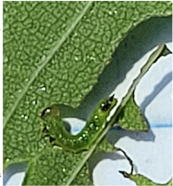
Elm zigzag sawfly larvae are active in MD.

The elm zigzag sawfly (Aproceros leucopoda) is another pest from China and Japan that has found its way to Maryland. In Europe, it has caused extensive damage with its multiple generations per year. We have yet to see how bad it will be for hybrid elms here in the United States. It can reproduce parthenogenically. More bad news - elm