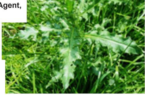
Figure 5. Young Canada thistle plant.