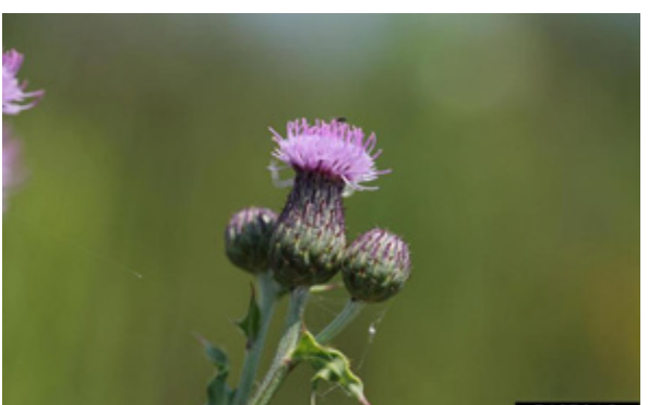
Figure 3. Canada thistle has purple flowers.