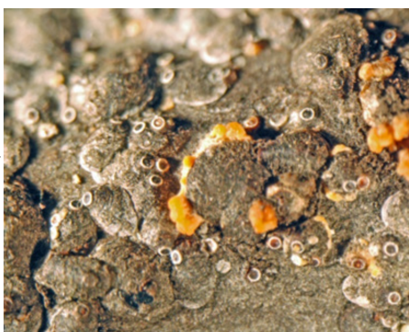
A close-up image of gloomy scale where the nectria entomopathogenic fungus is protruding from under some of