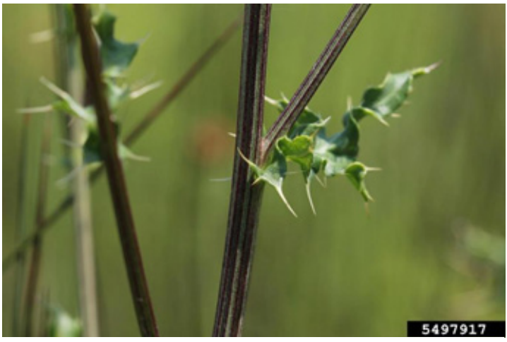
Figure 2. Canada thistle stems have no spines.