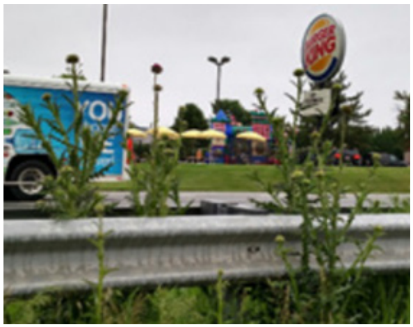
Figure 1. Canada thistle grows in many different types of areas.

Control can be accomplished by using many broadleaf post emergent herbicides. In turf areas 2,4-D with chlorsulfuron, and dicamba are effective. In beds and nursery rows repeated application of glyphosate is effective, Roundup on dry land, and Roundup Custom in damp areas. Do not spray too frequently as one wants the next generation to emerge before application. Cultural controls would include fertility management and maintaining a dense turf, but being mindful of nitrogen applications, as excess nitrogen will increase weed growth. A high mowing height to allow shading of newly germinating seeds is an effective management tool in turf. Burning is not an effective method of control for Canada thistle.