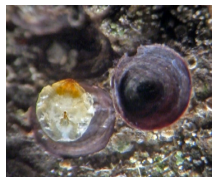
A healthy gloomy scale female (underside) with its waxy cover flipped off.

When treating scale with nectria or signs of other natural enemies, be sure to use and time application of products for when they will the least detrimental impact.