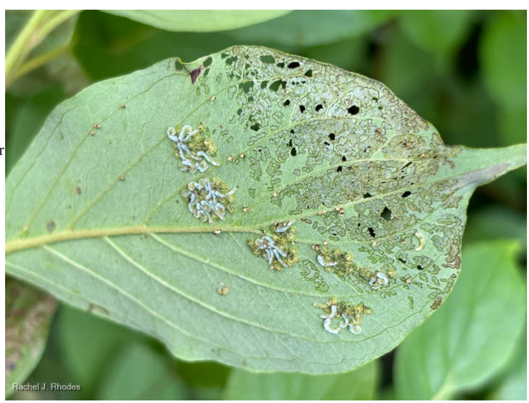
Dogwood sawfly hatched this week in Centreville.

Rachel Rhodes, UME-Queen Anne's County, found dogwood sawfly larvae on June 6 in Centreville. Rachel noted, "We're a full 10 days earlier than expected with the Dogwood Sawflies at our MG demonstration garden. Last year they started around June 15th." Early instar larvae skeletonize leaves. Later instar dogwood sawfly larvae will eat all but the midrib of the leaf. The first instar is yellowish-green in color. There are several instars where the larvae are covered in a white, waxy coating, resembling bird droppings. The last instar is yellow and black before they drop to pupate in the soil. There is only one generation per year.