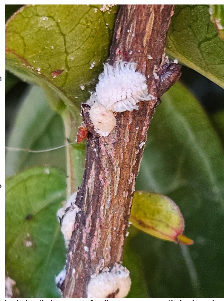
Lady beetle larvae are feeding on crapemyrtle bark scale.

Lady beetles, syrphid flies, and lace wings continue to feed heavily on these scale populations this season.