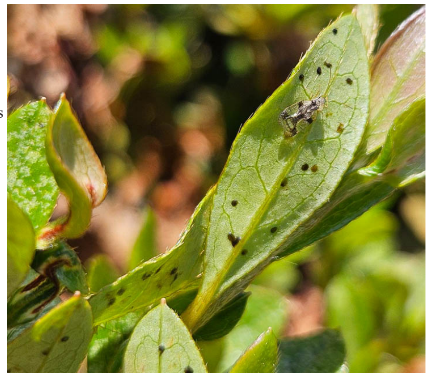
This photo shows the stippling damage on the upper side of leaves from azalea lace bug feeding; also shown in an adult and the black fecal spots on the underside of the leaf.

Luke Gustafson, The Davey Tree Expert Company, is finding a lot of lace bugs this week on azaleas, especially in full sun sites with reflected heat. Examine newer foliage for stippling damage on upper leaf surfaces. Look for dark colored frass spots and active lace bugs on the underside of leaves. There is a range of predators and parasitoides that feed on azalea lace bug that include lady beetles, lacewings, and other predacious bugs, in addition to an egg parasitoid. If populations are high, use insecticidal soap or oil (ensure contact with lace bugs on the underside of the foliage), or systemic insecticides.