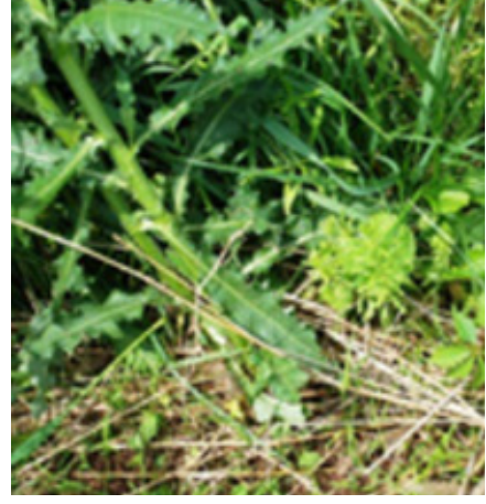
Figure 4. Canada thistle does not have a basal rosette.