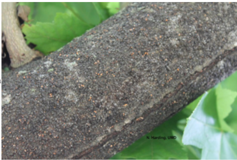
A heavy infestation of gloomy scale on the trunk of a red maple that is infected with nectria, an orange colored entomopathogenic fungus, that is protruding from under some of the scale covers.

On closer examination of the scales on the maples, I could see that there was a relatively high level of infection from an entomopathogenic fungus (EPF) in a group referred to as nectria fungi (Nectriaceae) (see images). It appears as an orange substance emerging out from under the scale covers (see images). I have noticed a similar fungus on other armored scales in the landscape such as obscure scale on oak. In going through published papers on fungi that attack armored scale, I realized that there is not that much known about these fungi. There are reports of several species of EPFs attacking armored scales. It was also noted that in some instances where there appeared to by high incidence of the fungi, there was some mortality of the scales, but it was not really observed to provide appreciable control. Others have observed moderate control of certain the scale covers. scales. I inspected the gloomy scale we found under the microscope. When I flipped scale covers