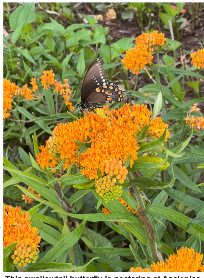
This swallowtail butterfly is nectaring at Asclepias tuberosa flowers.

stems, those with sensitive skin should wear gloves when working with butterfly weed.