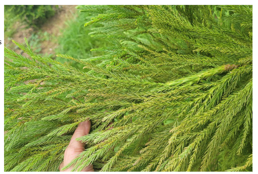
If you see yellowing on cryptomeria needles, look closely for spruce spider mites.

Options are mitcides such as Avid and Sanmite. The mite growth regulator, Hexagon, has provided excellent control of the immature stage of spruce spider mites in our field trials and is very soft on beneficial organisms. It can be difficult to get control on large trees. You need to use a fine mist sprayer to get good coverage on the upper branches. Drift can be a problem.