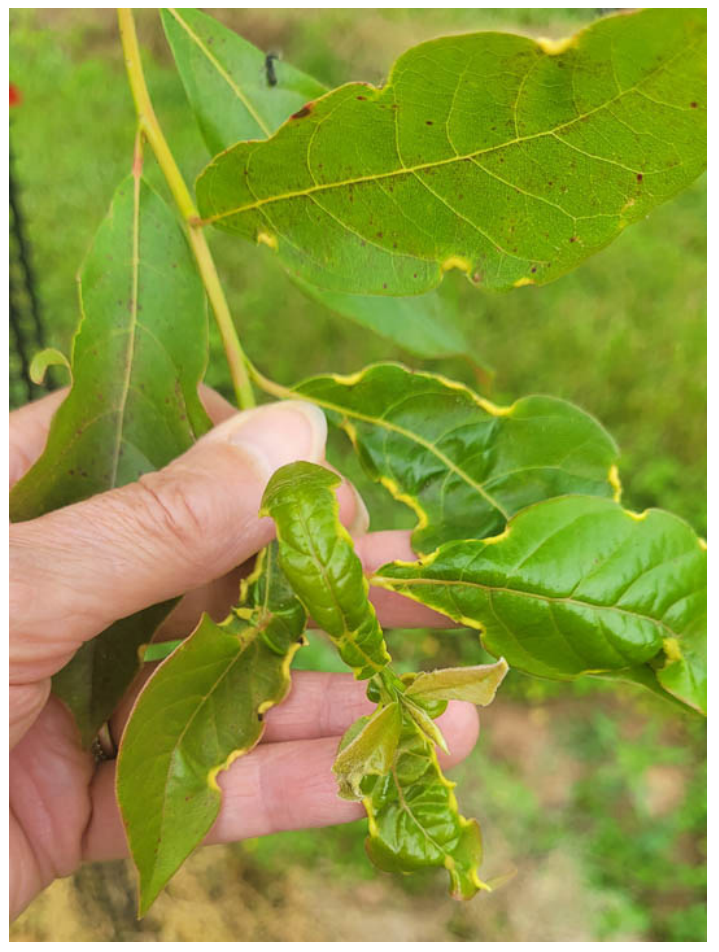
This damage on black tupelo is caused by an aphid.