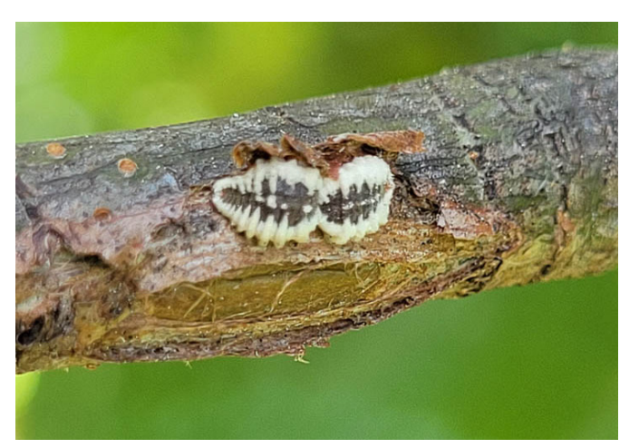
European elm scale has an extended crawler period during the summer.

Control: Look for beneficial insects which can do a good job controlling this scale. If an insecticide application is necessary, treat with a soil drench of dinotefuran (Safari, Transtect) or make foliar applications of Distance or Talus.