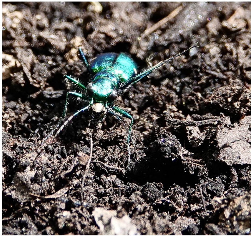
Six-spotted green tiger beetle adults are very fast fliers.

Nancy Woods found a female six-spotted green tiger beetle, Cicindela sexgutatta , that was laying eggs. The tiger beetle is a predator as a larva and an adult. It is a very fast flier as it goes after prey. The larva hangs out in a burrow and then reaches out and grabs prey as it goes by. These beetles are often found along open, wooded pathways.