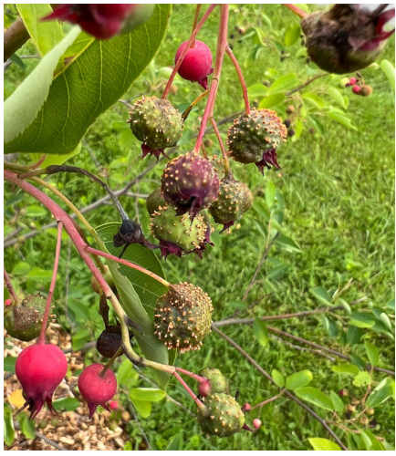
Gymonsporangium rust infections are still active.