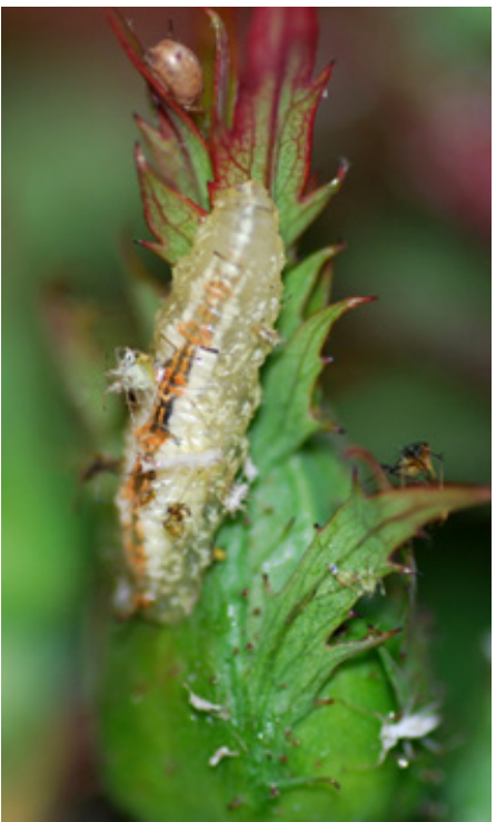
Syrphid fly larvae are voracious generalist predators that feed on psyllids, aphids, mites, and other small insects.

There are several generations of syrphids a year. Life stages include the egg stage, 3 larval instars, pupa, and adults. Syrphid fly adults are not predacious, they only feed on nectar and pollen and are considered important pollinators for some plants. In fact, they require floral resources to obtain the nutrients they need to make eggs and produce young. The larval stage of syrphid flies is the predacious stage and they are generalists feeding on a diversity of soft-bodied insects. Syrphid fly adult females cue in on branches infested with potential food for their larvae. The female will lay small white eggs individually on the leaves or buds of these infested plants. Once the eggs hatch, the legless maggot-like larva search for and voraciously consume prey items. Larvae vary in size (4-18 mm) and color patterns (yellow, pink, green, or brown with yellow or white markings) depending on life stage and species. The body tapers at one end and it is this "pointed" end that is the head end