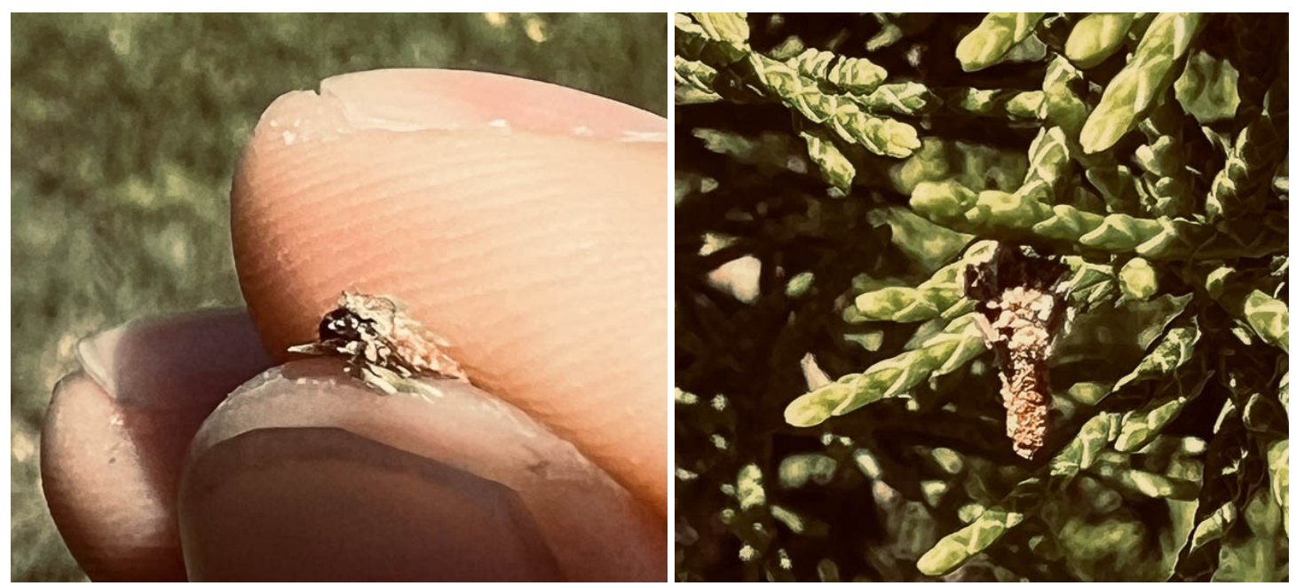
Check trees for bagworm egg hatch. It is most effective to treat larvae when small.

Monitor plants such as arborvitae, spruce, and Leyland cypress. Bagworms are also found on deciduous trees and herbaceous plants, but the damage is usually less evident. Since temperatures and accumulated degree day levels vary throughout the area, be sure to check infested trees for egg hatch before treating. Bt (Dipel, Caterpillar Attack), Spinosad (Conserve) or Acelepyrn will all give good control of young larvae.