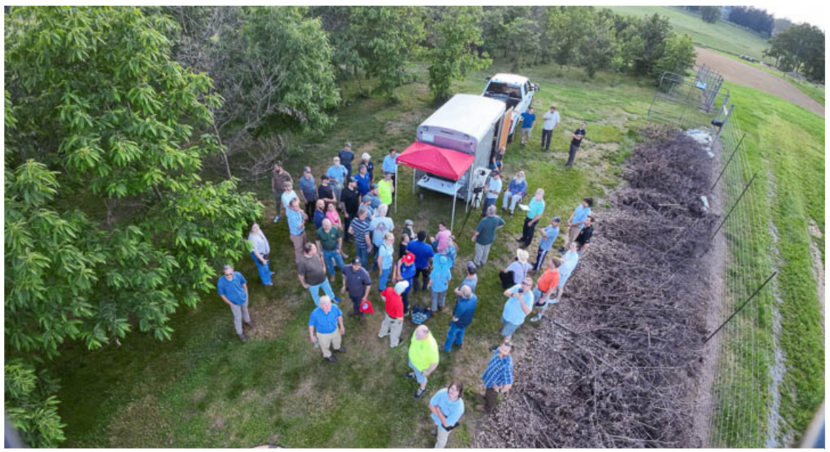
'Drone's eye view' of the tour group during the IPM program.

There were about 60 people who attended the Maryland Arborists' Association (MAA) and UME Diagnostic session on May 22 here at the Central Maryland Research and Education Center in Ellicott City. There were powerpoints and a drone demo during the program. MAA and UME will a follow-up session on June 27 from 5 p.m. to dark at Carroll Community College in Westminster.