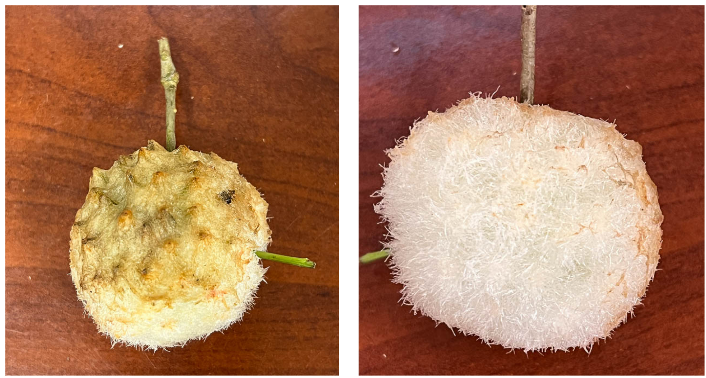
A wool sower gall cut open to show the inside of the gall.