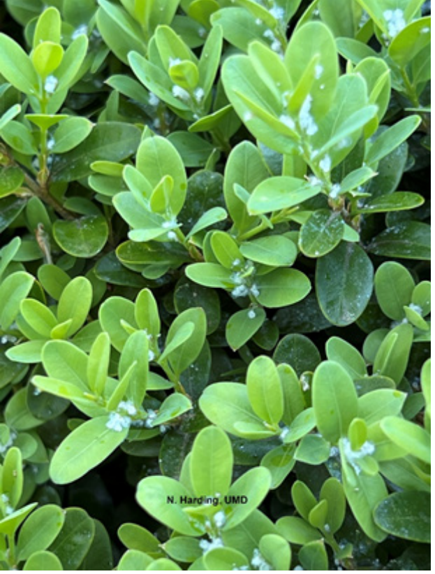
Wax from psyllids on boxwood. Predatory syrphid larvae were found in the new growth where psyllids were feeding.