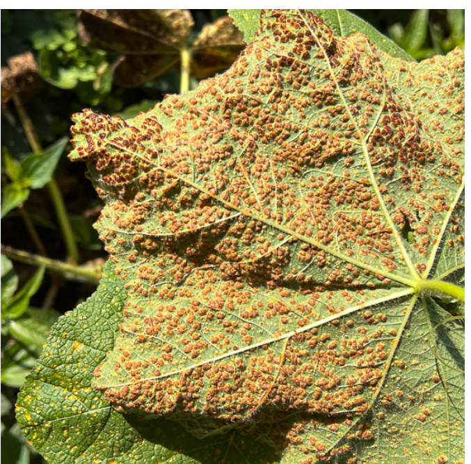
This photo shows a rust infection on the upper and lower leaves of hollyhock.