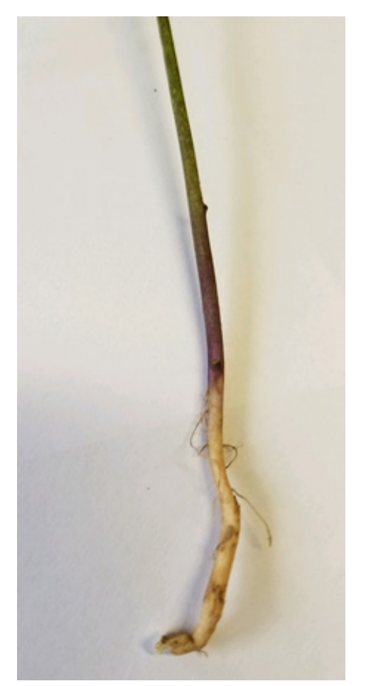
Photo 1: Horsenettle stems are angled at the nodes.