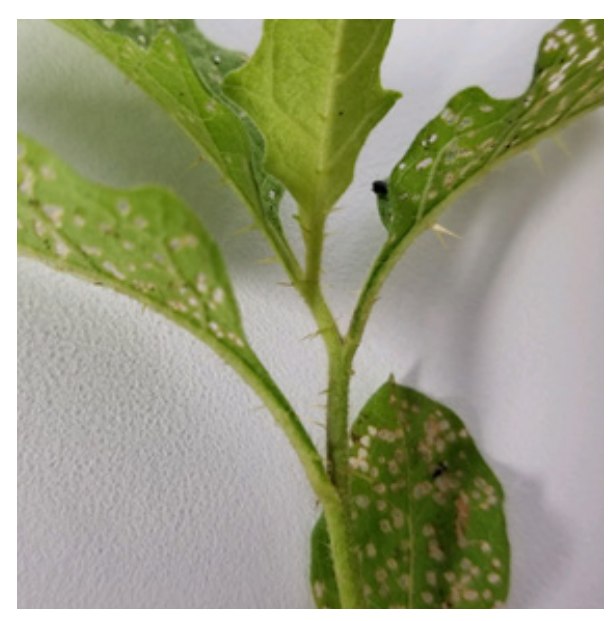
Photo 2: Thorny projections on horsenettle leaves.

Control of horsenettle in turf can be achieved by mowing. Dense turf prevents Horsenettle from thriving. In landscapes and nursery, prevention is important. For plants that do become established, use of post emergent products containing glyphosate, 2,4-D, or Dicamba are useful as a spot spray. Selective post emergent products are less than successful in control of this weed and can be problematic in a nursery or landscape setting.