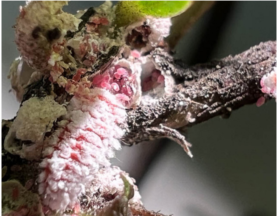
Crapemyrtle bark scale eggs are hatching and being fed upon by Hyperaspis lady beetle larvae.

I saw this gathering of Hyperaspis larva week on a property in Baltimore City. The individual had scrubbed the portion