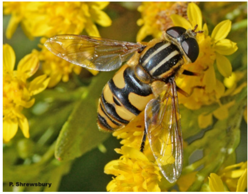
Syrphid flies feed on nectar and pollen when they are adults. Note the diagnostic one pair of wings, large eyes, and short antennae on this true fly that mimics bees.

that help to suppress many small soft-bodied insects such as psyllids, aphids, spider mites, thrips, small caterpillars and other prey. If you have plants infested with aphids, within a short time period you will have syrphid fly larvae snacking on the aphids. A single syrphid larva can consume about 400 aphids in its lifetime. Since adults feed on nectar and pollen be sure to provide flowering plants to attract and support syrphids and other omnivorous natural enemies.