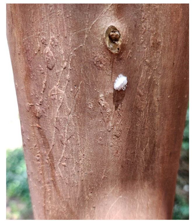
Hyperaspis lady beetle larvae are feeding heavily on a population of crapemyrtle bark scale.