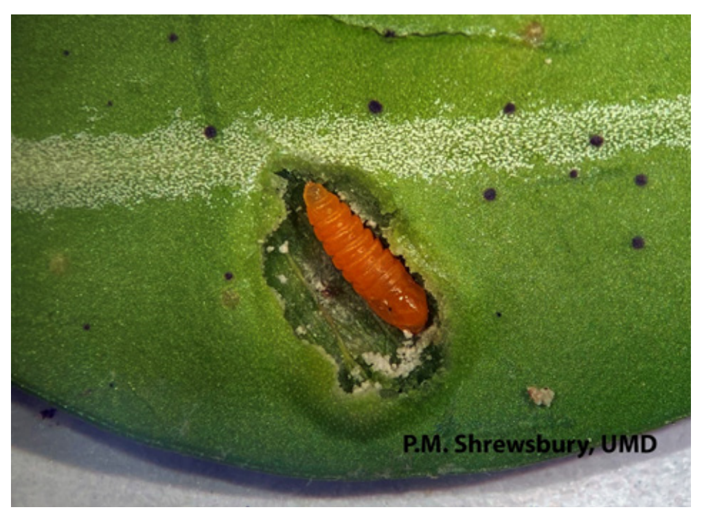
Fig. 2. Close up image of the early pupal stage of the boxwood leafminer. You can see the start of the wing and leg structures on one end of the pupa. Pupae will continue to develop until about 249 DD accumulations.

This is not the time to apply control measures since the damage is done. You want to protect the new growth of the boxwoods. Emergence of adult leafminers are a target stage, along with the larval stages, for treatment. See the <u>April 9, 2021 IPM Newsletter</u> write up on boxwood leafminer for more information on control options.