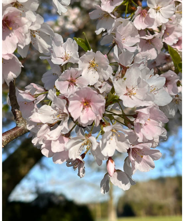
The light pink Yoshino cherry buds open to fragrant white flowers tinged with pink.