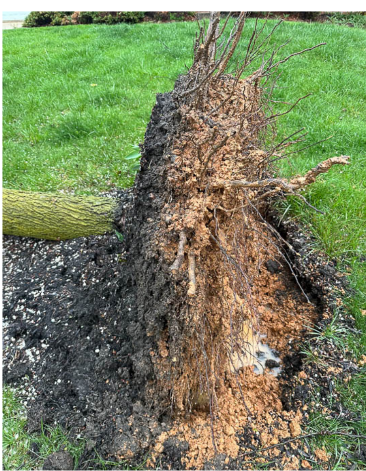
A shallow rooted tree came down during the recent heavy rains.