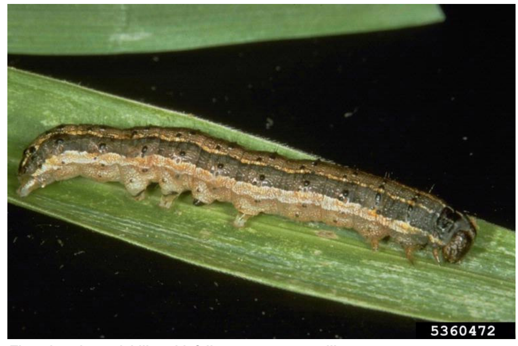
There is color variability with fall armyworm caterpillars.