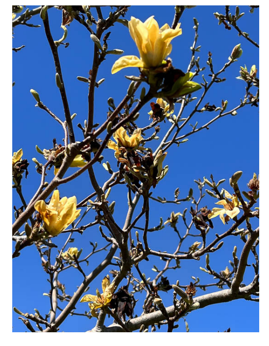
This magnolia, 'Madam Butterfly' bloomed, froze, and then bloomed again.