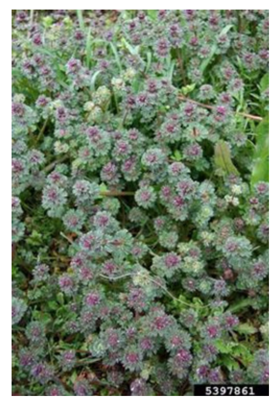
A henbit population.

Since henbit seeds germinate in the fall, take note of the areas that have henbit this spring, then go back to those same areas this fall and do herbicide applications and/or mowing to control seedlings and younger plants as needed.