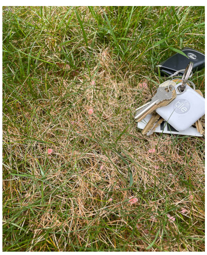
Pink snow mold causes patches of white or tan areas in turf. Look for pink growth on the outer rings of these areas.