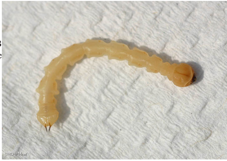
Emerald ash borer larva.

In trials conducted while I was at Ohio State, I found emamectin benzoate to provide three years of control even at low rates on 20-25 inch trees under very high pest pressure. We also found working with nursery stock that larvae could mature and adults emerge from one-inch trees. We continued to trap adults in