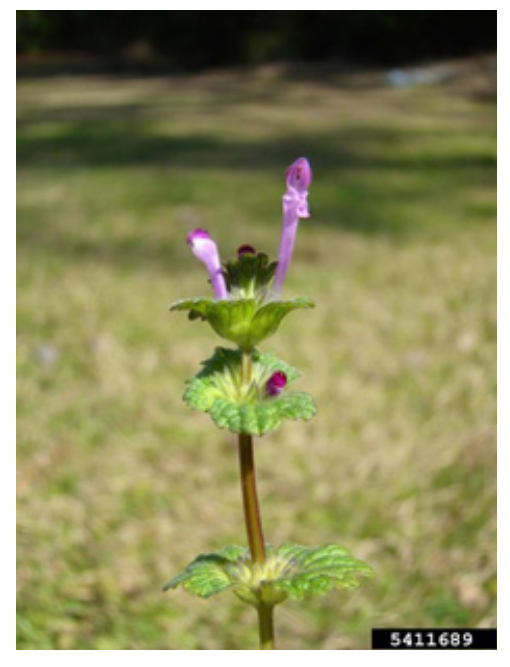
Henbit leaves and flowers.