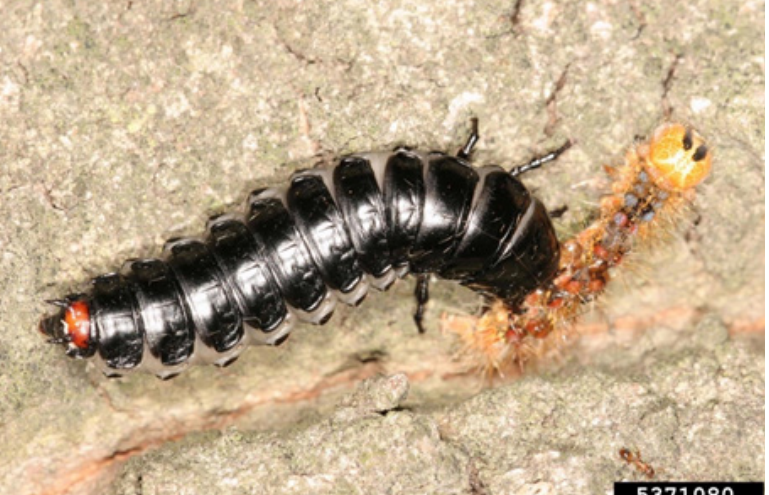
The larva of a fiery searcher feeding on a gypsy moth caterpillar.