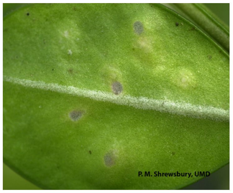
Fig. 1. Clear somewhat circular "window panes" can be seen on the underside of boxwood foliage as boxwood leafminer development approaches pupation.

In Bowie, MD on April 2<sup>nd</sup>, we observed heavy boxwood leafminer damage and activity. Upon observation, there were "window panes" on the underside of the infested leaves (Fig. 1). These are made by late instar larvae as they are preparing to pupate (prepupation). The chew away most of the leaf material leaving just the membrane of the leaf so it is easy for the pupa, when ready, to push its way out of the leaf. When we dissected the leaf, the early pupal stage of the leafminer was present. The larvae are likely just pupating now. The wing and leg structures can be seen on one end of the pre-pupa. With time, the pupae will develop and push their way out of the leaf and eventually you will see pupal cases sticking out of the leaves. Based on our Pest Predictive Calendar , boxwood leafminer adult emergence occurs when the growing degree days around 249 DD and serviceberry "Autumn Brilliance" is in full bloom. Note – See the end of this newsletter to see what DD accumulations are in your area.