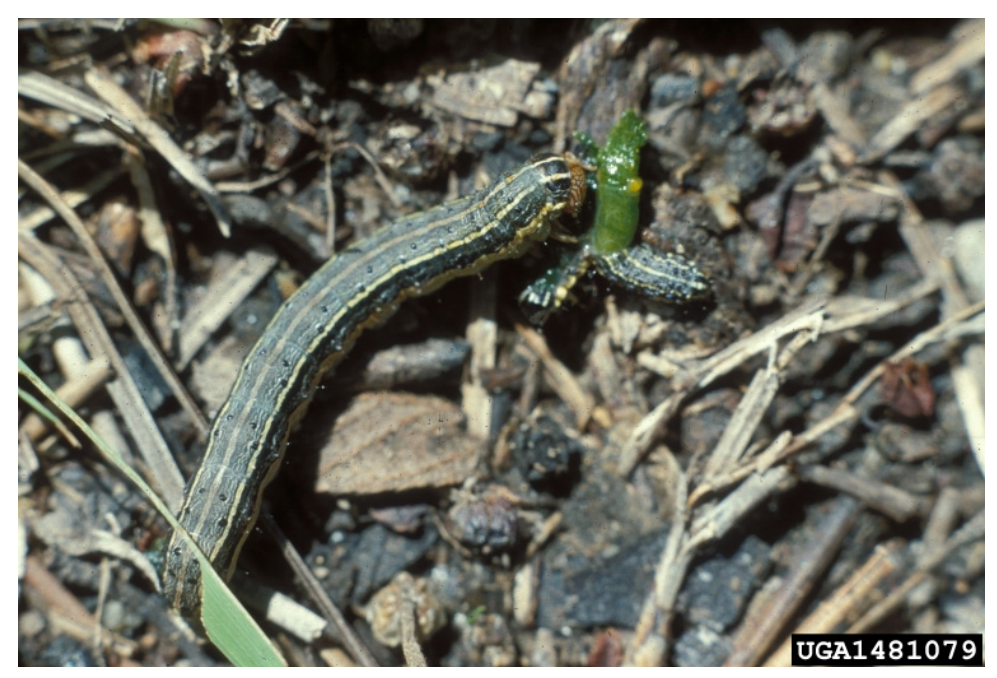
Fall armyworm caterpillar.

I am getting emails and text messages of turf managers finding larvae in turf. The reports are coming from the southern part of Pennsylvania and Prince George's and Baltimore counties in Maryland. There are dozens and dozens of larve being found in turf right now. The pictures appear to be either cut worms or fall armwyworms. We have requested samples from several people in order to identify the larvae. If you are seeing larvae, please send me photos. I need to see the head capsule, a side view, and a top view. Please let me know where you found them and the population numbers, so we can determine if these infestations are widespread. Below are photos of what armyworms look like. I need to determine if this is the same thing we are seeing now.