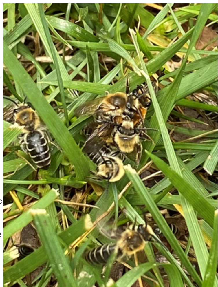
The female plasterer bee, Colletes thoracicus, in the center has two male bees on her and several more trying to get to her. Who will be the father of her babies?