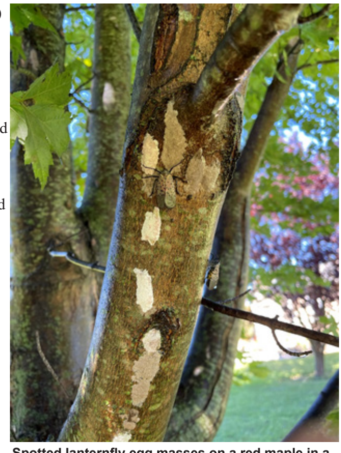
Spotted lanternfly egg masses on a red maple in a residential landscape in Washington County MD.

Please email me (<u>pshrewsbury@umd.edu</u>) if you have potential locations that could be used for the research, and / or when you start to see SLF eggs hatching.