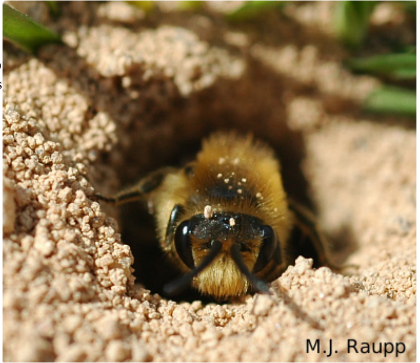
Plasterer bee emerging from the ground nest she has dug and provisioned with pollen for her brood.

What is their benefit? Plasterer bees are excellent early season pollinators of a diversity of plants. These early season pollinators feed on pollen and nectar from about 38 different