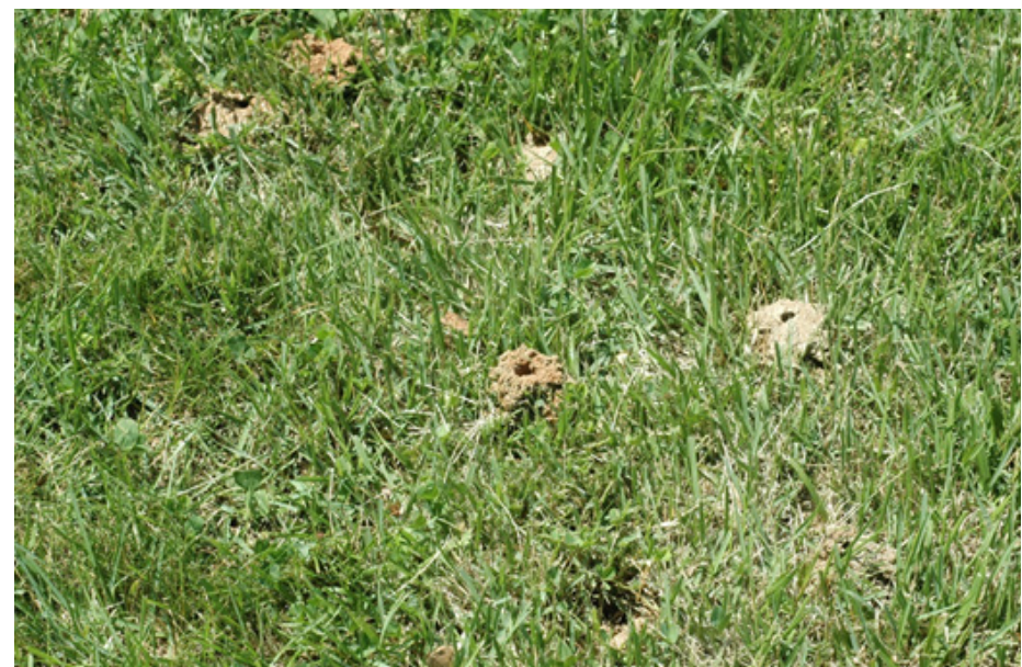
Above are the tumuli (opening with soil mounded around it) of nesting burrows of plasterer bees in a home lawn. Aggregations of these solitary bees are common in lawn areas with sandy soil and/or thin turf.

Adult plasterer bees are hairy. They have dark bodies and the males, about 1/2" in length, have tufts of blonde hairs on their "face" and thorax. Females are slightly larger and have reddish-brown hairs on its thorax. They are not aggressive and are not known to sting people. There is one 1 generation / year and time of adult activity varies with species. Males usually emerge before females. The males fly a few inches above the lawn, crawl around the ground, and in some cases enter nest holes in hopes of finding and mating with a female. The phenomena where males emerge before the females, is referred to as protandry, and is not uncommon in the insect world. Basically, by emerging first the males are ready and waiting when the first females emerge increasing the chance of their sperm making it to fertilize a female's eggs. It is not unusual to see a mass of bees clustered together in a