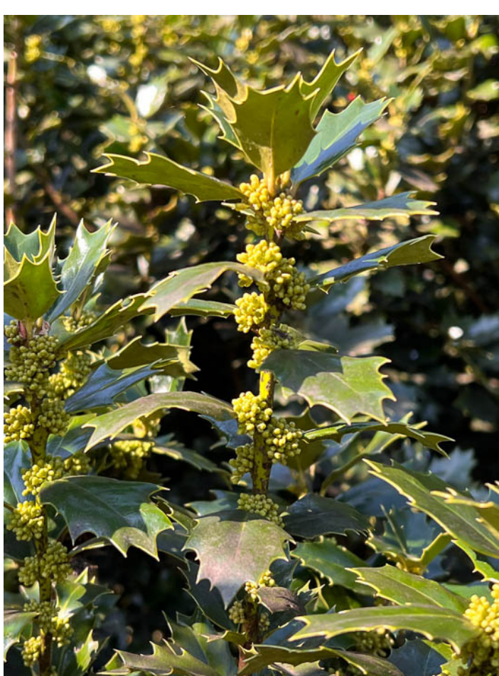
Ilex x meserveae 'Blue Prince' is cold hardy in USDA zones 4-7.

Ilex × meserveae 'Blue Prince' is also known as a blue holly. Both 'Blue Prince' and 'Blue Princess' were developed by K. Meserve in New York by crossing I . aquifolium or English holly and I. rugosa or Tsuru holly, a Japanese holly. Both of these hollies were very cold tolerant and the crosses that developed, 'Blue Prince' and 'Blue Princess', are also very cold tolerant in USDA zones 4-7. Holly plants are dioecious, meaning they are either male or females, and it is a common practice to plant one male holly for every 3-5 females. The blue hollies thrive in average moist, well drained, slightly acidic soils in full sun to part shade, especially afternoon shade. Plants grow into dense shrubs between 6-8 feet tall and wide, but can reach heights of 15 feet like the 'Blue Prince' in my garden. They have opposite, waxy blue green, glossy evergreen leaves with prominent spiny margins that are on purple stems. The flowers of both 'Prince' and 'Princess' are white with shades of green and bloom in May in small clusters around the base of the leaves. 'Princess' will develop very showy bright red berries in the autumn that will stay on the trees until spring. Blue holly can be used to create boarders, as a foundation plant, or hedges and screens. Pests can include holly leafminer, scale, spider mites and, whitefly. Diseases can include leaf spot, leaf rot, powdery mildew and tar spot. In soils with high pH, the leaves can develop chlorosis which can cause the yellowing of the leaves.