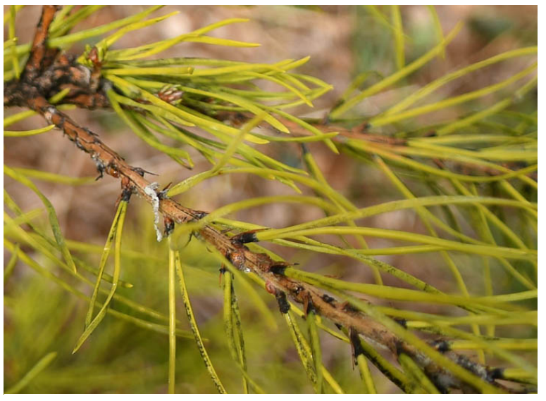
Tortoise scale on tabletop pine.

Distance or Talus can be used when crawlers are active. Systemics such as Altus and dinotefuran are also options.