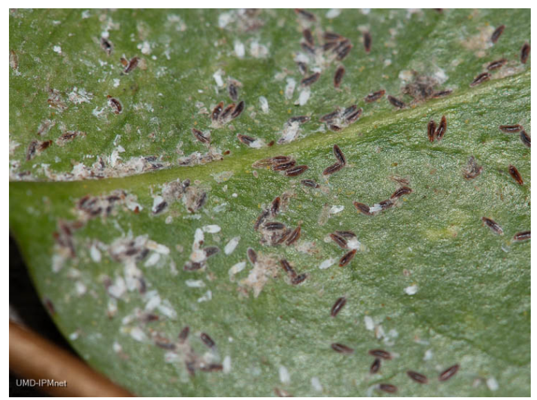
Tea scale with small yellow crawlers on a camellia leaf. The photo is from early May 2022.