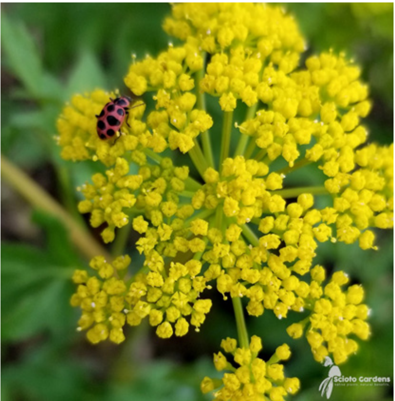
Golden alexanders, Zizia aurea (Apiaceae), provides early season floral resources for natural enemies and pollinators. The plant is a herbaceous perennial in the carrot family and is native to the U.S.

In addition to choosing the appropriate plant species for conserving pollinators and natural enemies, there are several other factors to consider. For example, plants should be selected so at least a few species of plants are in bloom at any given time throughout the entire season. Most challenging are plants that bloom very early in the season (some trees fulfill this niche) or very late in the season. For example, the solitary "tube nesting" mason bees become active around the middle of March in MD. Mason bees began activity last week in Columbia, MD. These early season solitary bees have been seen foraging on maples (Acer spp.), witch hazel (Hamamelis x intermedia 'Arnold Promise'), and Oregon grape (Mahonia aquifolium) to name just a few early blooming plants. Also, a clump or cluster of the same flower species are more attractive than isolated plants. Flowers should vary in their floral architecture as big flowers (ex. Compositae) will attract different insects than small flowers (ex. Umbelliferae). Choose plants with several colors of flowers. Include native grasses that provide overwintering habitat for some predators. Plant species and floral architecture diversity is good!