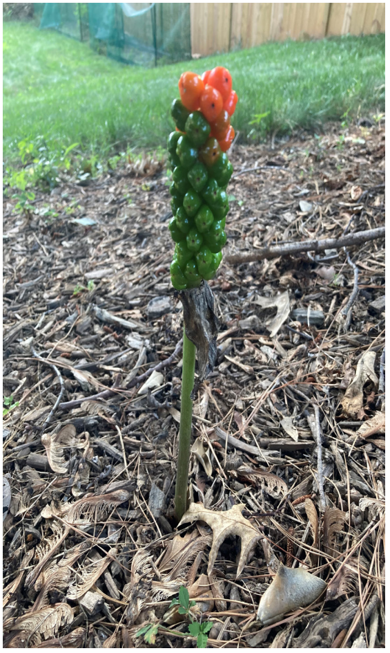
Figure 2: Italian arum berries.

Be aware that Italian arum is considered at least a skin irritant, and is considered by some as poisonous. There is limited information on effective herbicides. The waxy leaves make it difficult for herbicides to penetrate the plant. Mechanical removal is another option. If you choose this route, wear gloves and protective clothing to ensure it does not touch your skin. Carefully dig around the plants to remove as many of the corms as you can, but be mindful that some may be left behind which will help with next year's plants. Plants that are removed should be placed in a bag in the trash, and not in compost piles.