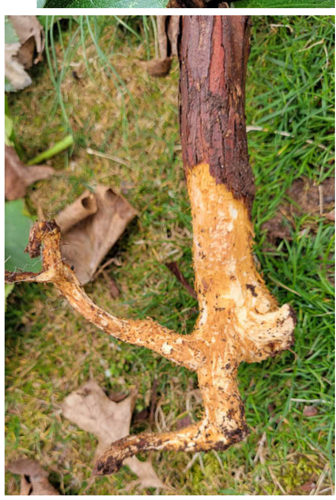
A dwarf chamaecyparis in the ground for over 15 years came out of the ground very easility and revealed heavy vole damage. It was in an area was not raked in the fall.