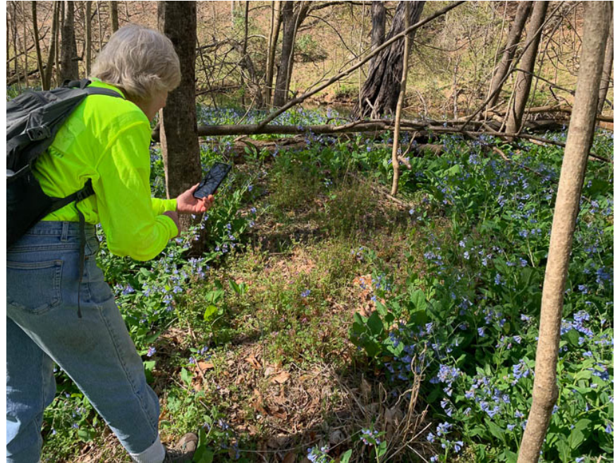
Volunteer examining an area where a new clump of incised fumeworts are displacing Virginia bluebells

In either case, it helps to understand that the species is biennial. The flowers of secondyear plants are easy to see, but seedlings are inconspicuous. If management only targets flowering plants, that can be a viable strategy. But for folks who didn't realize there were also seedlings present, it can be shocking to see that despite all your hard work there are even more flowering plants the next year. This gives the impression that management is failing, which may or may not be true. My casual observation is