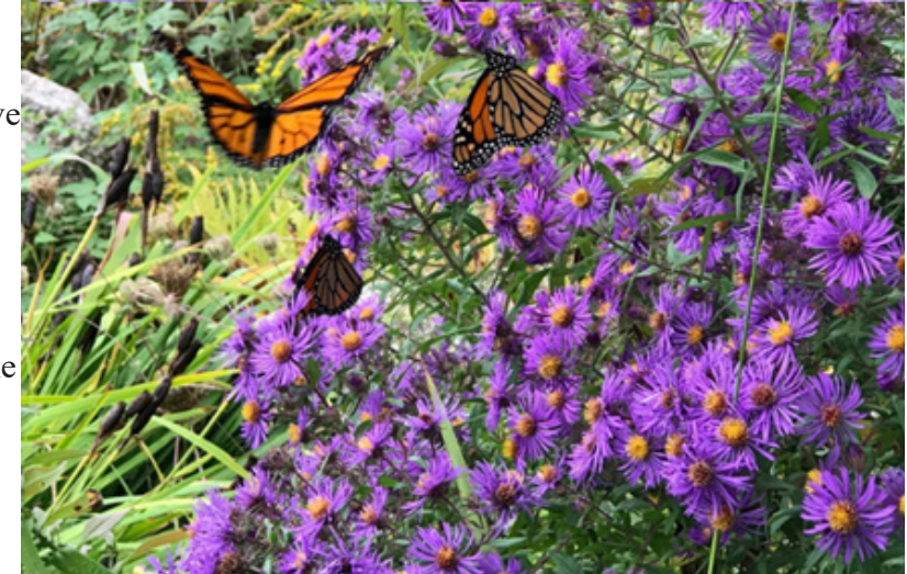
New England aster, Aster novae-angliae (Asteraceae), is a fall nectar source that research has shown to attract a diversity of pollinators and natural enemies. This plant is a herbaceous perennial and native to the U.S.