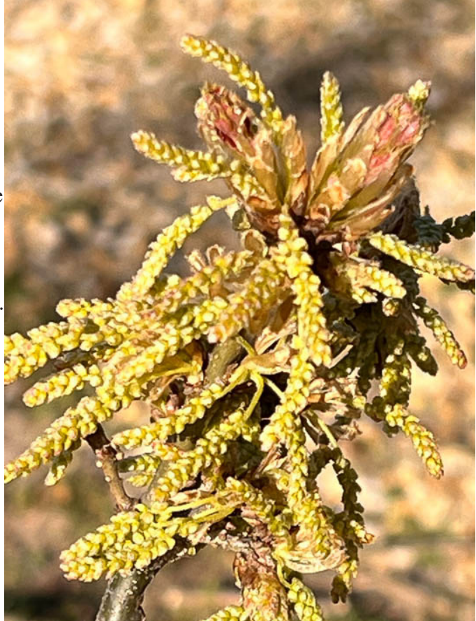
Male pin oak flowers starting to open.

straight central leader, but becomes more oval-pyramidal as it ages. In the spring the twigs of the previous year bear the yellow pendulous monoecious male flowers called catkins, releasing thousands of tiny pollen particles into the air. The female flowers are produced a bit later on the current year's growth so they do not get fertilized by the same tree. In the autumn the fruit matures into a tan acorn with a thin smooth cap that covers about 1/4 of the nut. Once the weather begins to chill, the dark green leaves change to russet, bronze or red. During the summer pin oak is home to a large variety of caterpillars including the imperial moth, lots of hairstreak species, and duskywing caterpillars. Lots of small mammals and deer feast on the acorns in the fall. Some cultivars include 'Crown Right' which has a more upright habit, 'Green Pillar' ("Emerald Pillar') a columnar form and 'Sovereign' that doesn't have the lower branches hanging downwards, instead they are held out horizontally. Pests can include galls, the Spongy moth caterpillar and oak wilt.