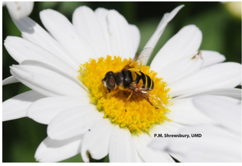
Syrphid fly (predator) adult on a Shasta daisy flower (Asteraceas) feeding on nectar and pollen. Syrphid fly females require pollen to produce eggs.

Happy spring everyone! It is the time of year when we are planning and planting for the season. As decisions are made as to what to plant there are several factors to consider in addition to just aesthetics. Today I will focus on plants and the resources they provide for beneficial insects. Plants provide resources in the form of nectar and pollen for beneficial insects such as pollinators and omnivorous natural enemies, in addition to alternate prey for natural enemies. Numerous studies have shown that more diverse plantings (more species of plants and greater vegetation complexity) provide a greater diversity of resources and therefore support a greater abundance and diversity of beneficial insects, and biodiversity in general. Greater diversity leads to more resilient and sustainable systems. Research has also documented that urbanization, agriculture