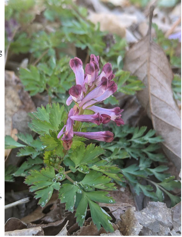
The distinctive, two-toned purple flowers of incised fumewort

https://www.nps.gov/articles/000/incised-fumewort-corydalisincisa.htm#:~:text=Identification,supported%20by%20a%20 tiny%20tuber.