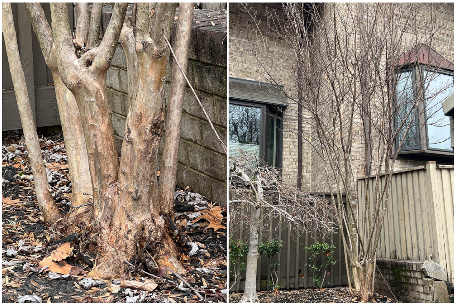
Before and after photos of a rejuvinated crape myrtle after proper pruning.