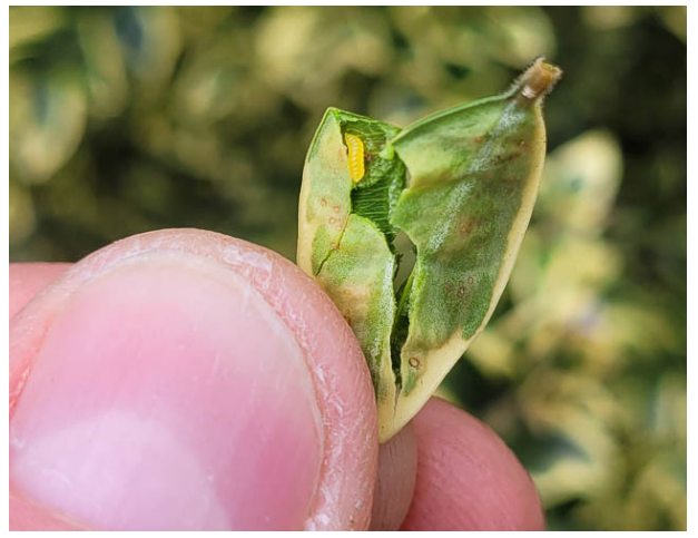
Boxwood leafminer stage on March 5 in Catonsville.

Boxwood spider mites are not yet active in our location, but eggs are present. This mite hatches earlier than many other mites, so you can expect to see hatching soon if the warm weather continues. Thoroughly check petioles and undersides of leaves for eggs. If there are no adults present yet, then you could use a 3% hort oil to treat the egg stage.