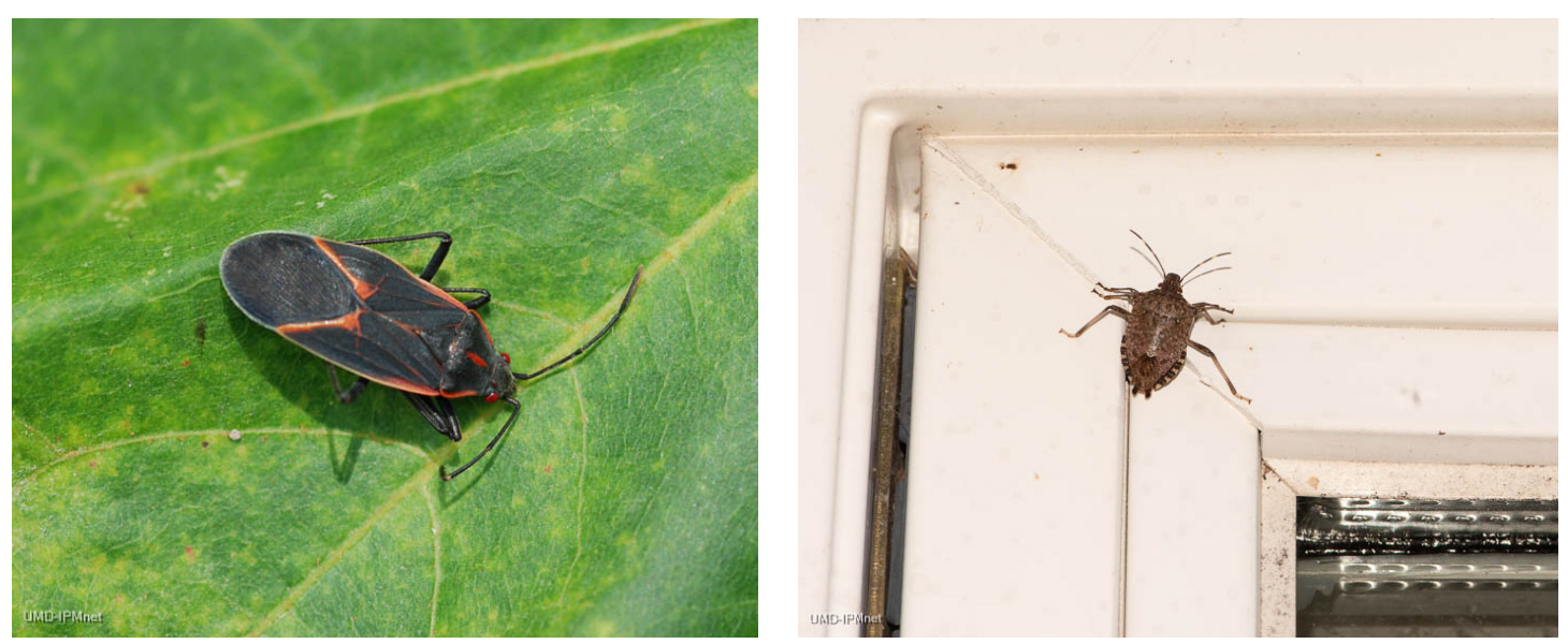
In early spring, boxelder bug adults and brown marmorated stink bug adults that overwintered are active.

So far this spring, we are about 7-10 days ahead of a "normal" schedule, if such a thing still exists.