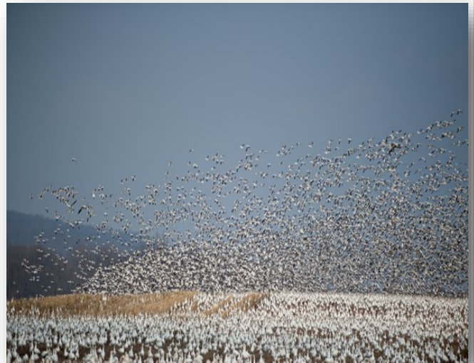
Fig. 1: Wild geese during spring migration at Newmanstown, PA

Waterfowls, shorebirds, gulls, and terns are among these migrant birds and are known to have the avian influenza (Bird Flu) virus naturally. Nesting grounds and stop-over sites of these birds are mixing vessels of the Flu virus, where new viral variants arise from the intermixing of birds from wide geographical regions. Among the four major migratory pathways, the Atlantic flyway, which straddles across the eastern coast of North America and South America, plays an important role in the epidemiology of Bird Flu. The spread