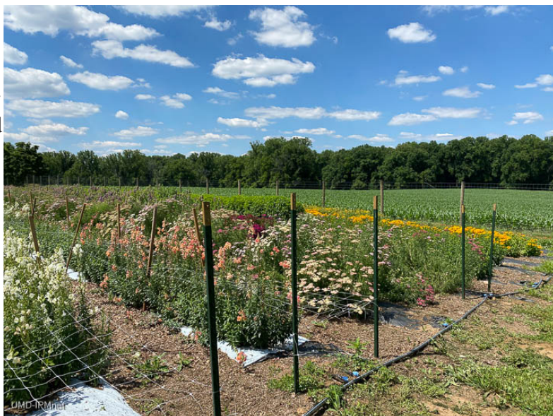
Castlebridge Farm Cut Flower Plots

This event will be held at Castlebridge Flower Farm in Ellicott City, MD. We will have information on how to register in upcoming IPM alerts later in the season.