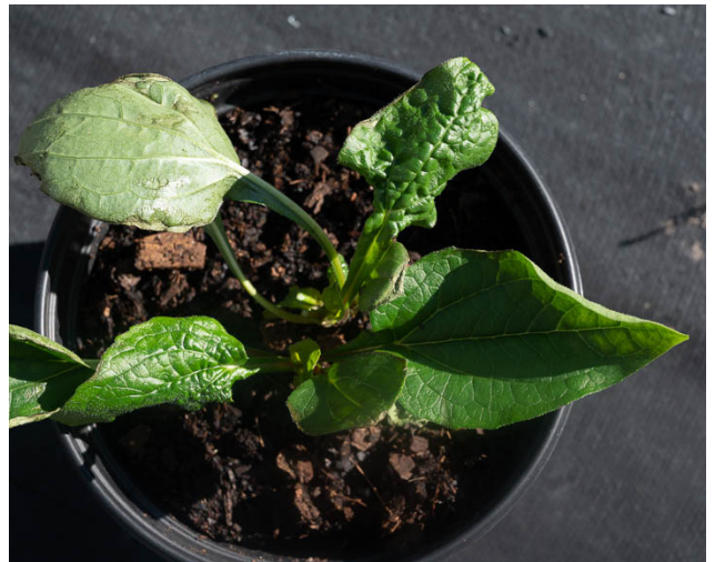
Distorted foliage on coneflower caused by green peach aphids feeding.

The information given herein is supplied with the understanding that no discrimination is intended and no endorsement by University of Maryland Extension is implied.