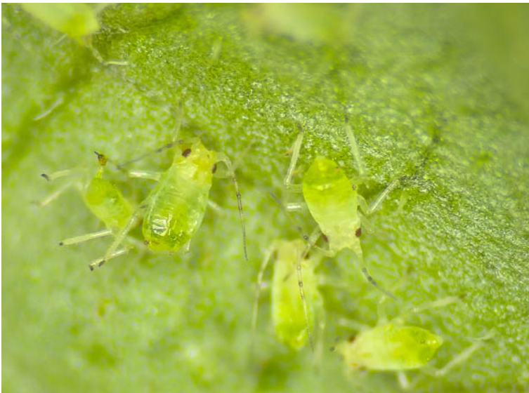
Green peach aphids feeding on coneflower.

There are several pesticides labeled for aphid control including Endeavor, Spirotetramat, Insecticidal soap such as M-Pede, and Acetamiprid.