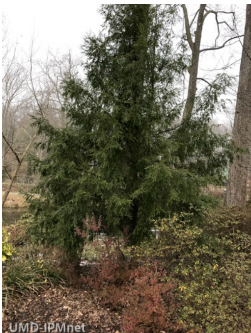
Tsuga chinensis at Brookside Gardens

One of the trees Phil and Jim showed me was the straight species Tsuga chinensis that they transplanted in 2013. It was 12 – 14 ft at transplant stage. It is now about 24 – 25 ft tall and growing in a wooded area. It looked good for foliage color and shape of a deltoid. There are hemlock wooly adelgids on native hemlocks but this tree is free of adelgids.