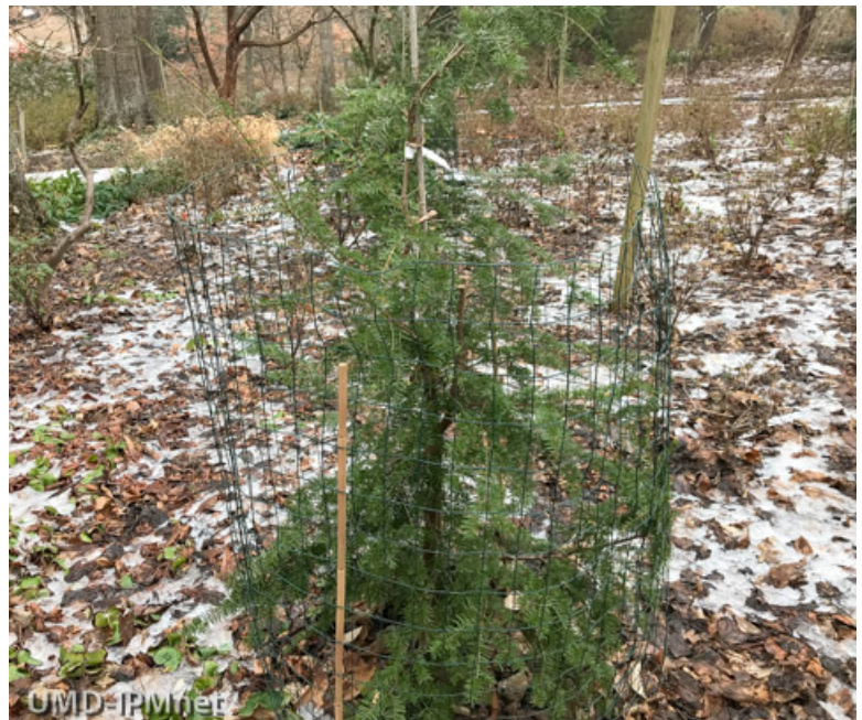
Hemlock hybrid - Tsuga chinensis x caroliniana at Brookside Gardens