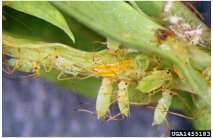
UGA1455183 An orange colored, legless aphid midge, Aphidoletes aphidimyza , larva on the underside of leaf surrounded by its aphid prey (yum!).

aphid infestations, I recommend waiting (do nothing) and let the aphid midges, along with aphid parasitoids, lady beetles, and syrphid flies come in and feast on the aphid populations. This suite of natural enemies can usually eliminate an aphid infestation leaving no need for pesticide applications.