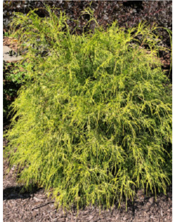
Sawara cypress prefers full sun to part afternoon shade

Chamaecyparis pisifera 'Filifera Nana Aurea' also known as Sawara cypress 'Gold Mop' or even Japanese false cypress is a dwarf, slow growing shrub that reaches 2-3 feet tall and wide when young and up to 5 feet tall when mature. The plants prefer to grow in full sun to part afternoon shade in average well drained soils. Plants can thrive in many soil types with acidic to neutral pH. During the heat of summer, the afternoon shade will keep the plants from sunburn, and the medium to dry soils prevent root rot. The foliage of golden yellow scale-like leaves cover very thin, whippy branches that arch and cascade, in an airy, lacey mop. Early in the spring, the color is extremely bright with the new foliage. The silhouette is a broad pyramid that glows in the sunshine. This plant is cold hardy from USDA zone 5-7. The golden yellow color provides a bright focal point in the landscape, both in the summer months as well as the winter months, and possibly looks best against a dark green background. 'Gold Mop' can be used in foundation plantings, informal or cottage gardens, rock gardens, small courtyard gardens, and as a specimen. Once established, 'Gold Mop' can be drought tolerant and needs only light pruning. Root rot and juniper blight are occasional disease problems and bagworms can become an insect pest.