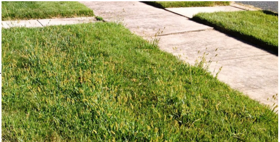
A lot of giant foxtail is growing in this turf area

Leaf blades of giant foxtail can be up to sixteen inches in length, and width is between one-half and one inch. The leaf blade upon close examination has small hairs covering most of the upper surface and margin except near the leaf base. The inflorescence, (flower and seed