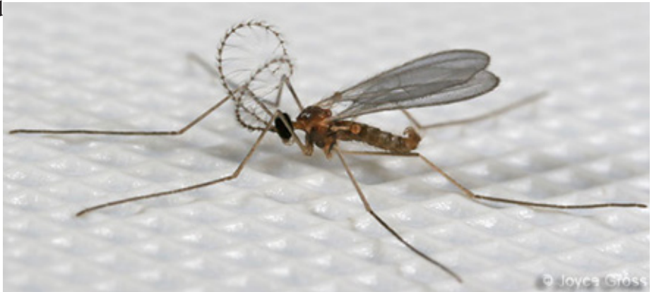
An adult aphid midge, Aphidoletes aphidimyza . Note the long legs and antennae, and slender body that are characteristic to midge adults.

Midges are true flies (order: Diptera) and many are in the family Cecidomyiidae. Some Cecidomyiids are gall making midges and attack plants, while others are predatory and feed on spider mites and aphids. Examples of common plant feeding midges are boxwood leafminer and fungus gnats which are often considered pests. Two common predatory midges are Aphidoletes aphidimyza which feeds on aphids, and Feltiella spp. which are great predators of spider mites. Adult midges are “mosquito-like” in appearance. They are about 2-3 mm in length and have long legs and long thin antennae. Immatures or midge larvae, a.k.a maggots, are legless and tend to be tapered in appearance. The wider end is the posterior and the tapered end is the anterior where the mouth is located. There are 3 instars (larval stages) which start off very tiny and in the last instar reach only 2-3 mm in length.