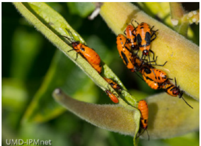
Milkweed bugs feed on the pods

Ron Miller, Super Lawns, found milkweed bug nymphs this week. Most likely they are large milkweed bugs, but there is also a species that is similar called small milkweed bugs (which are actually about the same size). Both milkweed bugs feed on the pods, but the small milkweed bug is also a predator of other insects. Since they show up later in the season, they are rarely a problem for the plants.