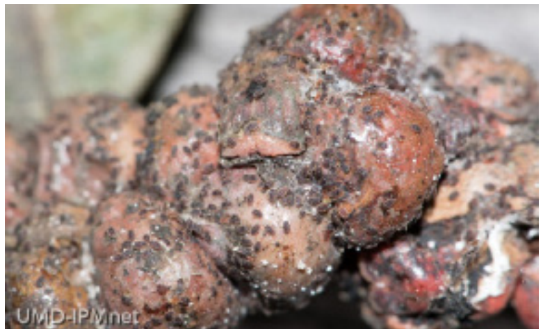
Check tuliptree scale infestations for crawlers

I examined tuliptree scale in the New Windsor area on Sunday and crawlers were just starting to emerge. Check deciduous magnolia for this soft scale. Systemics such as Dinotefuran work on this scale. Talus and Distance applied at the crawler stage are very effective.