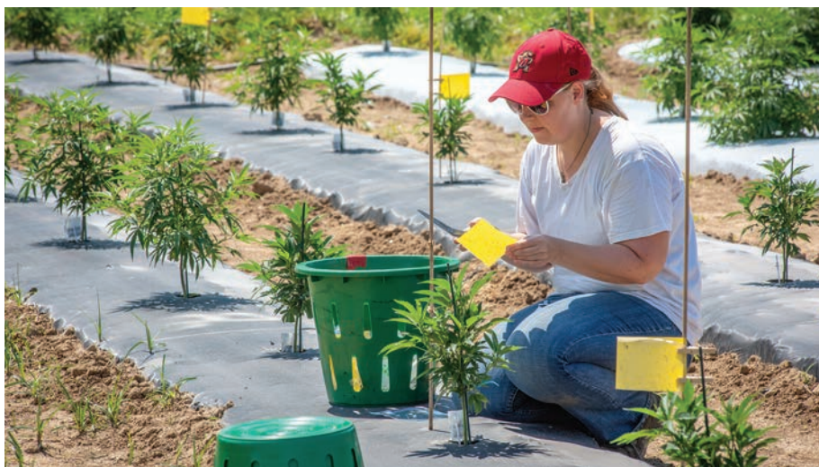
Industrial Hemp Research