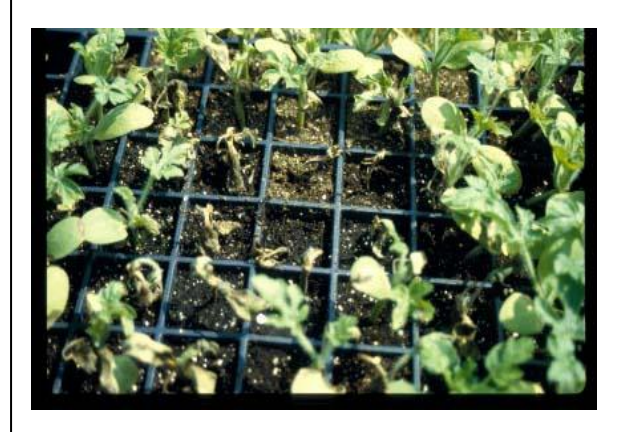
Figure 5. Many diseases in the greenhouse will appear in disease foci (clusters in an area around the initial infected seedling).

If the seedlings appear diseased, destroy every tray that has symptomatic plants. Remove adjoining trays to a separate area for observation. Monitor these seedlings daily and destroy trays where symptoms develop. Do not transplant any trays containing plants with disease symptoms.