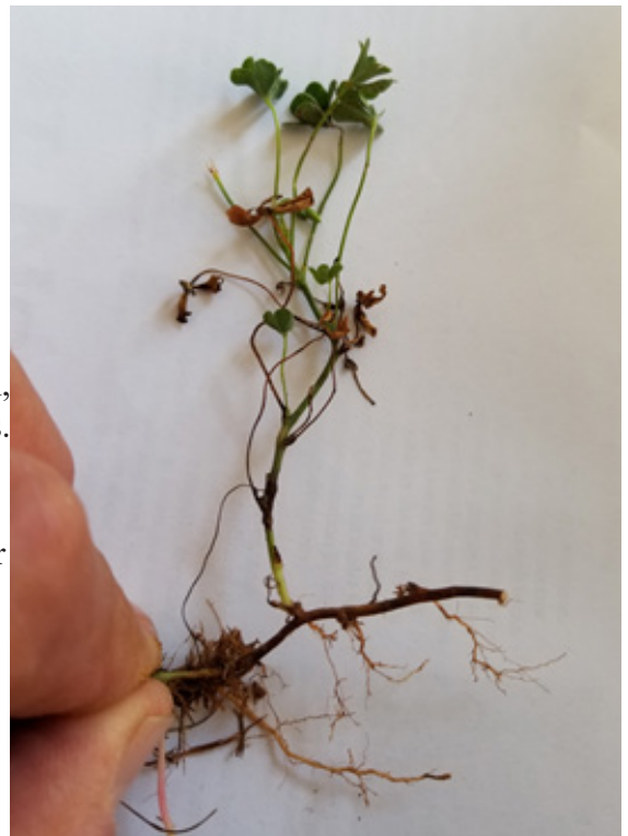
Common yellow woodsorrel roots at the nodes

A sample of this plant came into my office this morning. A retired public servant (police officer) wanted to know what was taking over the lawn. An easy identification, this person wanted to know if the lawn had a chance. Common yellow woodsorrel ( Oxalis stricta ) is a weed common to the northeast. It is often found in shaded areas and grows primarily as an annual or on some occasions a weak perennial lasting several years. It appears late in the season as it is a late germinating weed. This plant is a low growing plant and roots at nodes. It produces seed and can spread by way of rhizomes. The flowers are yellow, with five petals. The leaves are alternate, smooth, palmately compound and are divided into three heart-shaped leaflets. When stressed, the leaves may take on a red to purplish color. The seed pods will bend distinctly upright on the stalks, thus the name stricta , meaning more in an upright fashion. Each leaflet has a center crease allowing the leaf to fold upward in half. The plant will fold its leaves at night and reopen them in the morning. Each seed pod has 5 separate capsules with about ten seeds per capsule. They will dehisce, or explode when touched sending the seed up to ten feet away.