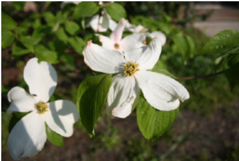
From spring flowers (and bracts) to bright red fall fruit on Cornus florida (flowering dogwood)