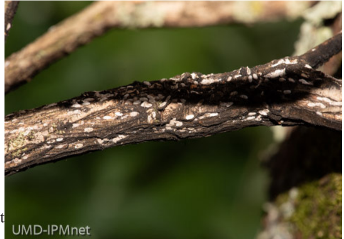
This azalea bark scale on Pieris was in the crawler stage in May and early June.