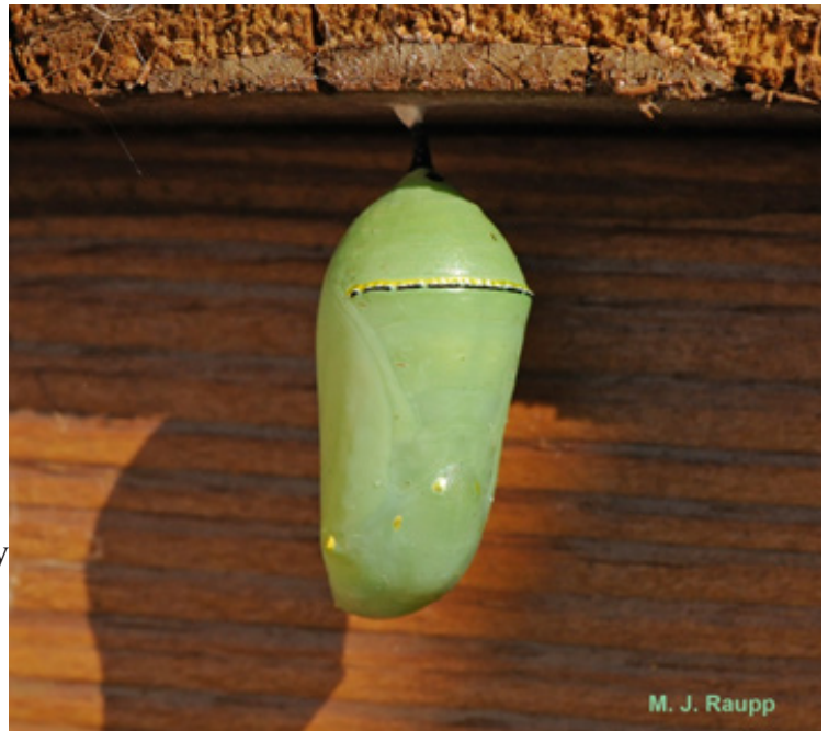
Late instar Monarch caterpillars often move away from milkweed to other plants or locations to form their chrysalis and transform into beautiful adult butterflies.