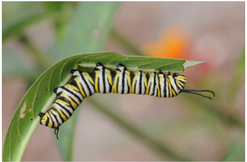
Late instar Monarch caterpillars feeding on milkweed foliage.

You have likely heard discussion regarding monarch decline. Anecdotal observations and monitoring data indicate there has been a long term decline in monarch populations since about the mid to late 1990’s. Monarch populations in their overwintering habitat in Mexico are now at their lowest numbers since data started to be collected and recorded about 20 years ago. There has been much effort towards identifying causes of monarch decline. Like most of these situations it does not appear to be just one factor. Factors include destruction of overwintering habitat, the adoption of herbicide (glyphosate) tolerant crops that ultimately reduce milkweed abundance, infection by the disease Ophryocystis elektroscirrha , and parasitism by a tachinid fly, Lespesia