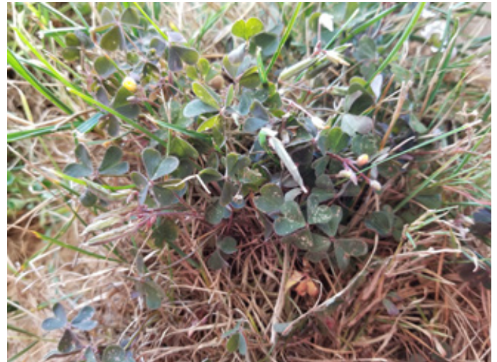
When stressed, leaves of common yellow woodsorrel may take on a reddish color