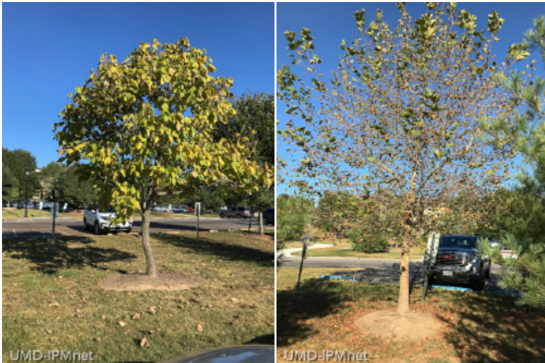
Landscape trees in North Carolina are also struggling during an extended period of high temperatures and dry periods

We are moving into one very dry fall, and it will affect the health of trees this fall and survival over the winter. For newly transplanted trees try to keep them watered until this dry period lets up. We might get some small relief on Monday but other than this it looks – dry, dry, dry! Make sure your customers water plant regularly that went into the landscape in the last 2 years or it will suffer badly. The good news is this is NOT boxwood blight type weather as we saw in the fall of 2018. Count your blessings.