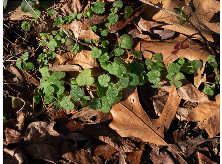
Deadnettle is growing around the research center in Ellicott City on February 21st.