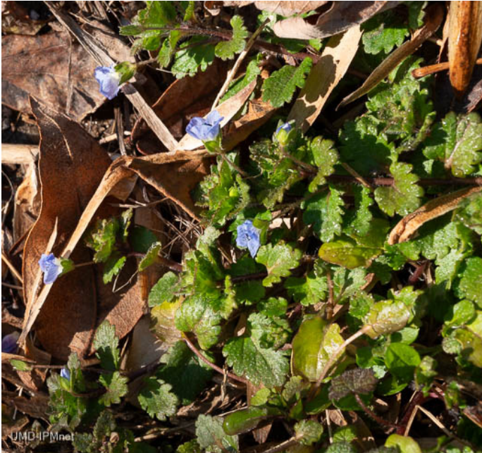
Speedwell is blooming at the research center in Ellicott City as of February 21st.

It reached 61 °F on February 9 and the cool season weeds are rejoicing. We are seeing all of the cool season weeds that germinated last fall greening up rapidly and they will be ready to go as soon as the weather stays warm for longer periods in March and April. On Monday, February 26, it's supposed to go back up to 60 °F. Be prepared for a strong weed crop in 2024.