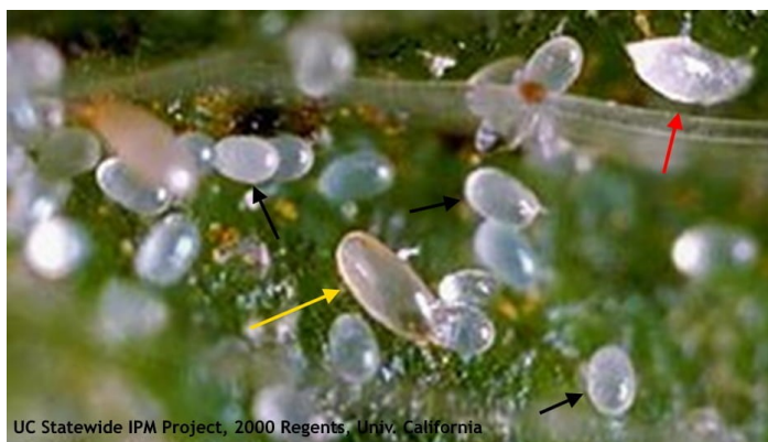
Figure 1. Adult female cyclamen mite (yellow arrow), eggs (black arrows) and larva (red arrow).

Cyclamen mites have been found in a few mid-Atlantic strawberry fields as well as more widespread to the south of us in North Carolina. Once we start to warm up they may become more of a problem along with two-spotted spider mites. The cyclamen mites have been found most often in plasticulture strawberries and less often in matted row systems. Usually cyclamen mites ( Phytonemus pallidus ) cause much of their damage to bedding plants, but they also can cause significant problems in strawberries. Adult cyclamen mites are usually never seen as they are only a quarter of a mm long and a 20X hand lens or dissecting microscope is needed to see them.