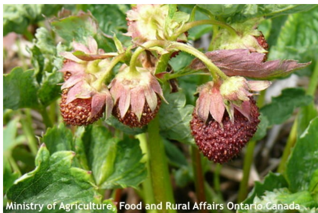
Figure 3. Cyclamen mite damage to strawberry fruit—protruding seeds .

Early detection of cyclamen mites is essential in achieving best control. Thorough spray coverage of the crown leaves is important for good control, so high volumes of water are needed (60-100 gal/a). Horticultural oils can be used if temperatures are below 88 °F. Agri-Mek SC or Portal XLO also can be used for mite control. Predatory mites can be used and work best if cyclamen mite populations are small and confined to scattered hot-spots in a field.