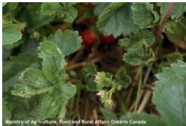
Figure 2. Cyclamen mite damage to strawberry—crinkled deformed younger leaves.

Cyclamen mites use their piercing-sucking mouthparts to feed on plant material. Symptoms of infestation can be found throughout the plant. However, at low populations, cyclamen mites can usually be found along the midvein of young, unfolded leaves and under the calyx of newly emerged flower buds. As numbers increase, mites can be found anywhere on the plant. The infested leaves will appear stunted and crumpled (Fig. 2), while flowers wither and die and fruit becomes shrunken with protruding seeds