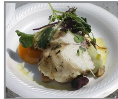
Delicious Chesapeake Bay Blue Catfish

Blue Catfish on campus and includes it in menus and promotions. An estimated 7,265 pounds of blue catfish were served on campus during the fall 2019 semester.