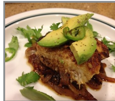
Greens on blues, a Latin-inspired Dish with Chesapeake Bay Blue Catfish