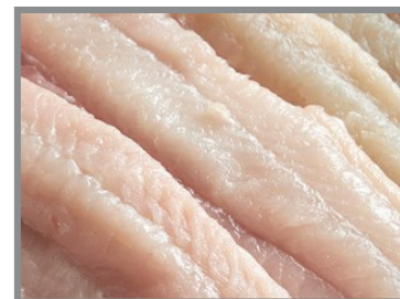
Chesapeake Bay Blue Catfish Fillets