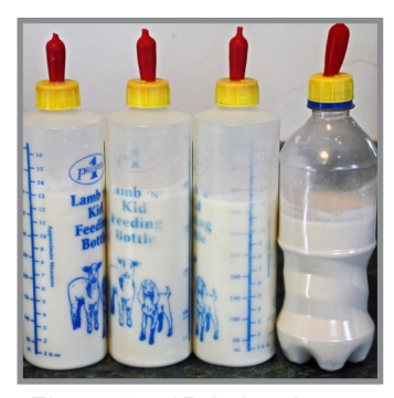
Figure 2a. *Pritchard teat with bottle.