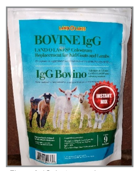
Figure 6. *Colostrum replacer.