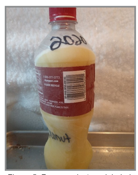
Figure 5. Frozen colostrum labeled with goat's name that produced it and year produced.

Colostrum replacers may be difficult to tube feed since they are thick. Tube feeding thick colostrum may require using a plunger on the catheter tip syringe to force it through the tube. This is different than tube feeding milk which should be gravity fed.