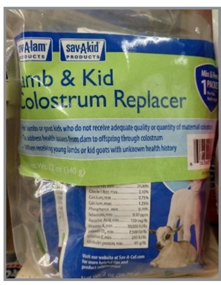
Figure 7.*Colostrum replacer