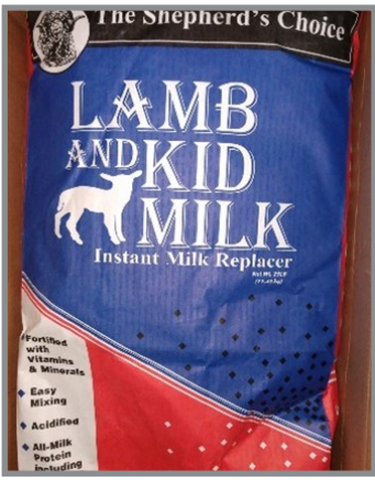
Figure 9.*Lamb and Kid Milk replacer

Measure the powder carefully with the enclosed cup or weigh the powder if the directions indicate the required pounds or ounces.