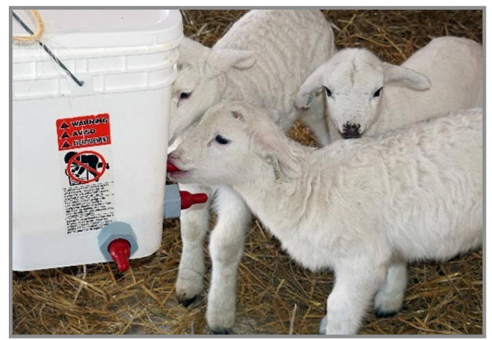
Figure 4. Lambs nursing from a bucket feeder.

Pan feeding is another lesser-known type of limit feeding for lambs and kids. Lambs or kids are given a set amount of milk, but instead of using a bottle, they drink it from a pan or bucket. This system may work better for lambs and kids that are orphaned at older ages and refuse a bottle but are not quite old or large enough to be weaned onto hay and feed only. While the pan option makes cleaning equipment easier, drinking from a pan or pail is not optimal. When lambs and kids nurse from teats and nipples, the position of their heads and necks causes the esophageal groove to close and allows milk to bypass the rumen where it would undergo fermentation and go