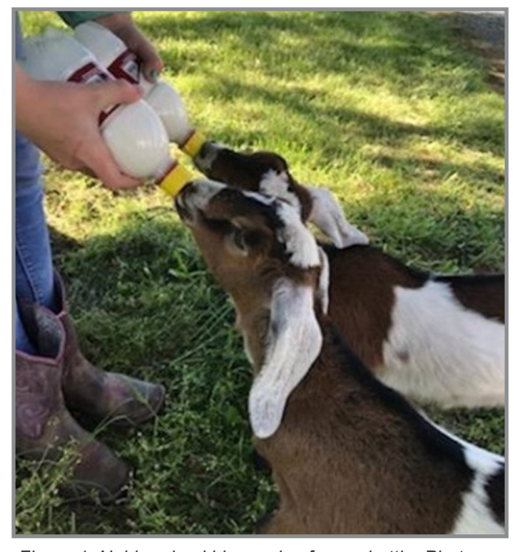
Figure 1. Nubian doe kids nursing from a bottle

If a doe or ewe has a large litter and one or two must be pulled to bottle feed, producers need to consider a few factors. Often it is appropriate to pull and bottle feed the odd-sized lamb or kid. These may be a lot smaller or larger than the rest of the litter. Small lambs and kids may need extra help and benefit from being put on a bottle. Kids and lambs that are much larger than their littermates may overpower the rest of the litter. Lambs and kids matched closely in size should usually be left on their dam. If all lambs and kids are close in size, personal preferences may determine which are pulled for bottle feeding. For example, if one is being kept as a replacement female and having tame animals is desired, then that lamb or kid may be chosen.