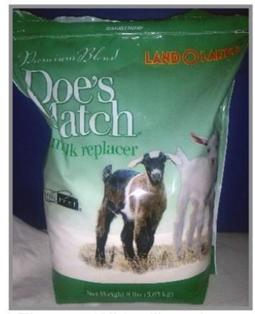
Figure 8.*Kid milk replacer

Species-specific milk replacer is the best option for artificially rearing baby animals (Figure 8 and 9). When choosing a milk replacer, select a high-quality milk replacer made with milk proteins for the species being fed. It is important to carefully follow the directions when mixing the milk replacer. The manufacturer will recommend a temperature for the water used to mix the milk replacer. Using the proper water temperature will help ensure that the powder is thoroughly dissolved. There is usually a measuring cup with the milk replacer.