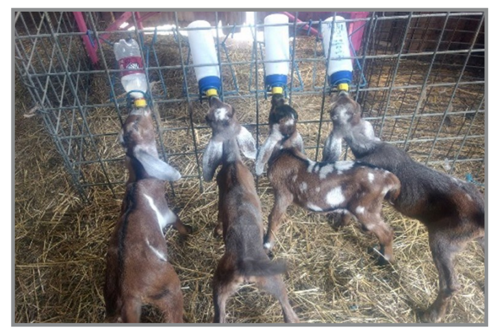
Figure 3. Kids nursing using individual bottle racks.

Milk must be kept cold so that it does not spoil and the babies do not overeat. There are several types of bucket feeders available from different manufacturers. Some have nipples placed at the bottom of the bucket and others have nipples near the top of the bucket with tubes that run to the bottom of the bucket. Buckets with tubes may be more difficult to keep clean. With this method, lambs or kids are fed milk with a bottle until they are strong enough to be trained to eat from the lambar or bucket feeder.