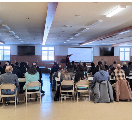
HAY & PASTURE CONFERENCE

Recently, Maryland Department of Agriculture and Freedom AG and Energy recently partnered with University of Maryland Extension to deliver local farmers three workshops which provided an overview regarding pesticide record keeping and storage, productive crops, soil health, nitrogen management, pest management, produce safety to name just a few topics. Farmers were able to obtain Private Applicator Pesticide and Nutrient Applicator Vouchers and Consultant recertification credits for attending.