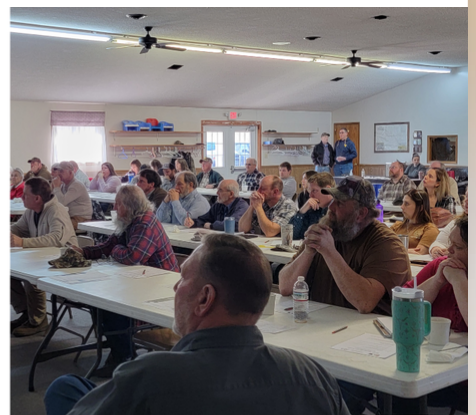
WESTERN MD AGRONOMY MEETING