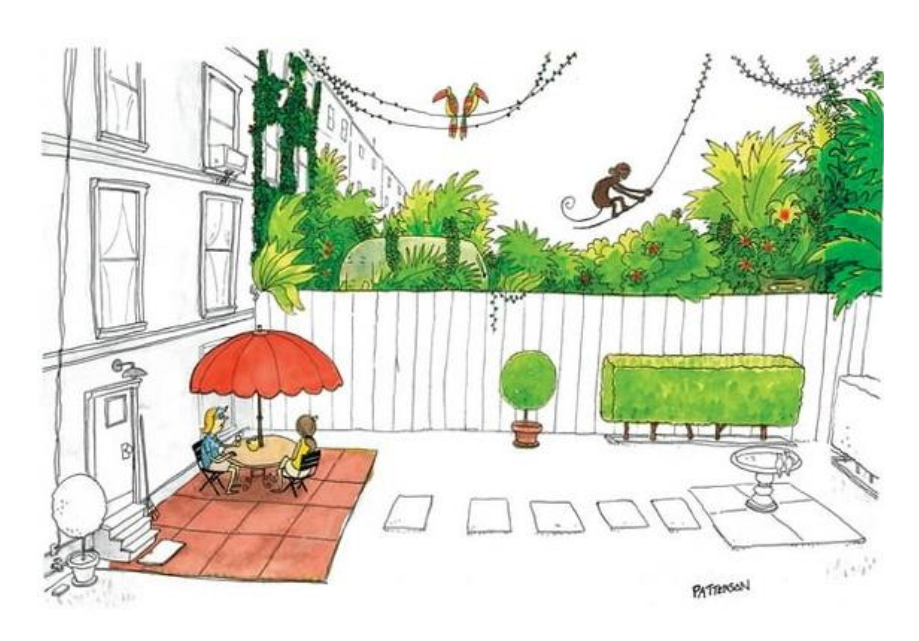
"Boy, they really let their yard go."