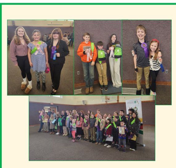
What a great turnout we had at the Central Cluster Maryland 4-H Public Speaking Competition! Congratulations to all our youth who participated!

who were honored at the Maryland 4-H Awards Ceremony in February. We had over 20 youth