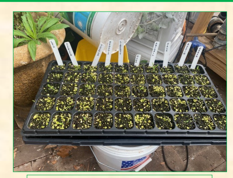
Harvested seeds planted.