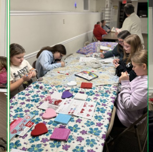
Members painting rocks for Inspire Thurmont Community Service Project.