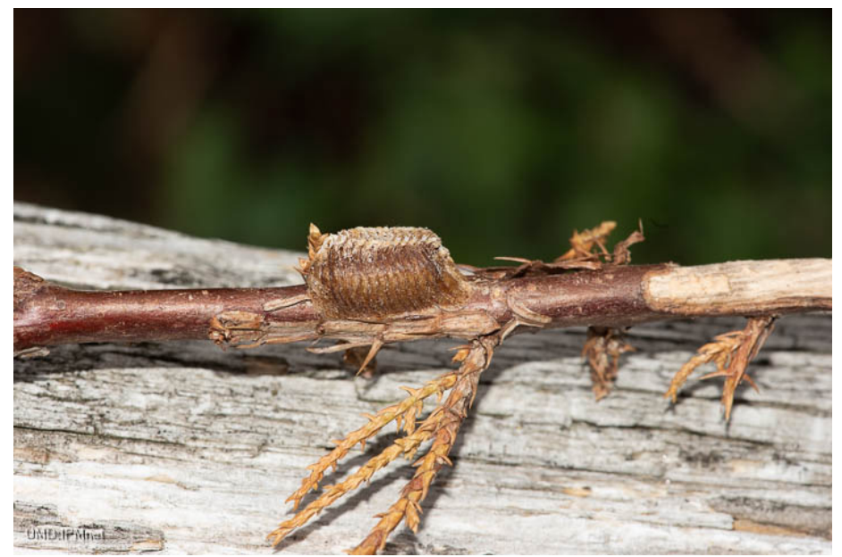
Egg masses of Carolina praying mantids are more narrow than the larger, rounder Chinese mantid egg cases.

Go this Marylandbiodiversity.com page to see the color variation - <u>https://maryland-biodiversity.com/media/species/2636</u>.