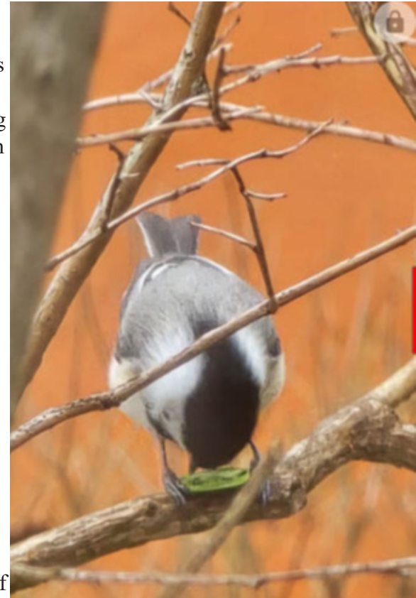
larvae that it picks out of the leaves.

Birds are significant predators of beetles, caterpillars, flies, ants,