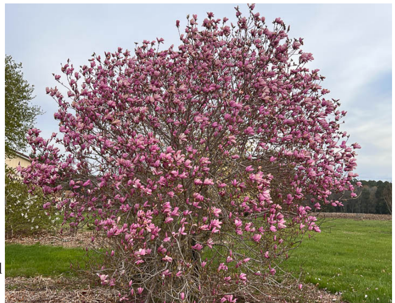
acidic, moist but well drained soils. A layer of 2-3 Magnolia 'Jane' in full bloom. inches of mulch will protect the roots, which when

planted prefer not to be disturbed again. Once