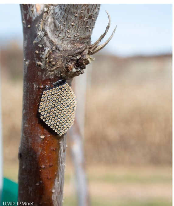
Look for wheel bug eggs on small trunks of young trees and small branches.

When there are no leaves on the trees and shrubs is a good time to look for egg masses of some of the beneficial insects.. Depending on the weather, look for them hatching starting this month into May.