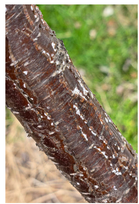
Look for crawlers of white prunicola scale in May.