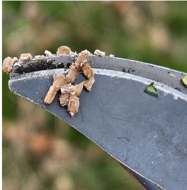
Look closely for spotted lanternfly eggs on tree trunks and branches (left). See the what the eggs look like closeup after being scraped off the tree (right).