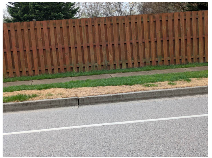
Salt damage in turf areas along the roadway.