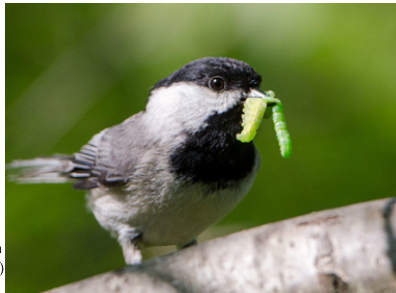
Chickadee eating a caterpillar.

whereas birds in other biomes (savannas, grasslands, agriculture, deserts, etc.) collectively consume the other 25% (~100 million tons). Some birds mainly forage on the ground or in leaf litter and feed on earthworms, spiders, and ground-dwelling insects, others catch flying insects, while others forage on the foliage or bark of plants for insect. Some birds, more generalists, will forage in all these habitats. For example, robins forage on earthworms and ground insects. Caterpillars on the foliage of vegetation are a favorite food of many birds such as tanagers, grosbeaks, and warblers. Swallows, swifts, flycatchers, some warblers and waxwings will pick off insects flying in the air. Hummingbirds, chickadees, and finches forage on aphids or other tiny crawling insects on foliage or flowers food (ex. image of the chickadee feeding on boxwood leafminer). Woodpeckers are dominant predators of wood boring insects (ex. emerald ash borer, EAB). Woodpecker activity on ash indicate the tree is infested with EAB.