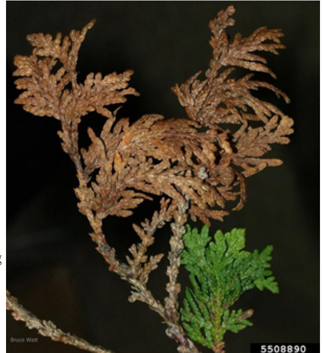
Phyllosticta needle blight on arborvitae

Both diseases are often associated with stressed trees. Shearing the foliage and winter injury can create wounds in which the fungi can easily enter and colonize the plant. When flagging or browning needles are observed, it is important to prune. Look carefully for cankers on those branches and prune them out, making sure to clean your tool between cuts. Avoid pruning in wet weather. Keep trees healthy, with steady irrigation, proper mulching, and avoiding over-fertilization is important to minimize stress. Avoid overhead irrigation reduce free