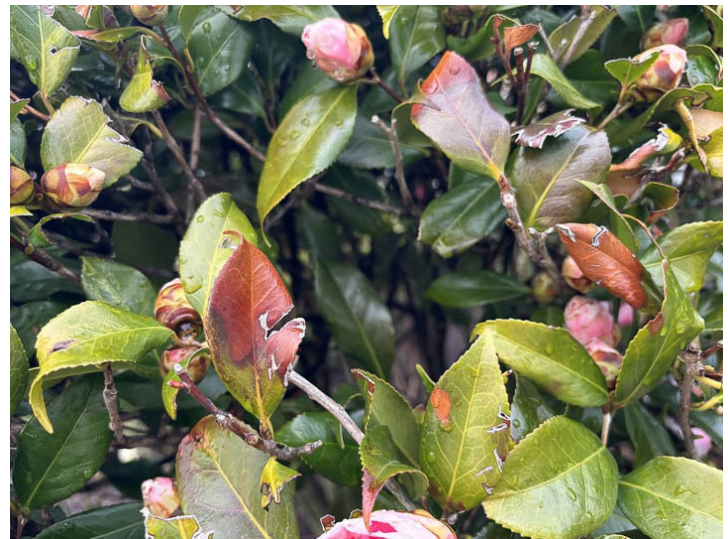
Winter burn on camellia foliage.

Plant damage from the cold and snowy winter can show up after we get beyond the winter season.