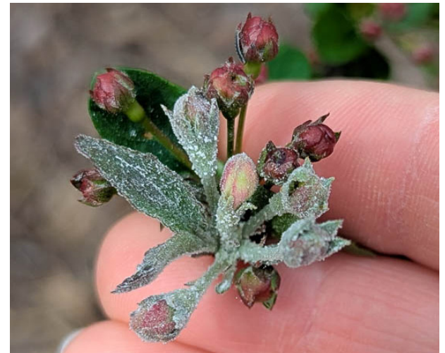
Powdery mildew infections are already showing up on trees, like this crabapple.