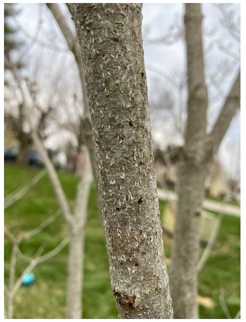
Look for crawlers of Japanese maple scale in late May into June.