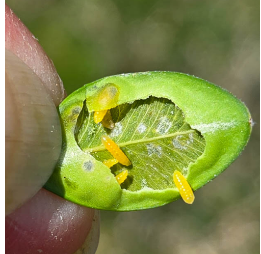
Boxwood leafminer larvae starting to turn orange indicating they are getting close to pupating.

Control Options: The larval damage has already been done, and they will be molting to adulthood too soon to apply anything that targets larvae at this time of year. The most efficient course of action at this point in time would be to wait for adult emergence. At peak adult emergence, you can apply a contact treatment before they lay eggs, but this timing window is relatively small (only a week or two).