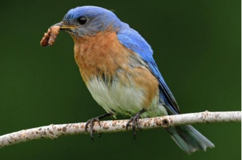
Bluebird with a caterpillar in its beak.

The type of insects a bird feeds on depends on the nutritional attributes of the insect prey (ex. moisture content, carotenoid levels), the habitat type it lives in, the time of year, and the needs of the bird. For example, birds that do not migrate will eat fruits and seeds in the cold months when insects are sparse. Breeding birds, even those that are usually non-insectivorous, actively hunt insects to feed their young which need protein rich insects. A recent robust study (Nyffeler et al. 2018) of different biomes (ecological zones) around the world found that forest dwelling birds consume about 75% (~300 million tons) of insects annually,