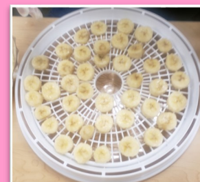
Program participant placing fruit on dehydrator. ( Above) .