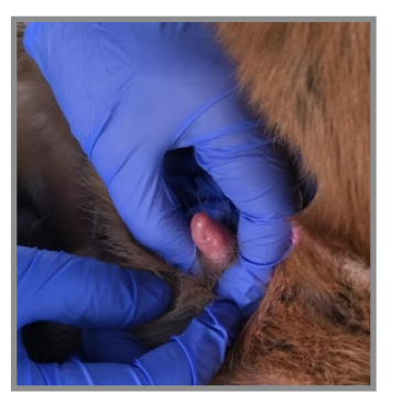
Figure 5. Buck kid with penis extruded