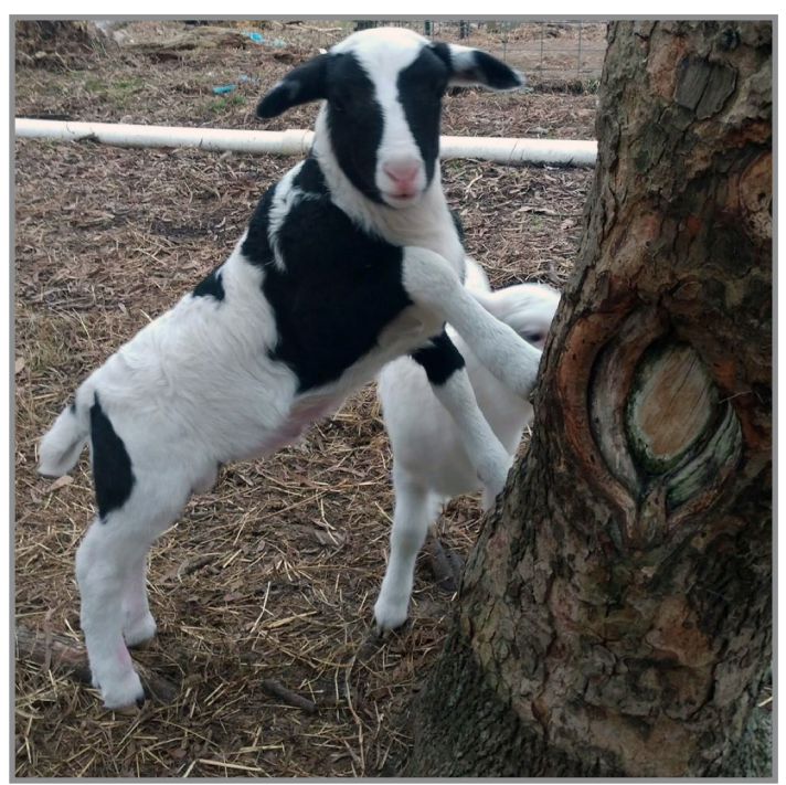
Figure 2. Smaller breeds of sheep may be easier for youth to handle