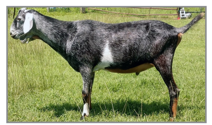
Figure 3. A Nubian buck posturing to urinate