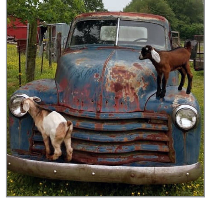
Figure 1. Goats are a great option for 4-H projects

Urinary calculi, also known as "urolithiasis" or "waterbelly," occurs when sediment (a concentration of mucus, protein and mineral deposits) accumulates in the